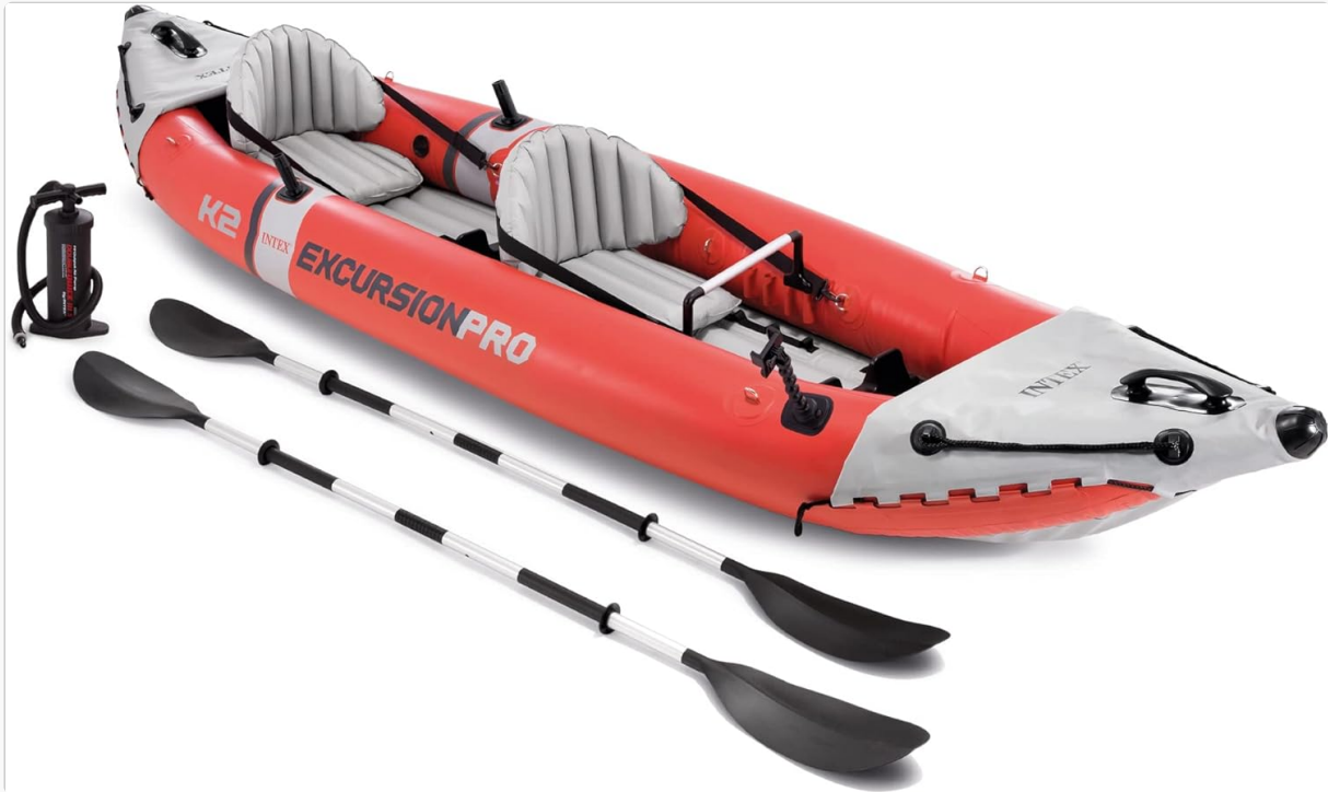
Figure 2: Intex Excursion Pro K2 Kayak with included pump and paddles.

The kayak features multiple air chambers for safety and rigidity. Use the included high-output air pump to inflate the kayak. Ensure all valves are securely closed after inflation. The kayak should be firm to the touch, but not over-inflated. Refer to the pressure gauge on the pump to ensure correct PSI levels as indicated on the kayak's surface.