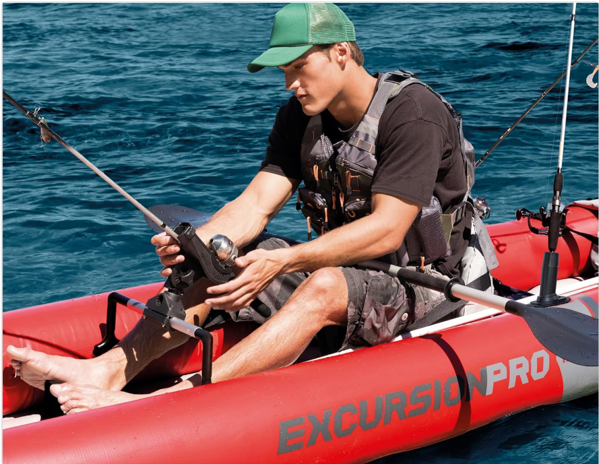
Figure 6: A user demonstrating the use of the fishing rod holder on the kayak.