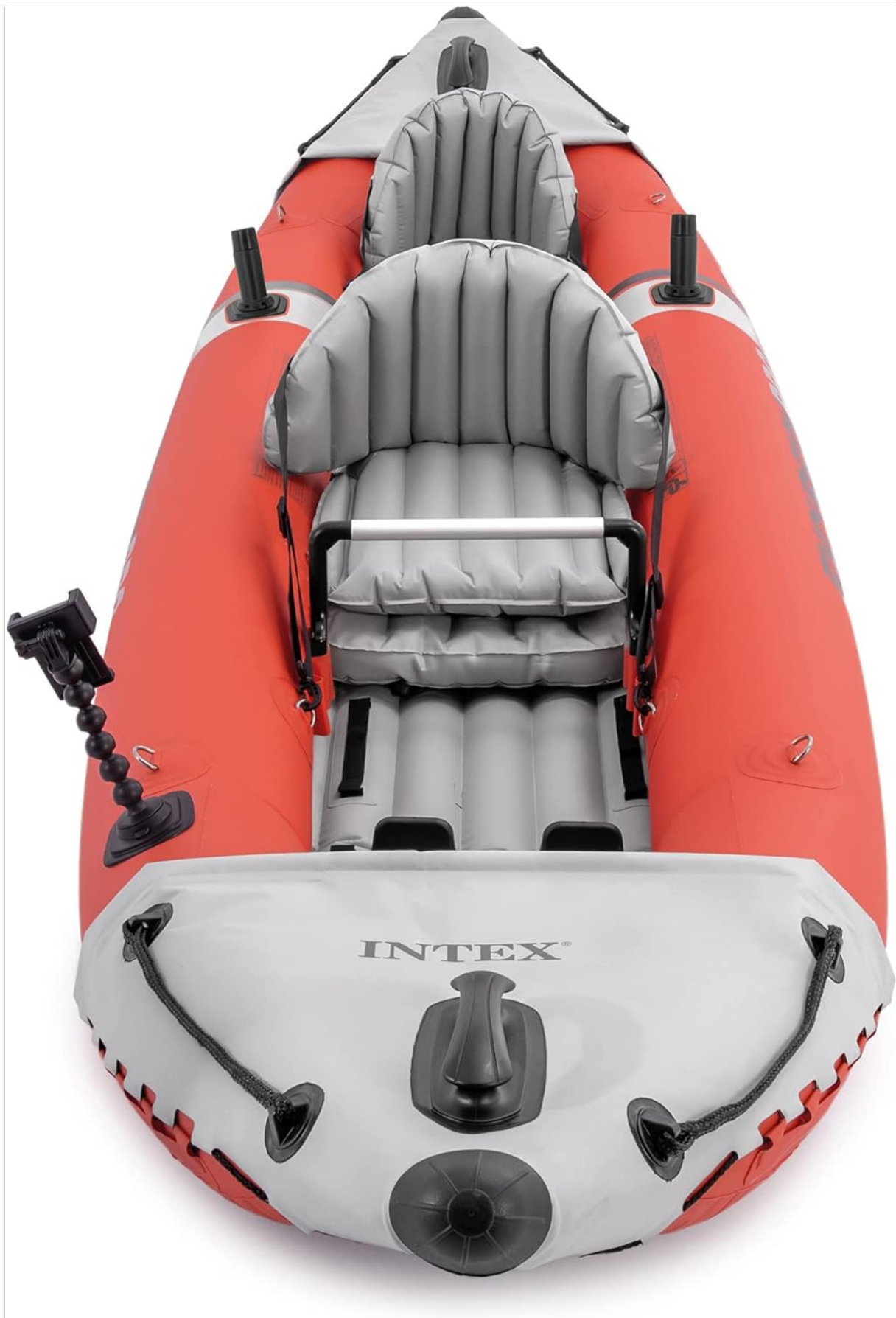
Figure 3: Top-down view of the kayak showing seat placement and adjustable footrests.