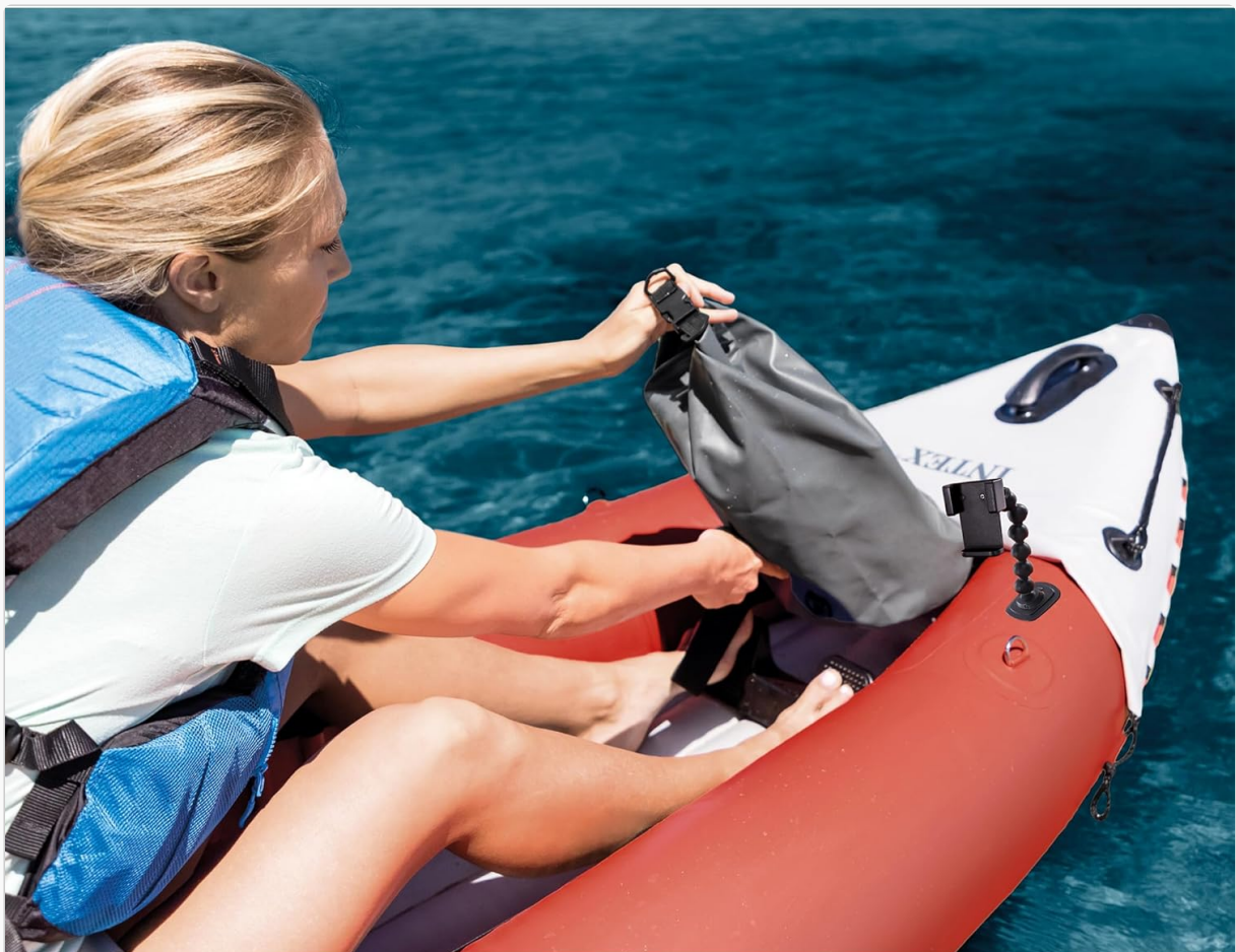
Figure 7: The bow storage area with D-rings for securing gear.