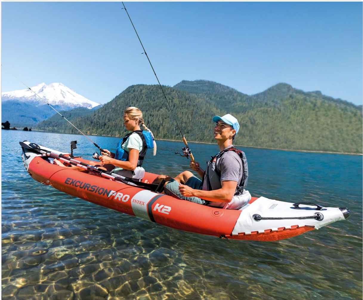
Figure 5: Two individuals enjoying fishing from the Intex Excursion Pro K2 Kayak.