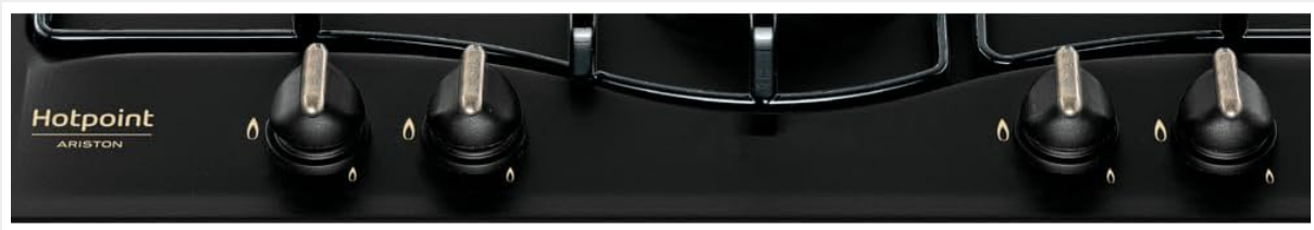
Image 3.1: Close-up view of the mechanical control knobs and ignition symbols on the Hotpoint gas hob.

If the burner does not ignite, repeat the process. If the issue persists, check the gas supply or consult the troubleshooting section.