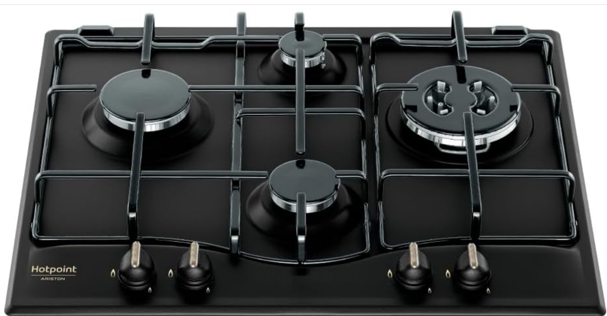
Image 1.1: Top view of the Hotpoint PCN 640 T(AN)R/HA Gas Hob, showcasing its four burners and control knobs.