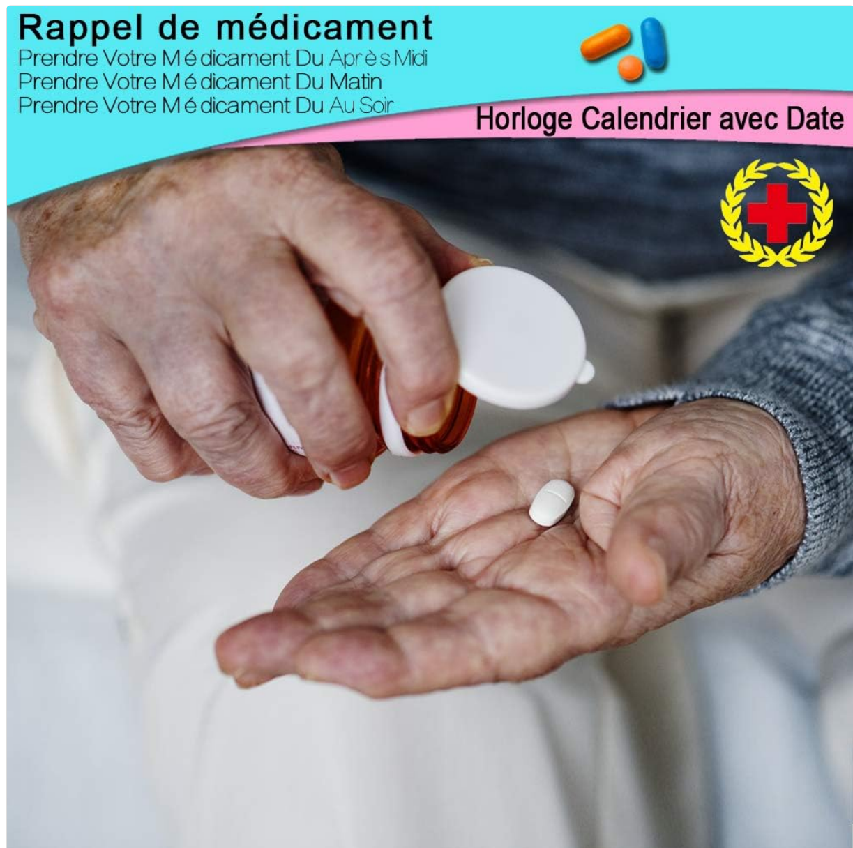
Image: The clock displaying a medication reminder, indicating its utility for scheduled tasks.

The clock can be programmed to display medication reminders. Consult the full manual for detailed instructions on setting specific reminder times and messages.