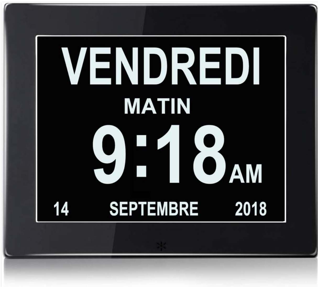
Image: Front view of the SENXINGYAN 8-inch LCD Digital Calendar Day Clock, showing the current day, time, and date clearly.