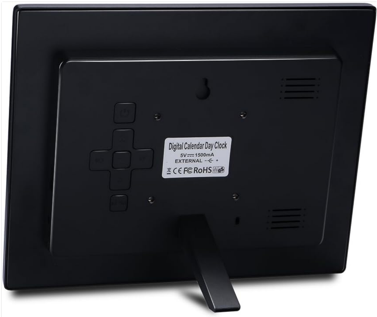
Image: Rear view of the clock, illustrating the power input and control buttons for setup.