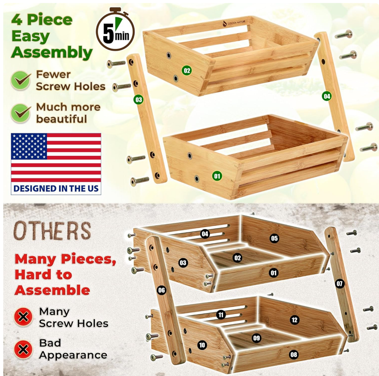
Image: This image shows the four main components of the fruit basket and the simple assembly process, indicating easy assembly.