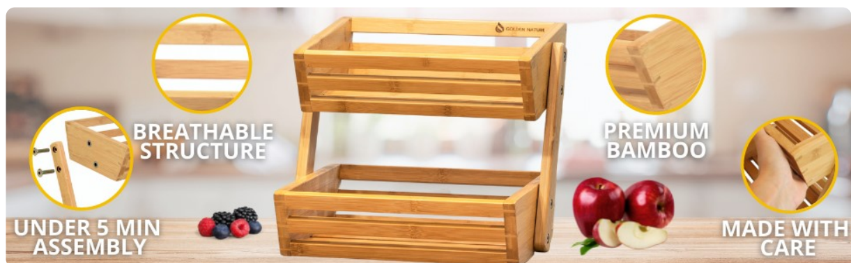
Image: This image highlights key features of the fruit basket: breathable structure, premium bamboo material, and careful craftsmanship.