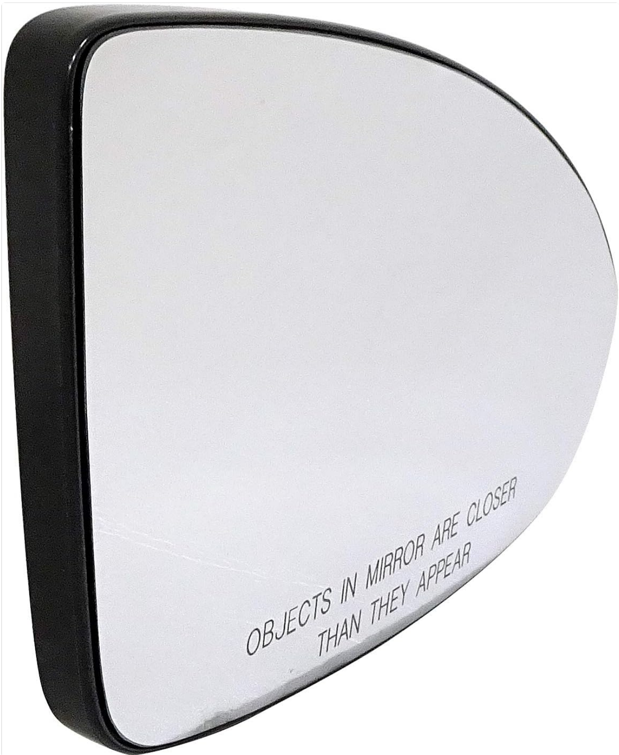
Image 1.1: Front view of the Dorman 55034 passenger side door mirror glass.