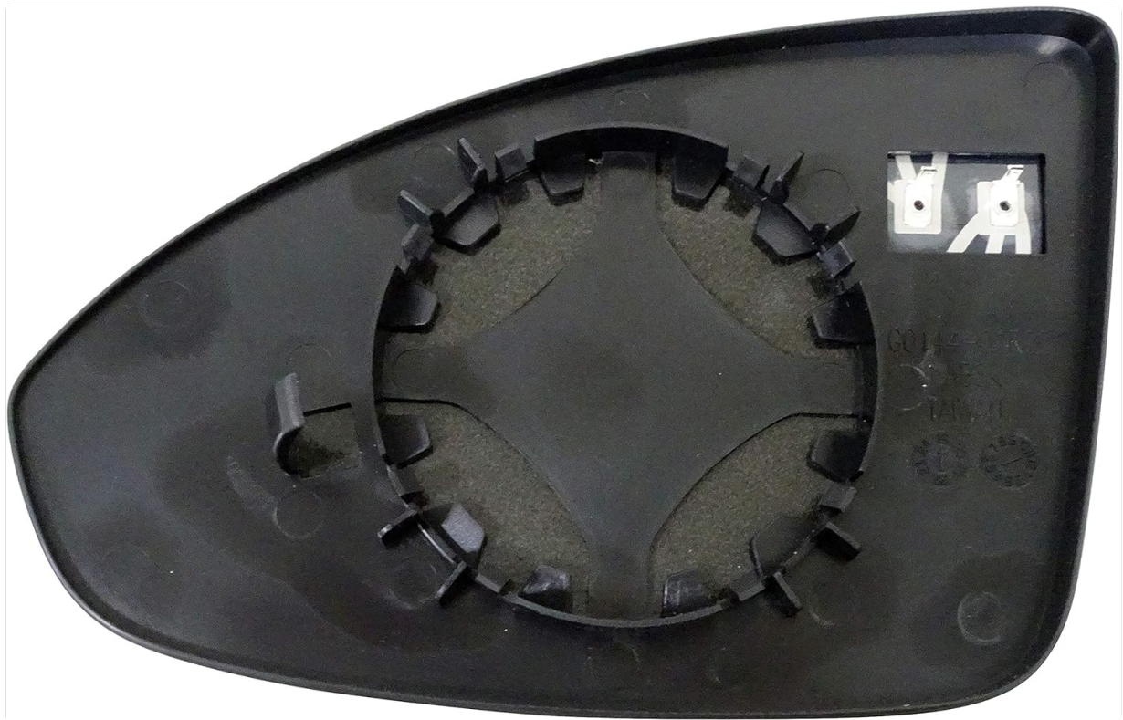
Image 5.1: Rear view of the Dorman 55034 mirror glass, highlighting mounting points and electrical connections.