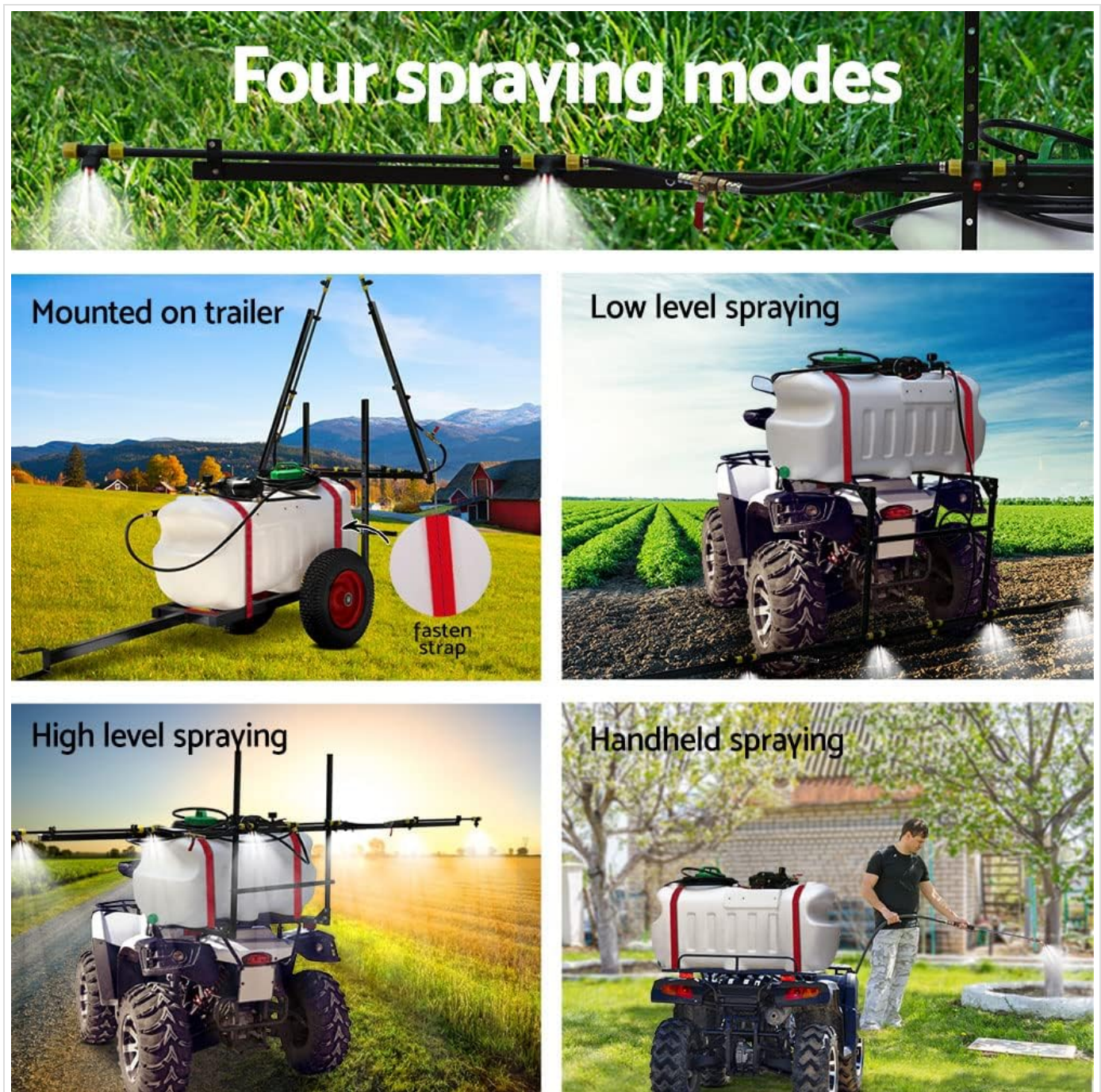
Figure 5: Visual representation of the four available spraying modes.