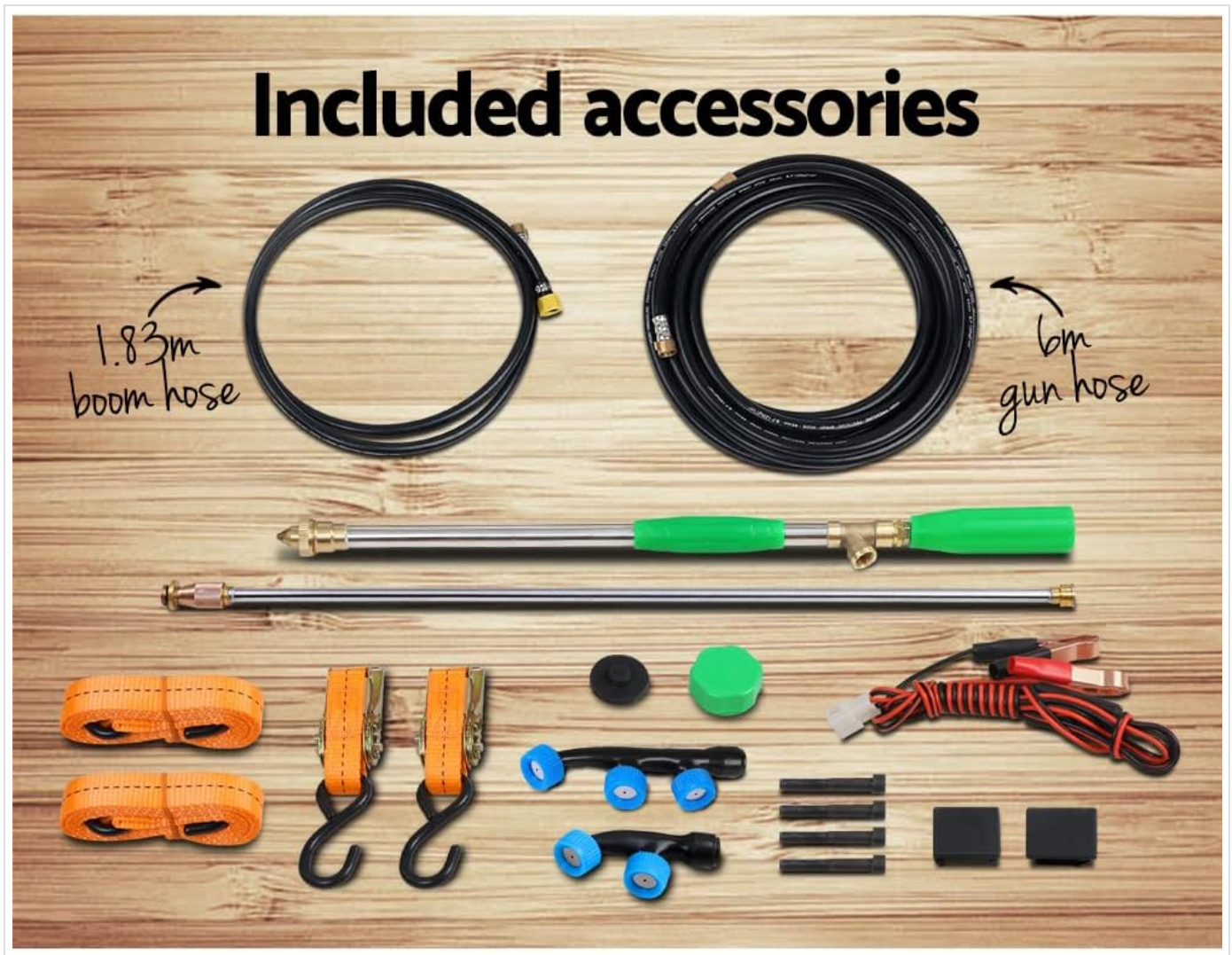
Figure 2: Included accessories such as hoses, spray wand, straps, and power cables.