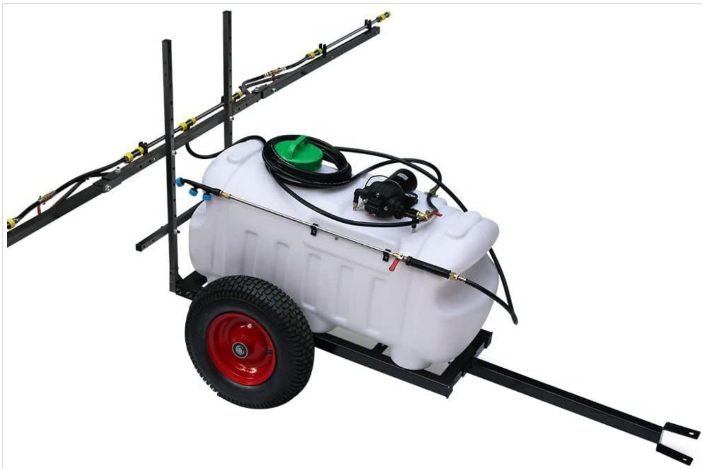
Figure 1: Overview of the GIANTZ ATV 100L Weed Sprayer with trailer and boom.

This user manual provides essential information for the safe and efficient operation, assembly, maintenance, and troubleshooting of your GIANTZ ATV 100L Weed Sprayer. Please read this manual thoroughly before operating the unit and retain it for future reference.