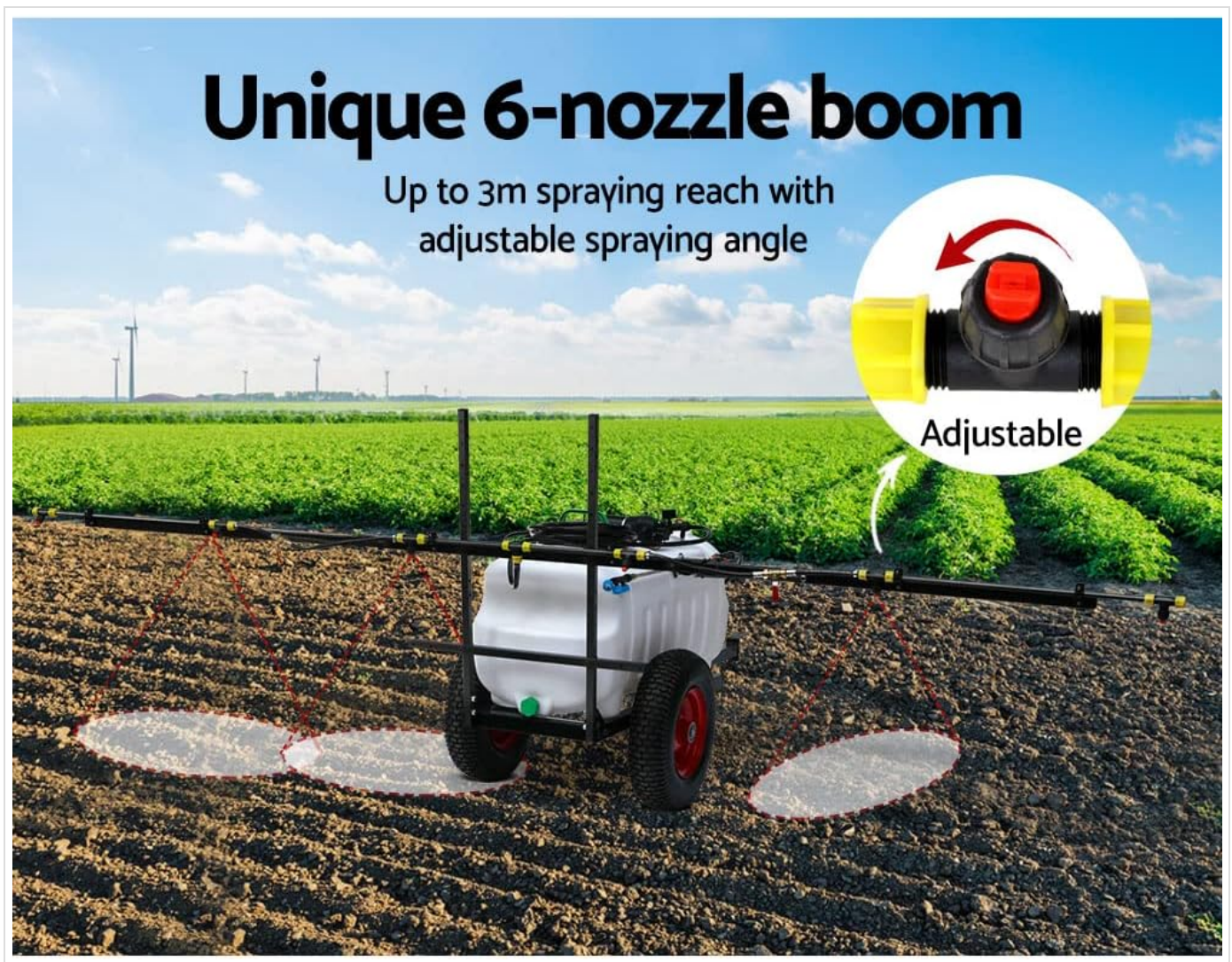
Figure 6: The 3m boom features 6 nozzles, each with an adjustable spraying angle for precise application.