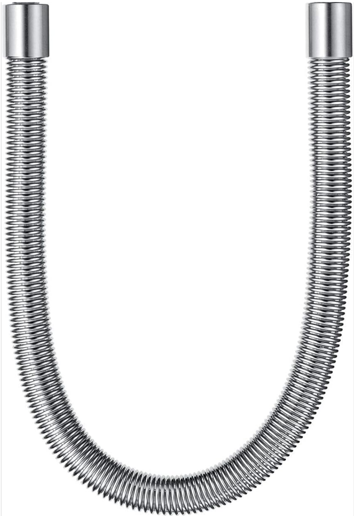
Figure 2.2: The Jura Milk Tube HP1, showcasing its stainless steel casing and connectors.