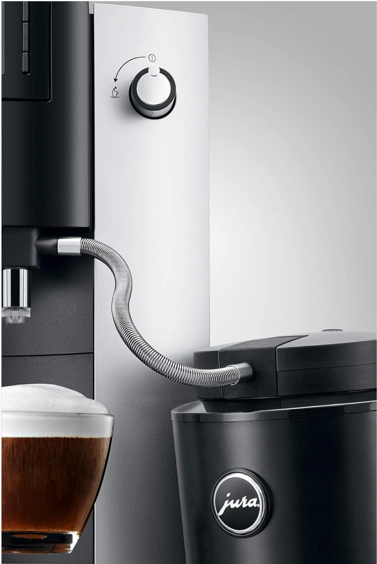
Figure 4.1: Jura Milk Tube HP1 connected to a coffee machine and milk container.

The milk tube is ready for use immediately after proper connection.