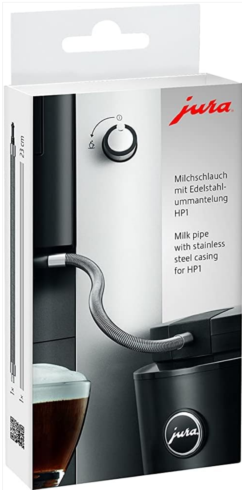
Figure 2.1: Jura Milk Tube HP1 in its packaging.