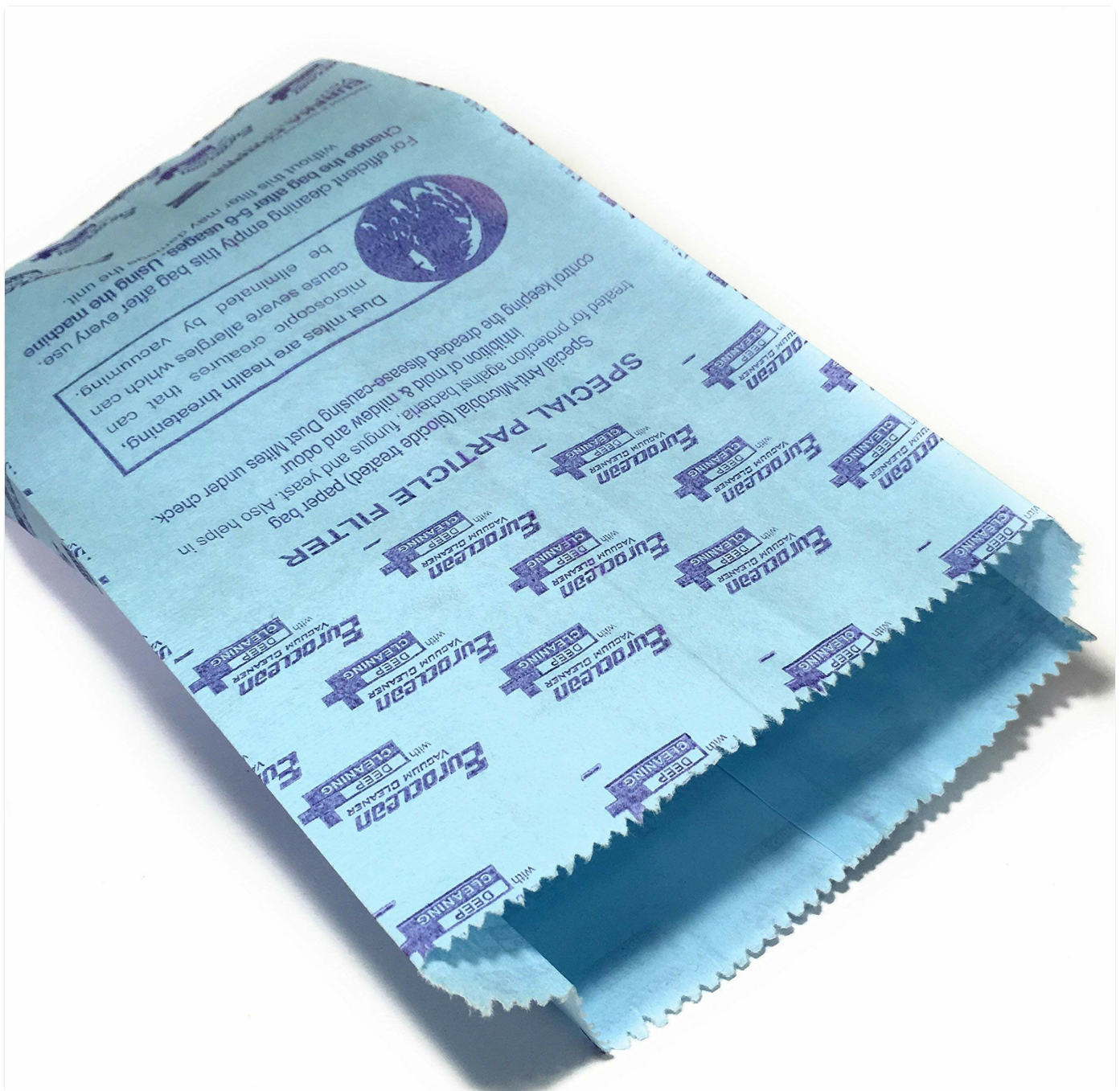
Figure 1: Eureka Forbes SmartClean Robos Dust Bag. This image shows the blue paper dust bag with "Euroclean" branding and text indicating its special particle filter properties.