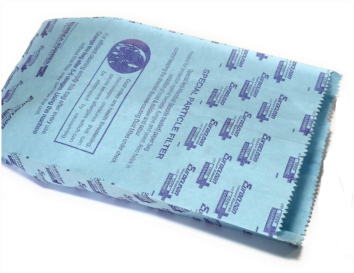
Figure 2: Close-up view of the dust bag's label, highlighting the maintenance instructions regarding emptying and changing the bag.

"For efficient cleaning, empty this bag after every use. Change the bag after 5-6 usages. Using the machine without this filter may damage the unit."