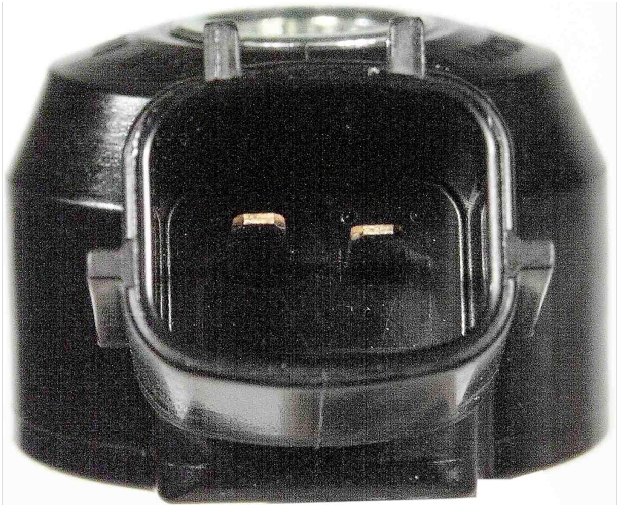
Figure 2.3: Close-up view of the electrical connector on the NTK ID0138 Ignition Knock Sensor. This shows the two-pin terminal design for vehicle wiring harness connection.