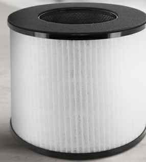
Image: Tenenergy Renair H13 HEPA Replacement Filter.