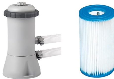
Figure 1: The Intex Prism Frame Pool set, including the pool, filter pump, and filter cartridge.