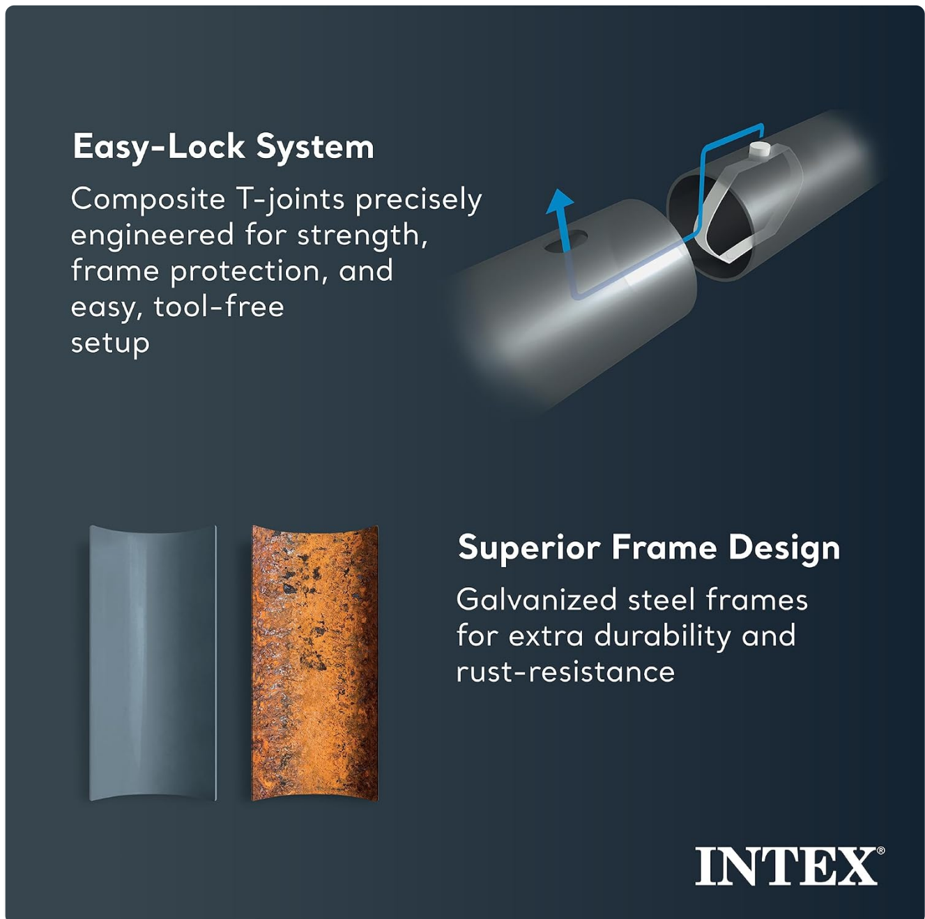
Figure 2: Easy-Lock System for tool-free frame assembly.

tools. While the manufacturer states a 90-minute assembly time, having at least two people will significantly ease the process.