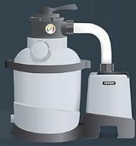
Krystal Clear™ Sand Filter Pump SX2100