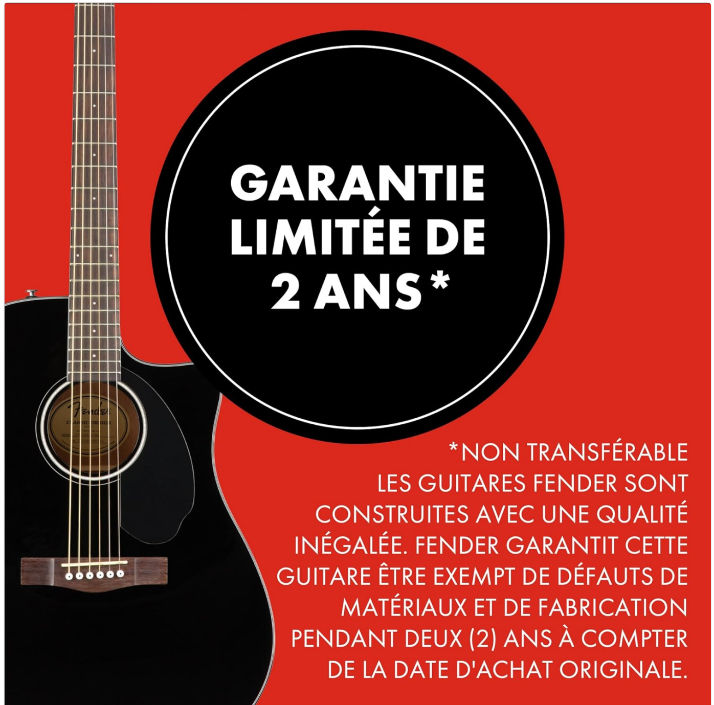
Figure 5: Fender's 2-year limited warranty details.

The Fender CD-60SCE Dreadnought Electro-Acoustic Guitar comes with a 2-year limited warranty from Fender. This warranty guarantees that your guitar is free from defects in materials and workmanship for two (2) years from the original date of purchase. This warranty is non-transferable. Please retain your proof of purchase for warranty claims.