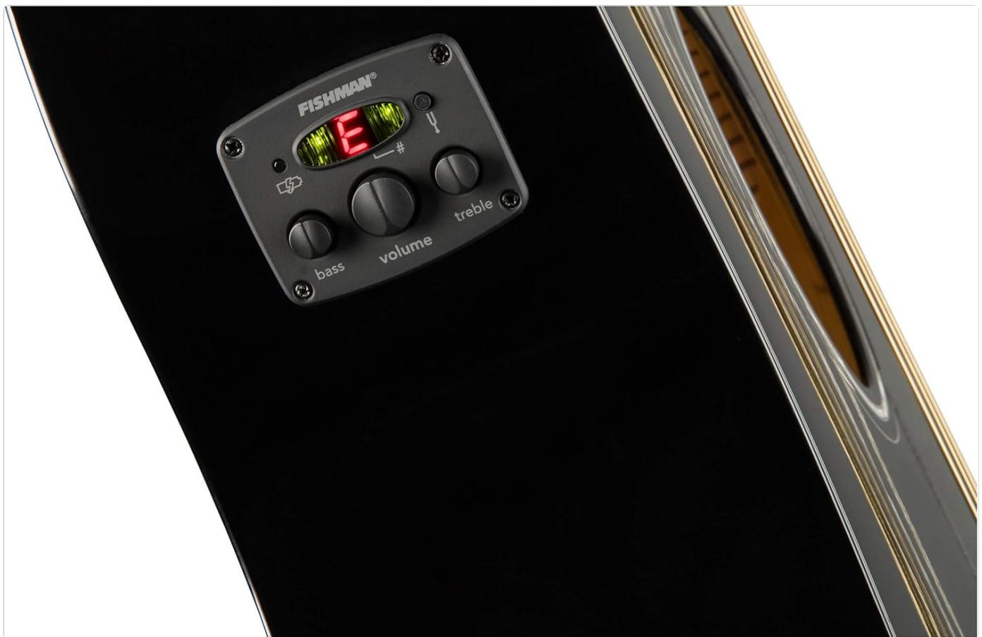
Figure 4: Fishman preamp controls.