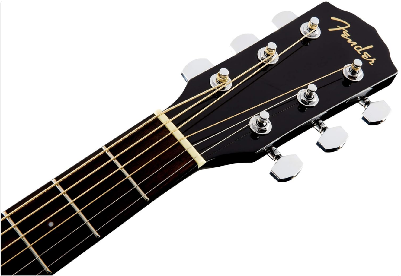
Figure 3: Headstock and chrome die-cast tuning machines.