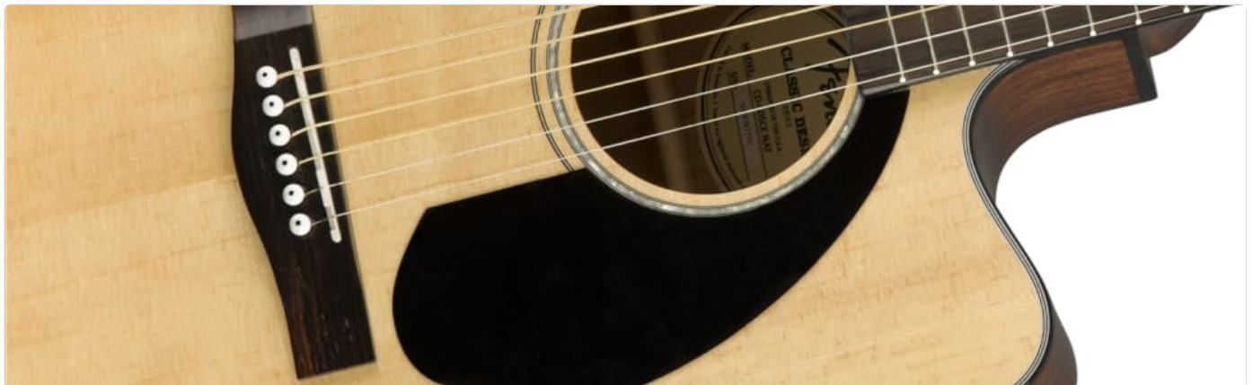
Figure 2: Key components of the Fender CD-60SCE guitar, highlighting the die-cast chrome tuners, easy-to-play neck, mahogany back and sides, dreadnought cutaway body, solid spruce top, and integrated Fishman pickup, preamp, and tuner.