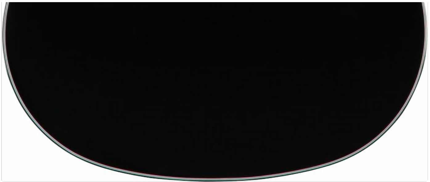
Figure 1: Front view of the Fender CD-60SCE Dreadnought Electro-Acoustic Guitar.