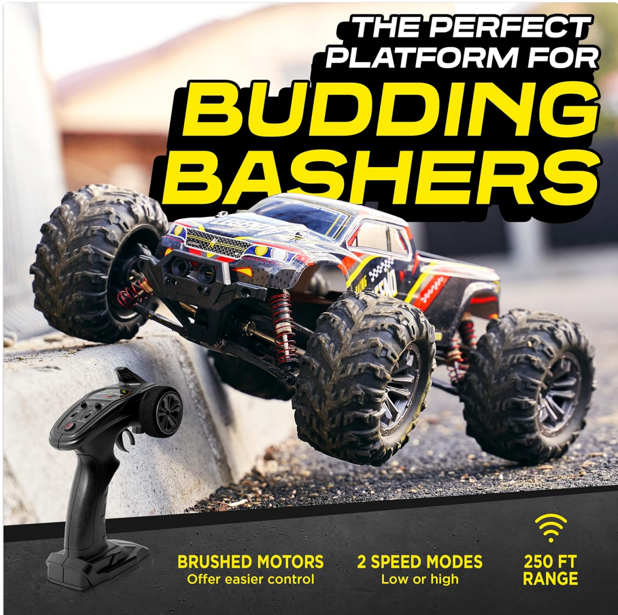
Image: The LAEGENDARY RC Truck positioned next to its 2.4 GHz radio system remote control, illustrating the primary control interface for the vehicle.