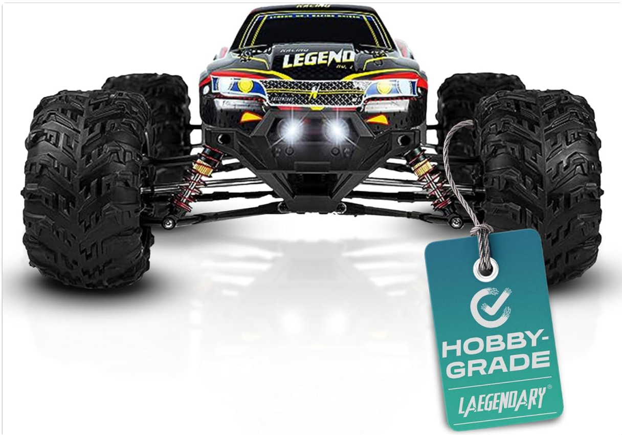
Image: A dynamic front view of the LAEGENDARY 1:10 Scale RC Truck, highlighting its robust design and illuminated headlights, indicating readiness for operation.