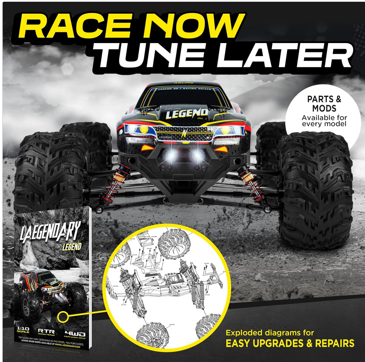
Image: An exploded diagram of the LAEGENDARY RC Truck chassis, illustrating various components and their assembly, useful for maintenance, repairs, and upgrades.