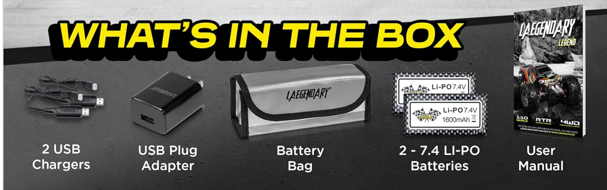
Image: All components included in the LAEGENDARY RC Truck package, laid out for inspection. This includes the RC truck, remote control, two Li-Po batteries, two USB chargers, a USB plug adapter, a battery bag, and the user manual.