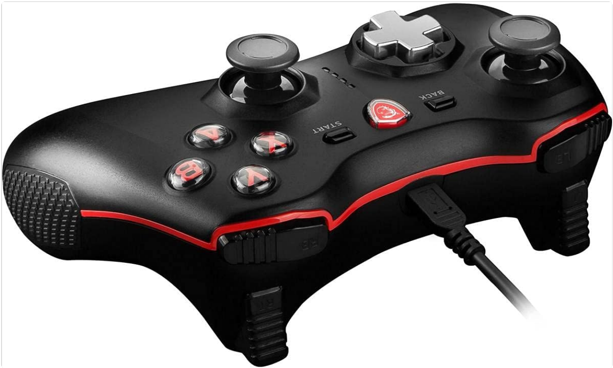
Figure 3: Side view of the MSI Force GC20 Gamepad, detailing the shoulder buttons and triggers.