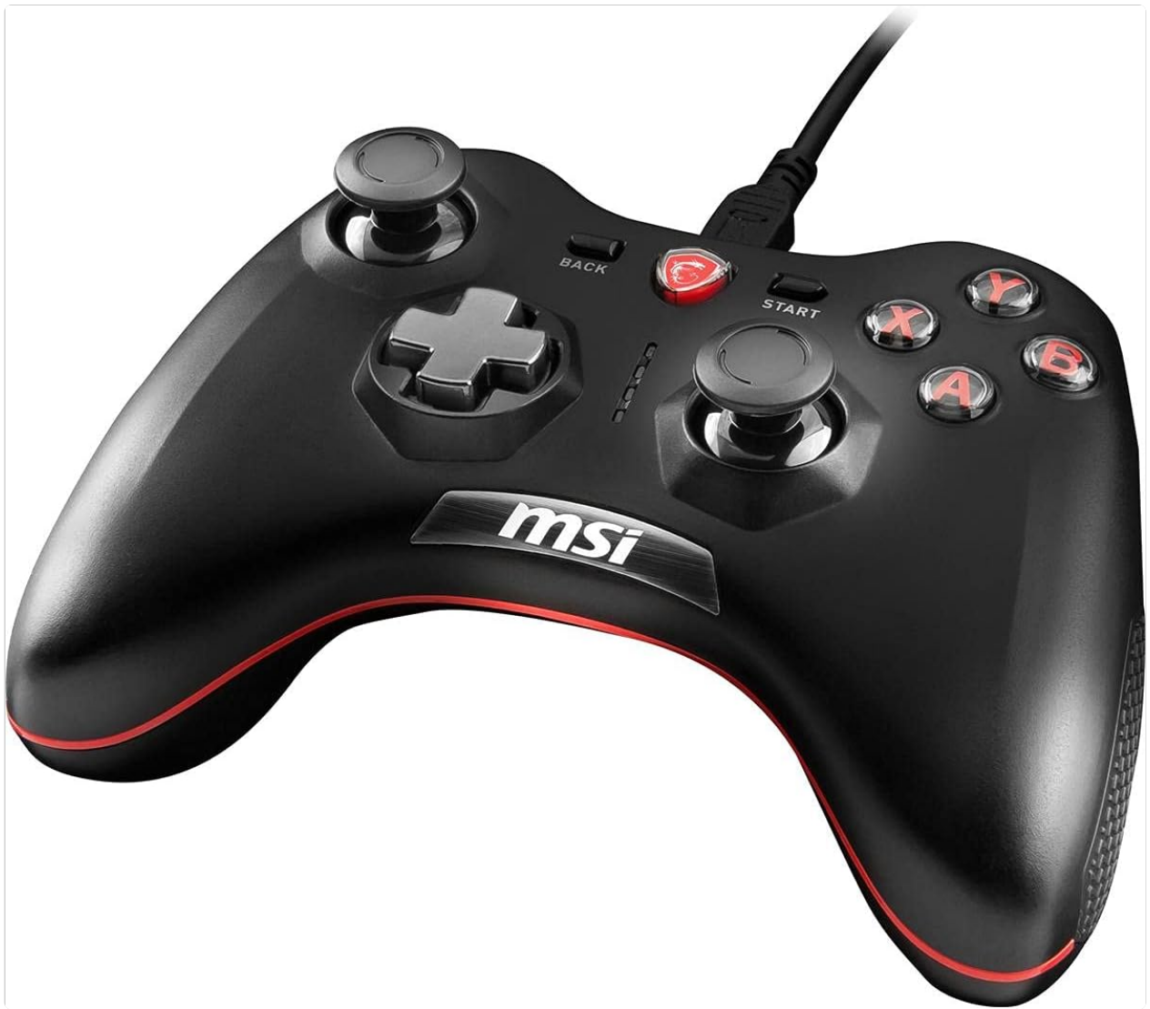
Figure 1: Front view of the MSI Force GC20 Gamepad.