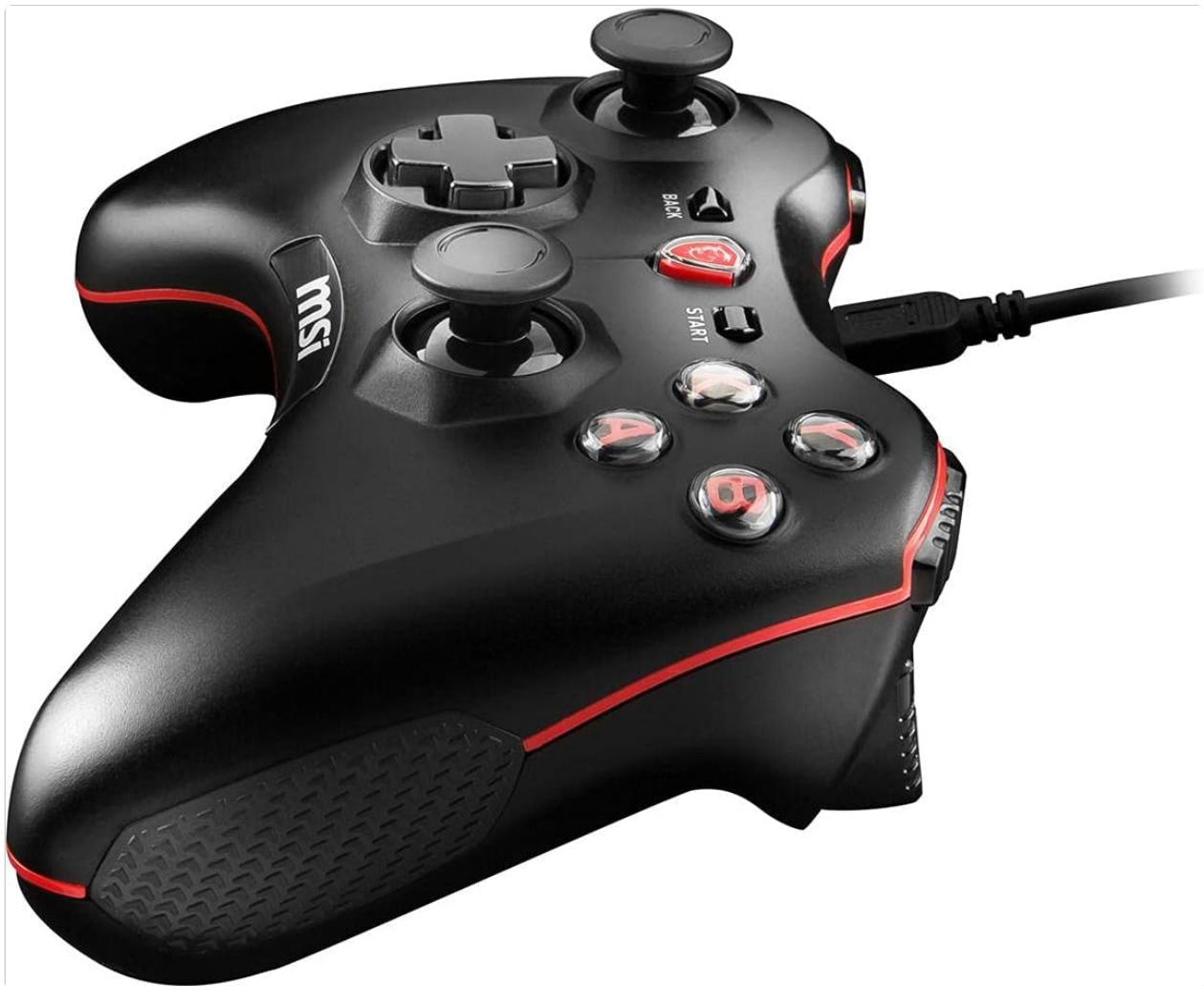
Figure 2: Top-down view of the MSI Force GC20 Gamepad, illustrating button placement.