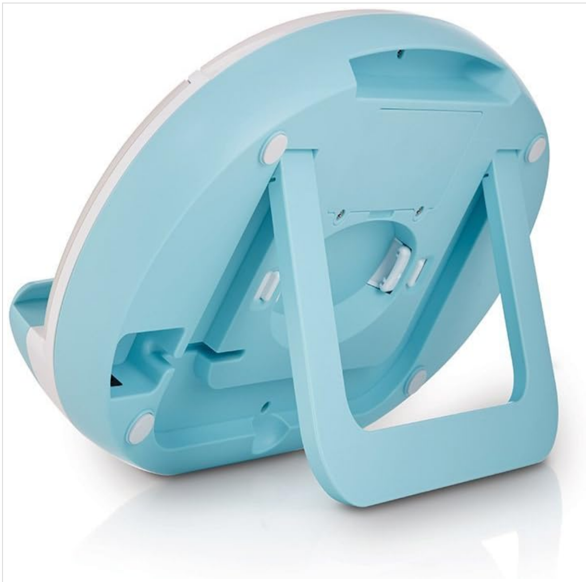
Image: A close-up of the back of the main unit, highlighting the power input and other connection ports.