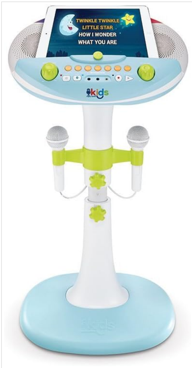
Image: The top unit of the karaoke system being placed onto the assembled pedestal stand.

The system's height is adjustable. Loosen the adjustment knobs on the pole, set to the desired height, and tighten the knobs to secure. The main unit can also be detached from the pedestal for tabletop use.