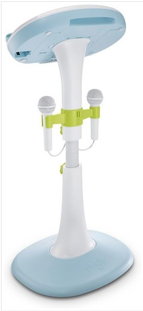
Image: Illustration of the main pole being inserted into the base of the karaoke system.