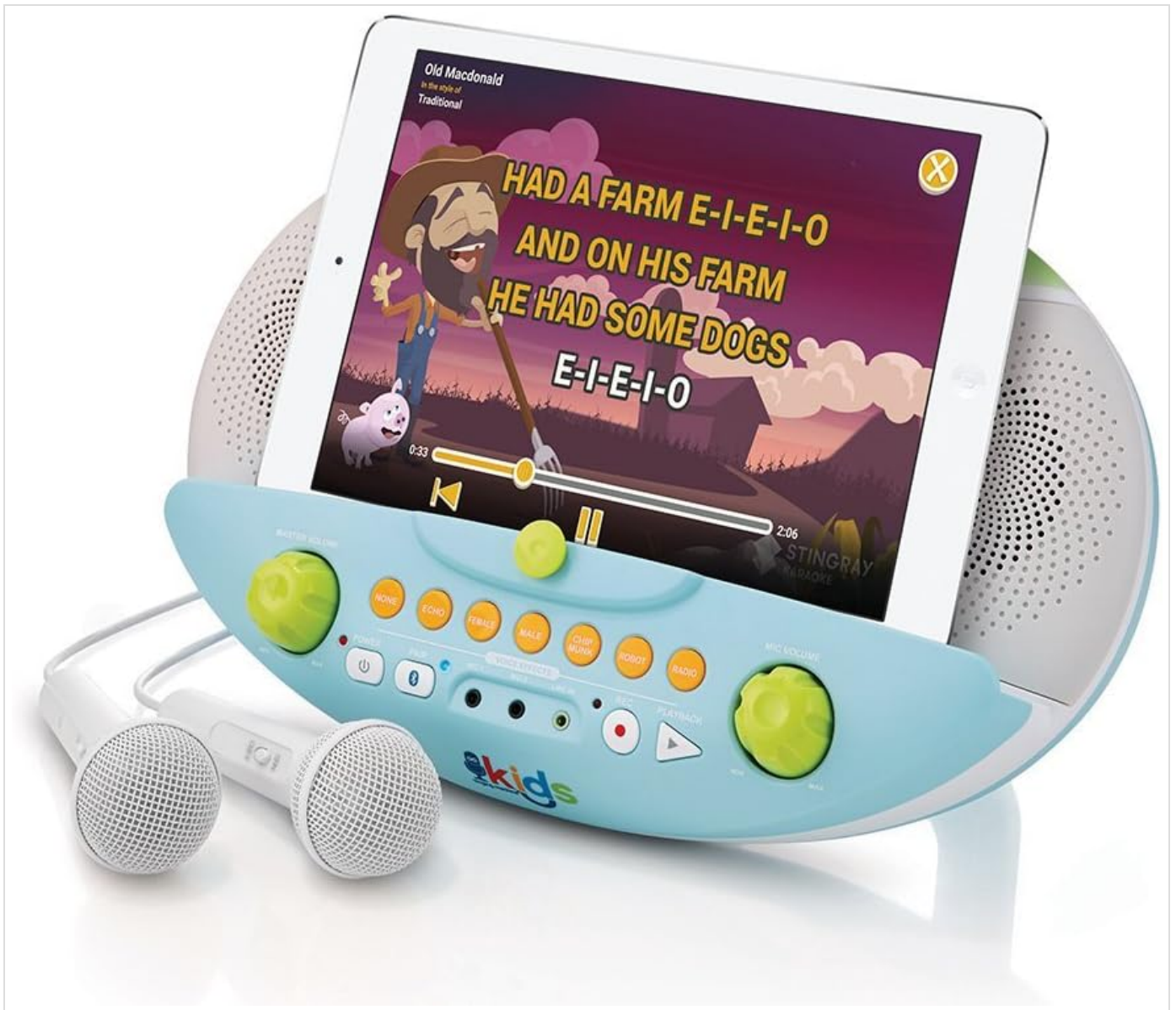
Image: A tablet resting in the device holder of the karaoke system, showing how it can be used to display content.