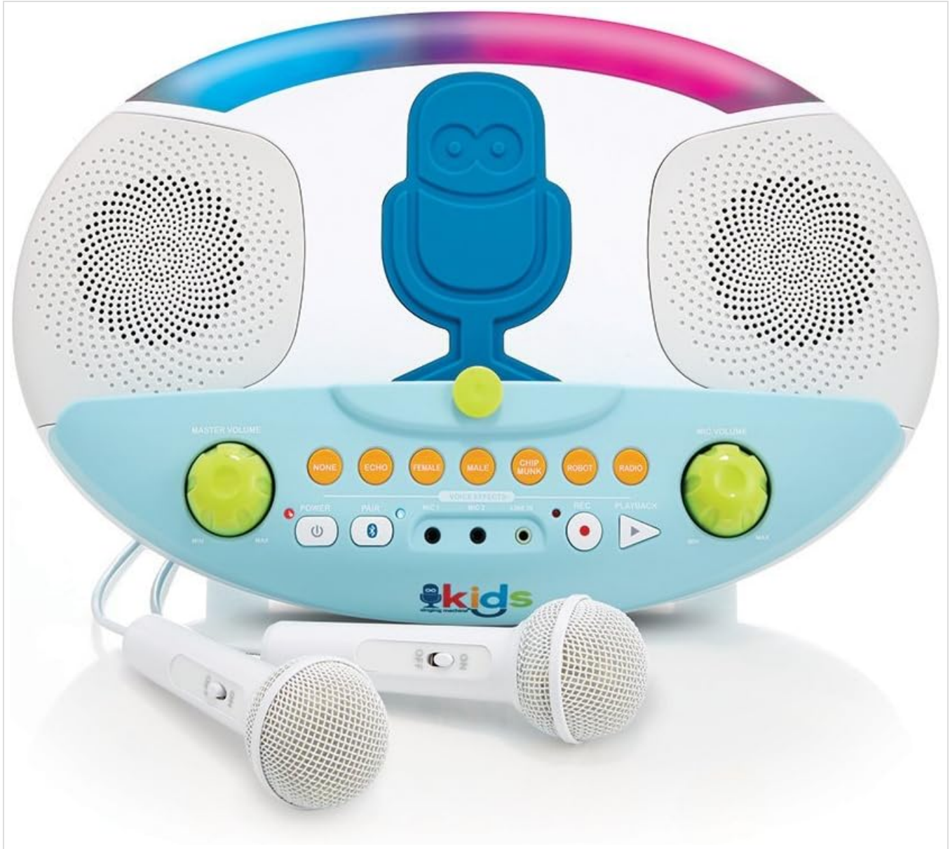
Image: A detailed view of the control panel, highlighting the various voice effect buttons and volume knobs.

Experiment with the six built-in voice-changing effects: NONE , ECHO , FEMALE , MALE , CHIPMUNK , ROBOT , and RADIO . Press the corresponding button to activate an effect.