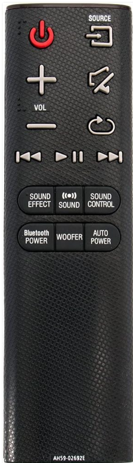
Figure 2.1: Front view of the ECONTROLLY AH59-02692E remote control.