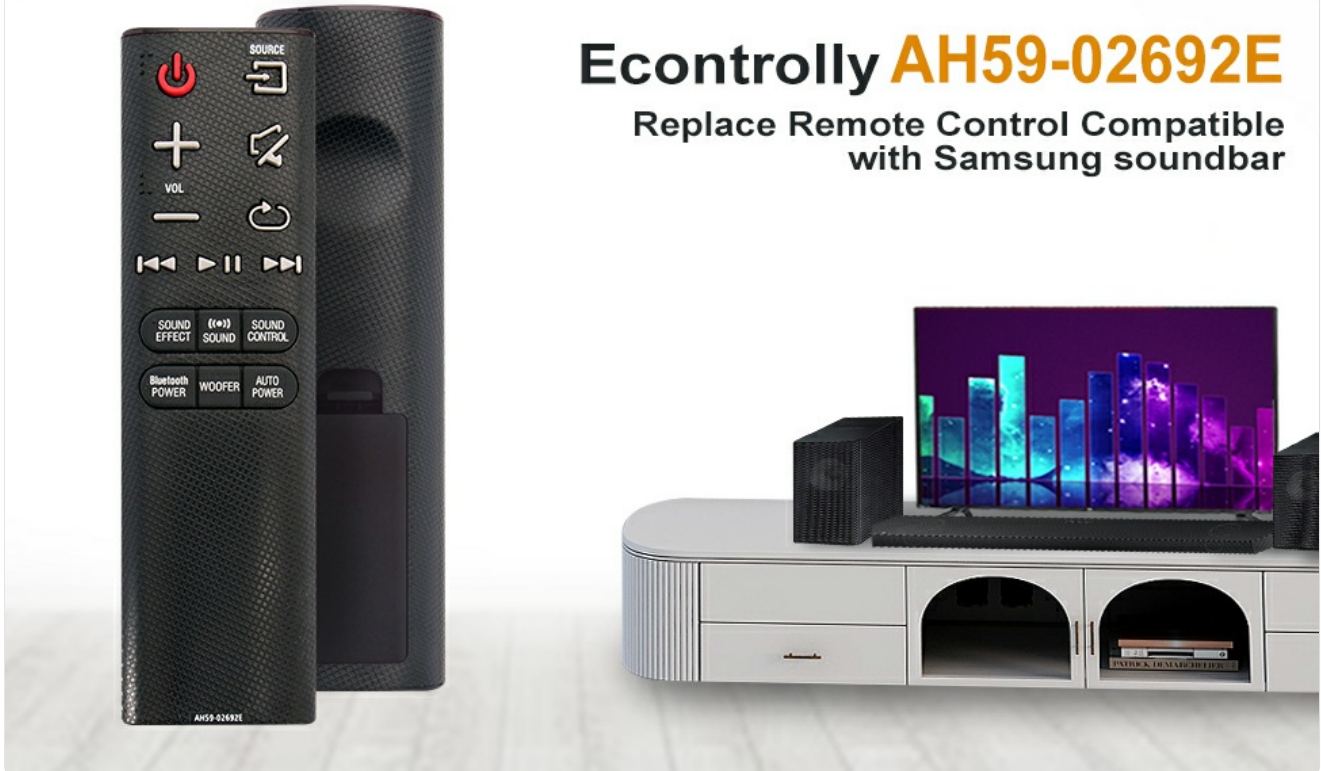
Figure 2.4: ECONTROLLY AH59-02692E Replacement Remote Control for Samsung Soundbar.

Replace Remote Control Compatible with Samsung soundbar