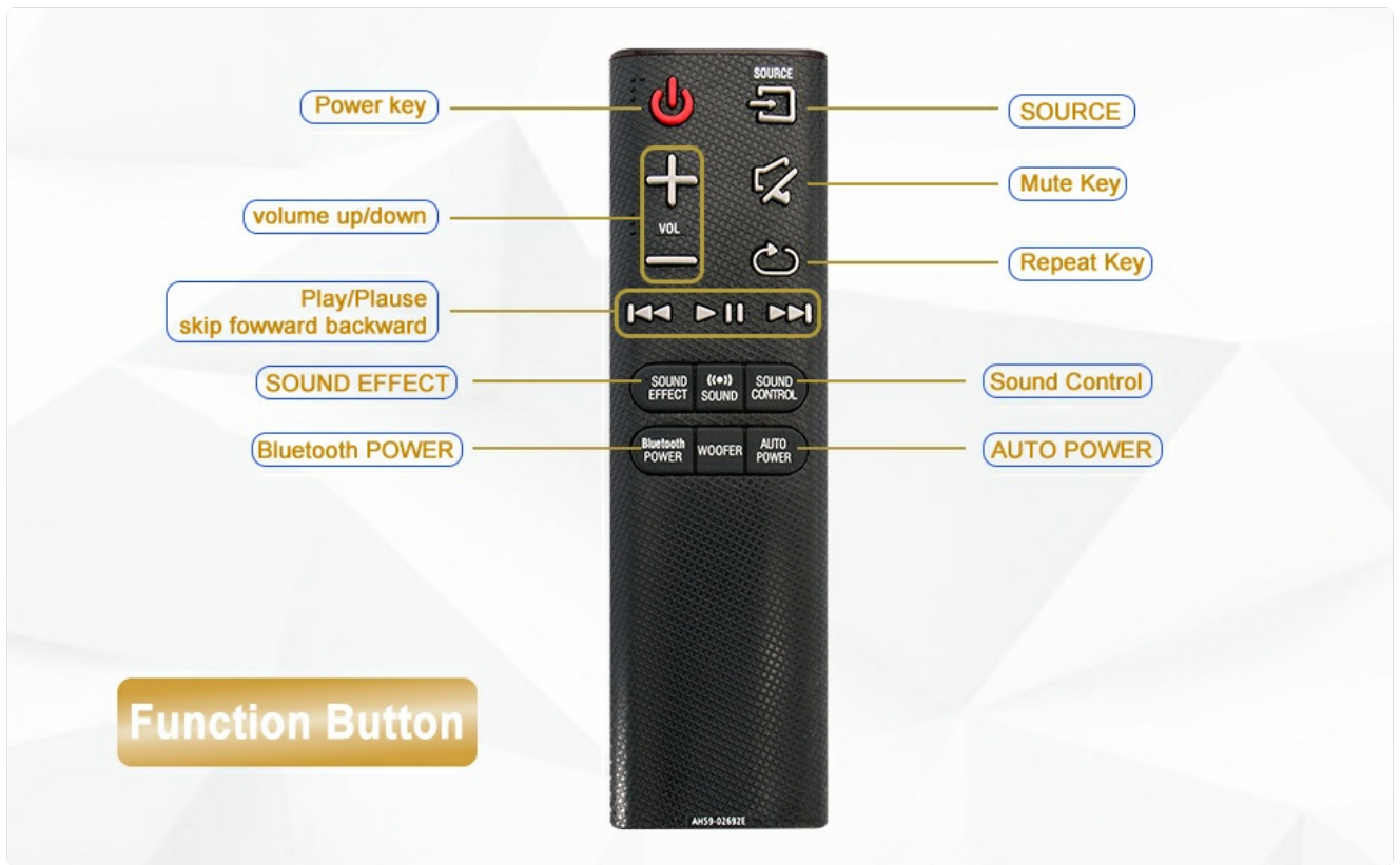
Figure 4.1: Function Button Layout.