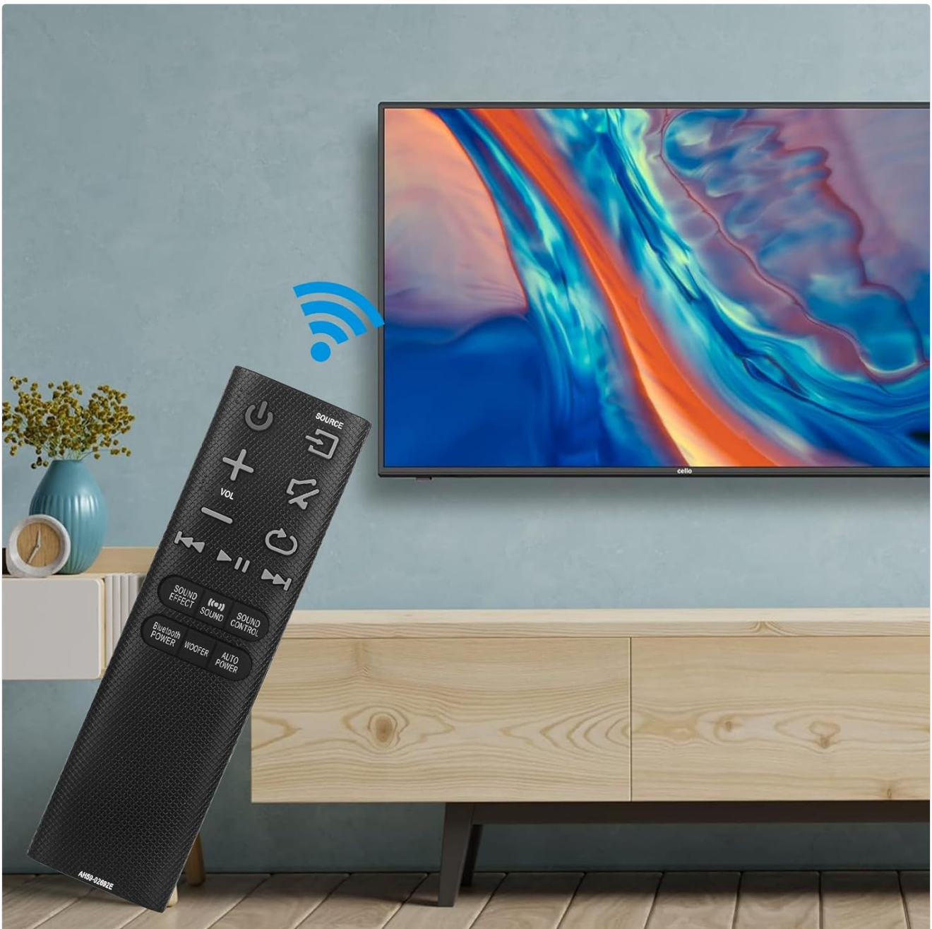
Figure 4.2: Remote control in use with a soundbar and television.