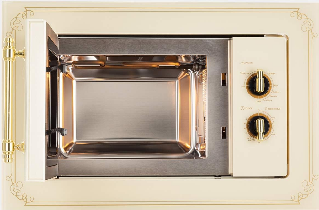
Figure 2.2: Interior view highlighting the spacious 20-liter capacity and the glass turntable.

Mit einem Fassungsvermögen von 20 Litern