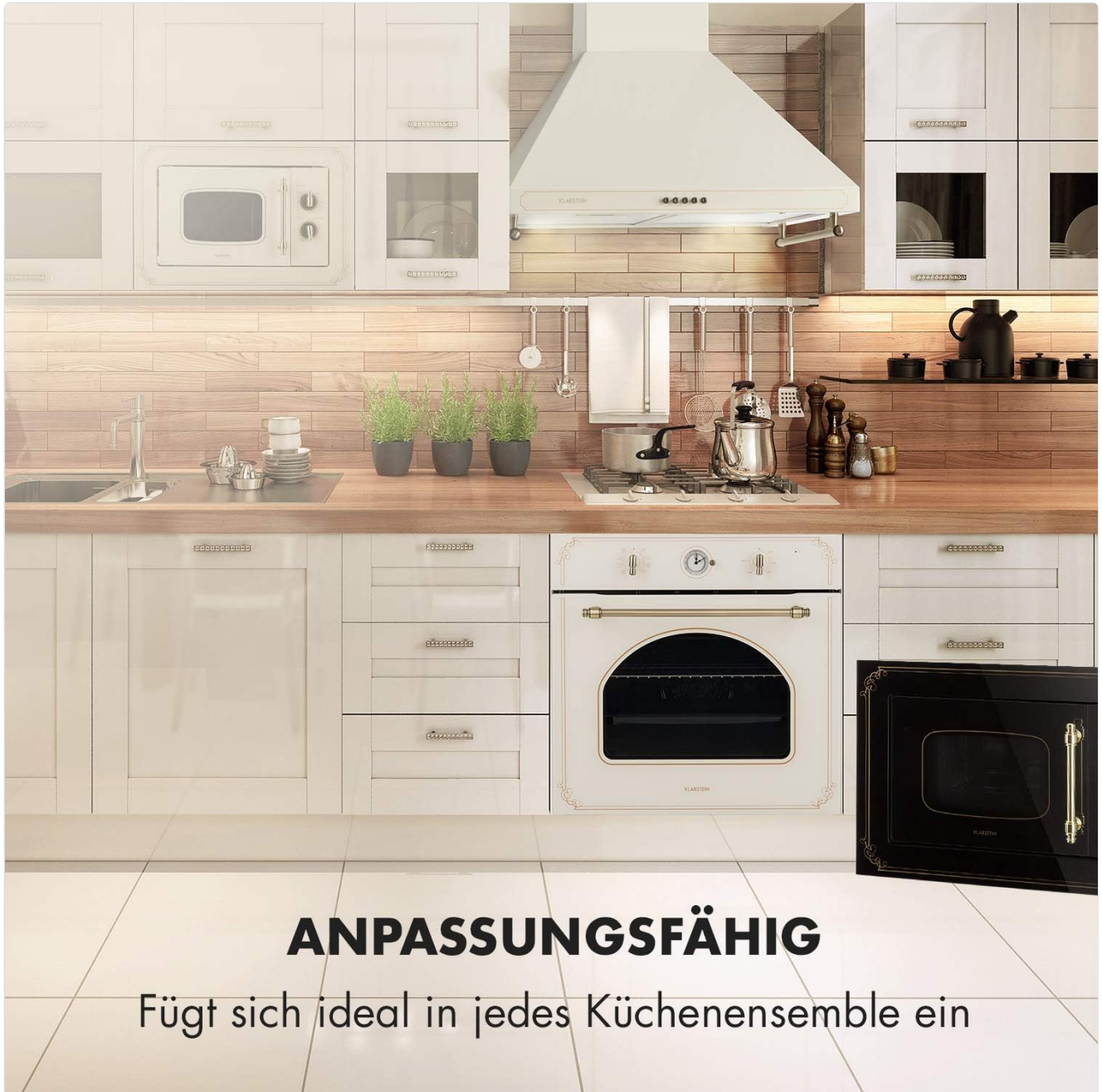
Figure 3.1: Example of the microwave integrated into a kitchen environment, demonstrating its adaptable design.