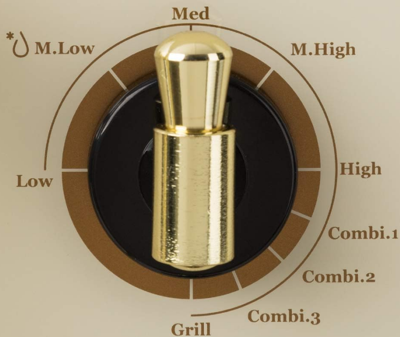
Figure 4.1: Control knob for selecting power levels and cooking functions.