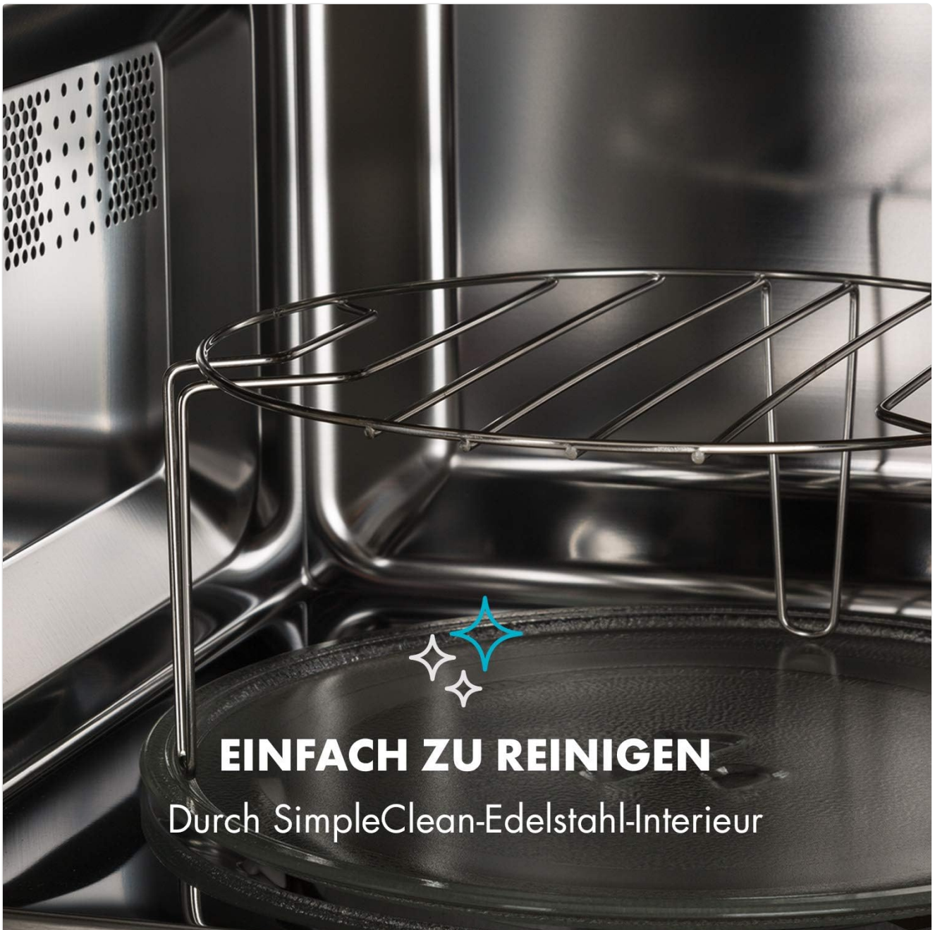
Figure 5.1: The SimpleClean stainless steel interior facilitates easy cleaning.