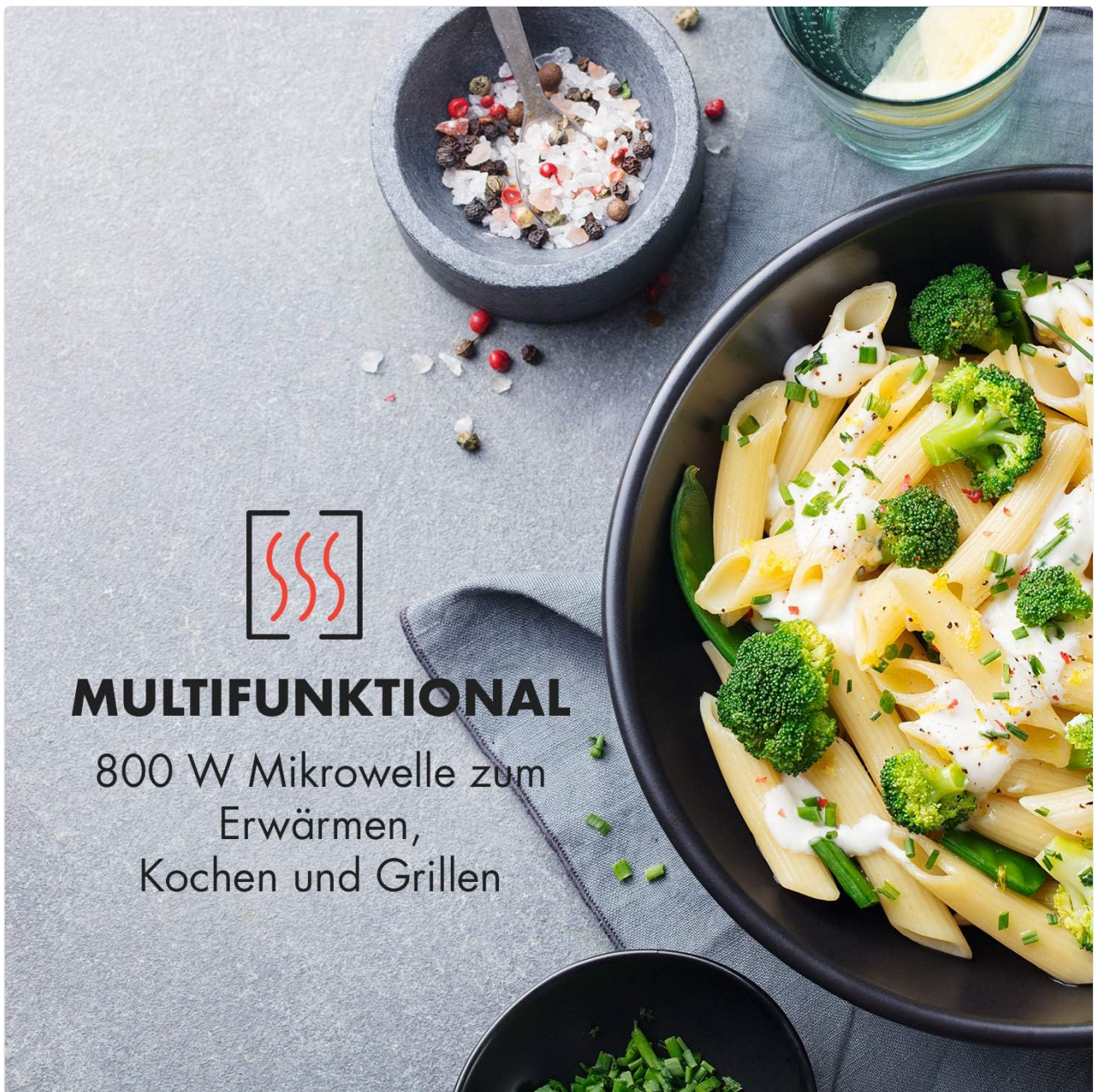
Figure 4.2: The microwave function is suitable for warming, cooking, and grilling a variety of foods.