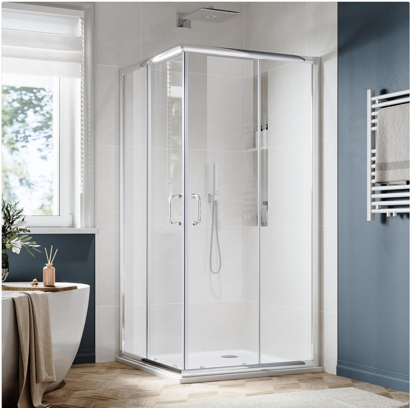
Image: A complete view of the SUNNY SHOWER Corner Shower Enclosure installed in a modern bathroom setting, showcasing its clear glass panels and chrome frame.