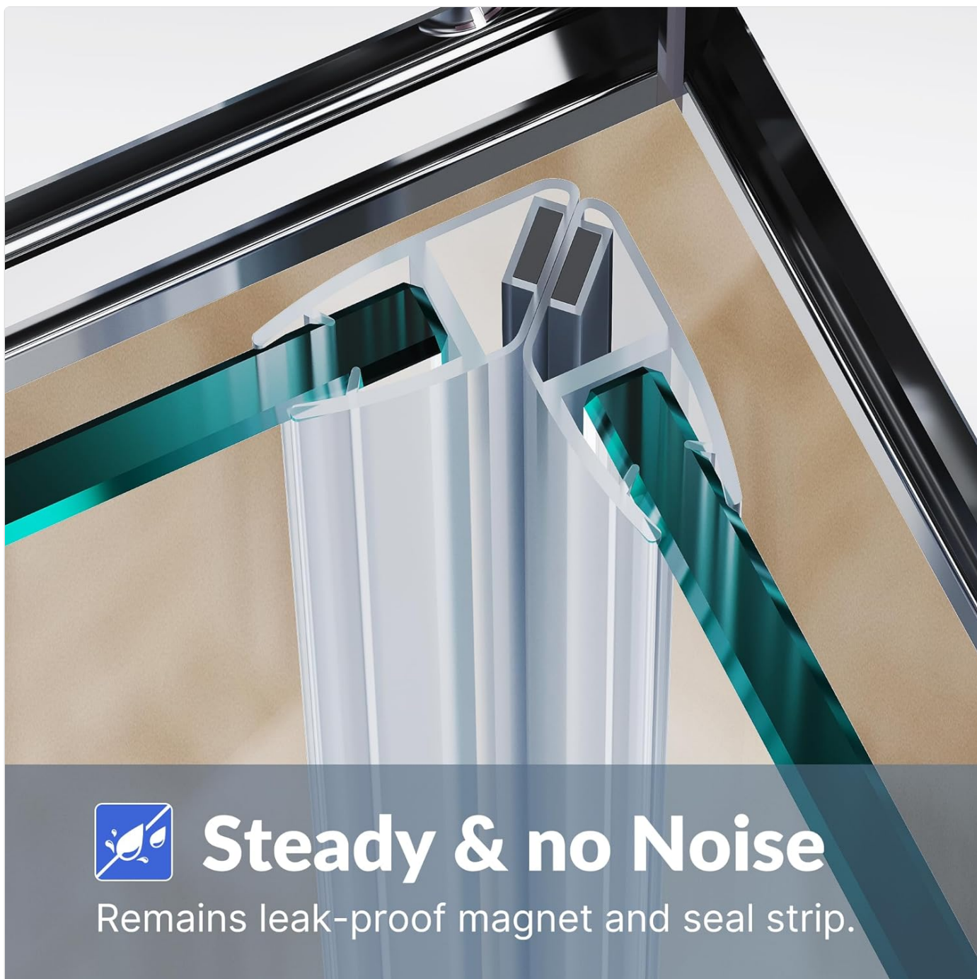
Image: A close-up of the magnetic seal strip, demonstrating how it ensures a steady and leak-proof closure for the shower enclosure, preventing water from escaping.