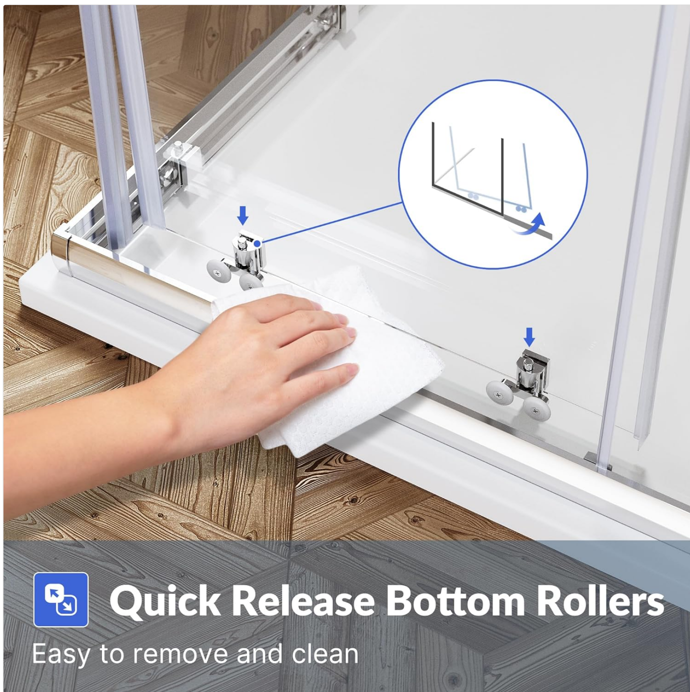
Image: A visual guide demonstrating the quick release bottom rollers, which allow for easy removal and cleaning of the shower door panels.