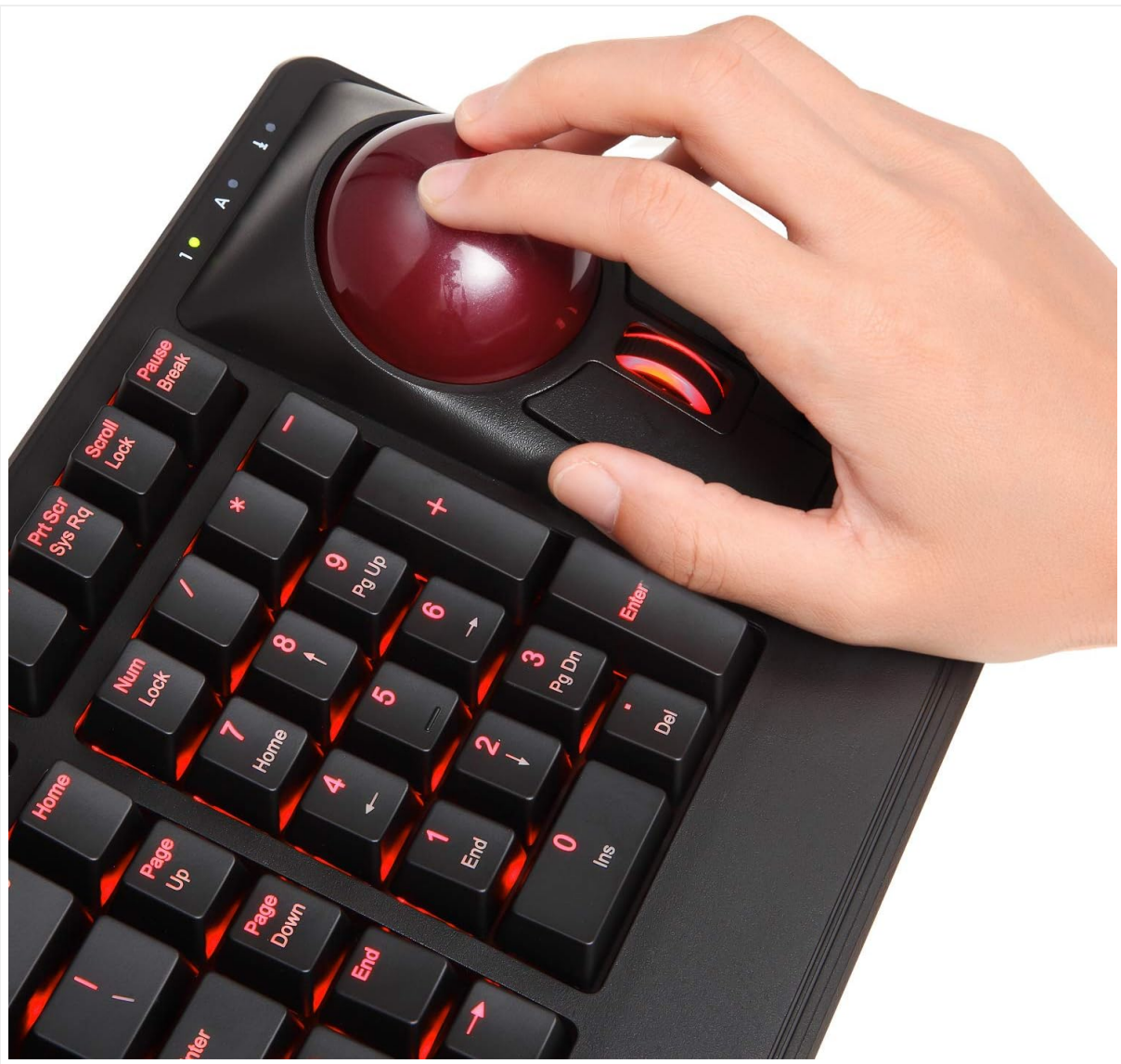
Image: A user's hand is shown operating the large red trackball and adjacent mouse buttons on the Perixx Periboard-322 keyboard, demonstrating ergonomic use.