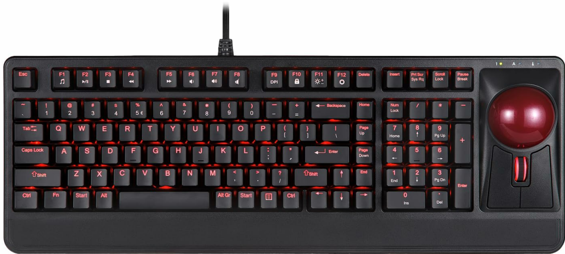
Image: The Perixx Periboard-322 wired mechanical trackball keyboard, showcasing its full layout with the integrated trackball and numeric keypad.