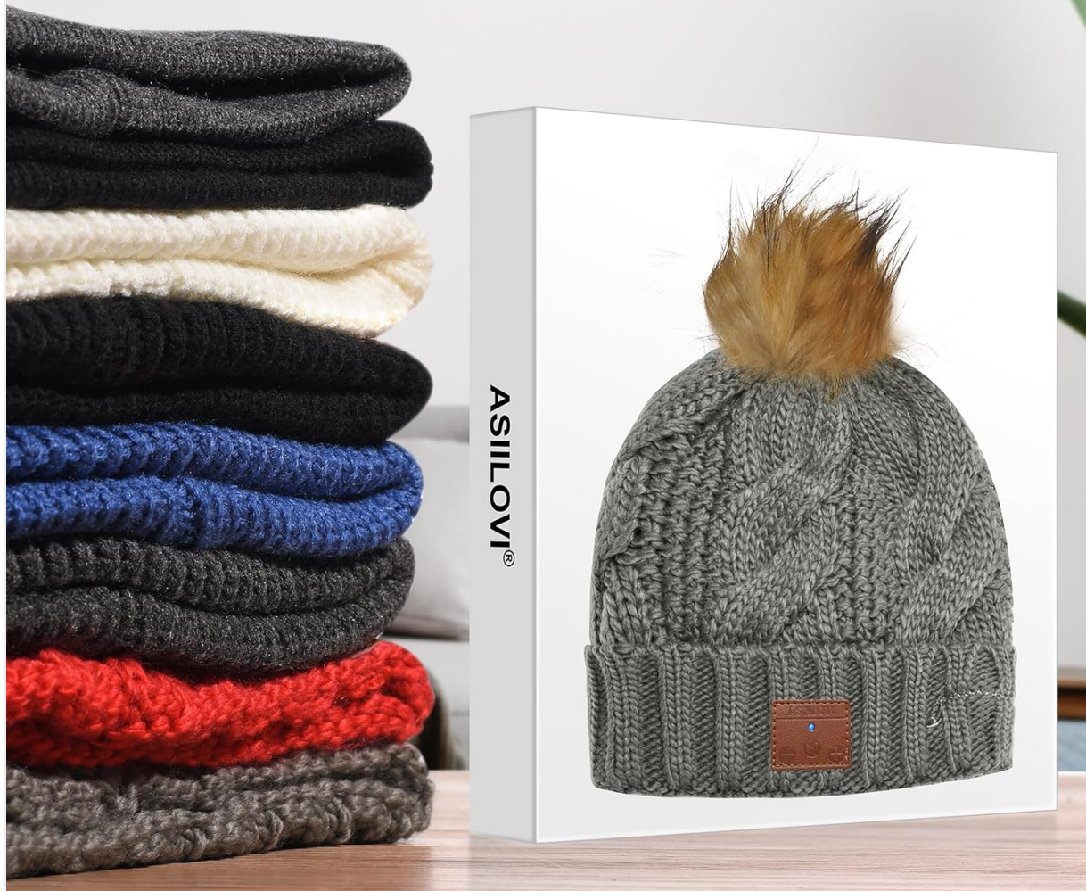
Image: A stack of colorful beanies and a white gift box with an ASIILOVI Bluetooth Beanie inside. This image shows the product packaging and available colors.