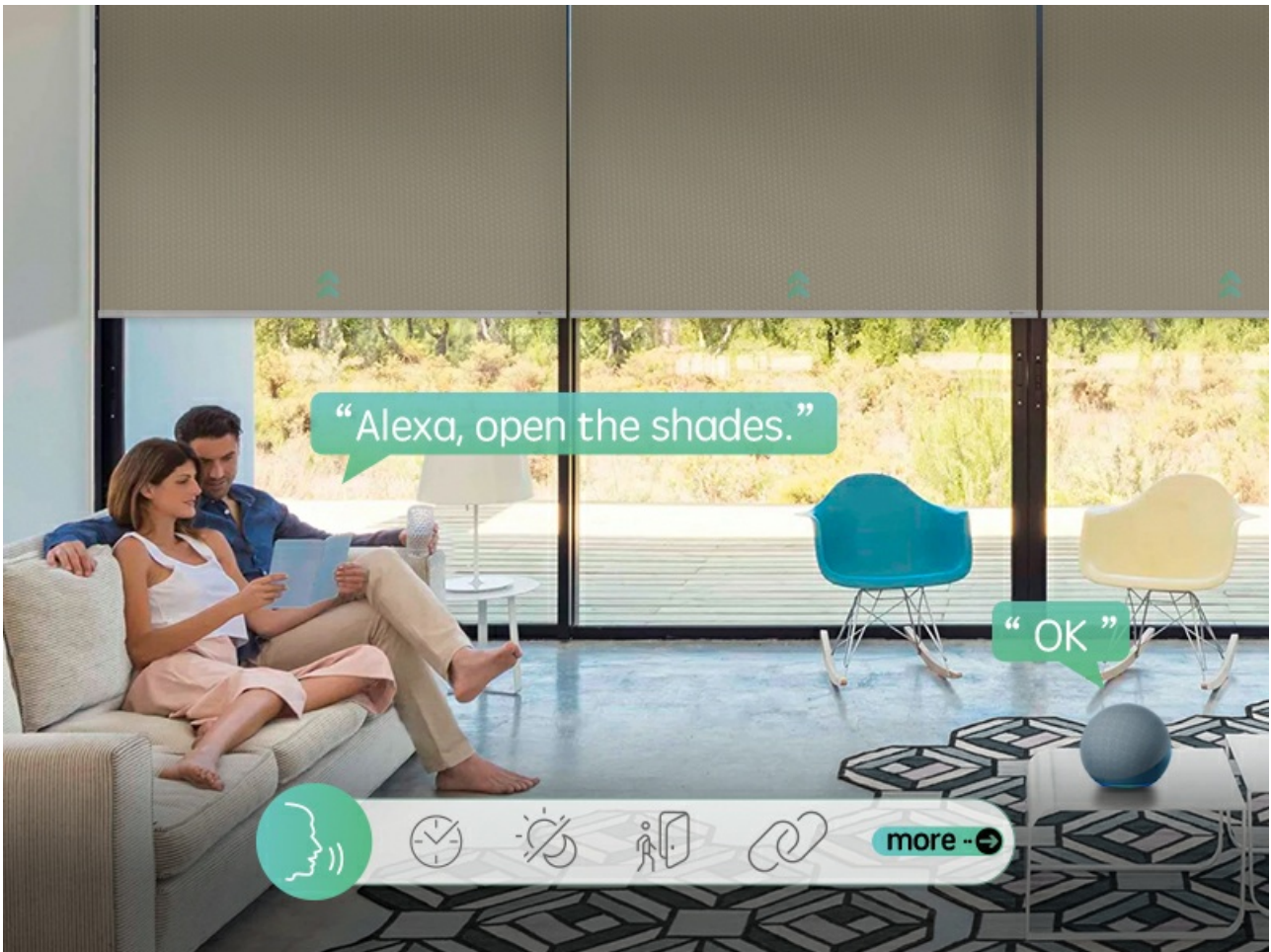
Image: A user interacting with an Alexa device to control Yoolax blinds via voice command, demonstrating hands-free operation.