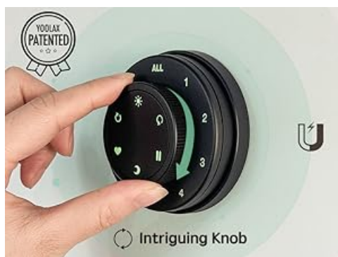
Image: The Yoolax Lightwirl Remote, featuring a gentle touch interface and an intriguing knob for precise opening adjustments.

Your Yoolax blinds can be controlled using the included remote control. The Lightwirl Remote offers intuitive control for up to 9 blinds, while the 16-Channel Remote can manage up to 16 blinds.