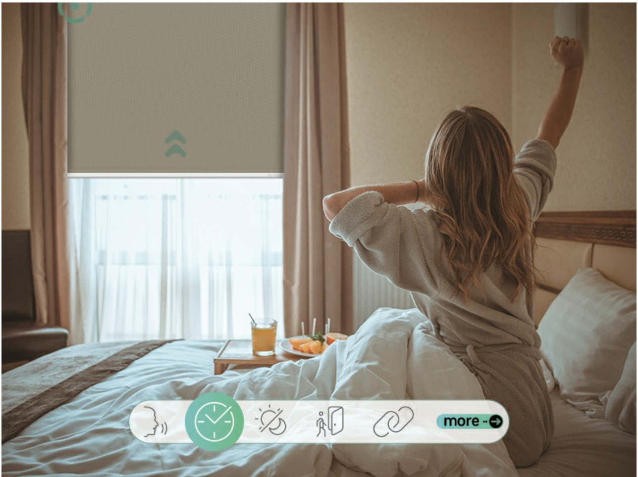
Image: The Yoolax Home App interface, demonstrating timing control, location control, sunrise/sunset control, and offsite control features.