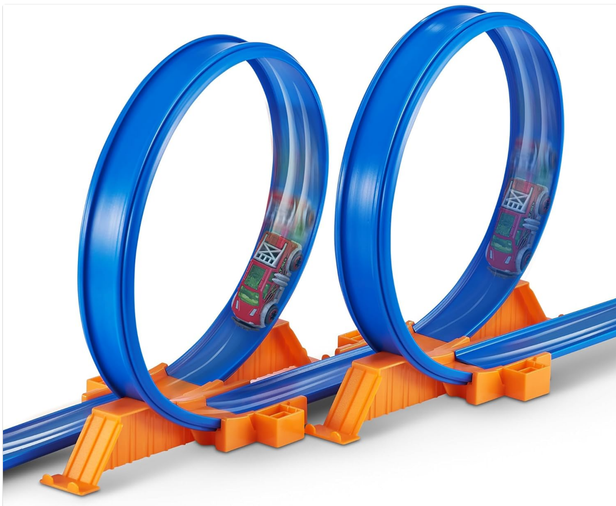
Image 5.1: Metal Machine vehicles demonstrating successful navigation through the double looping track.