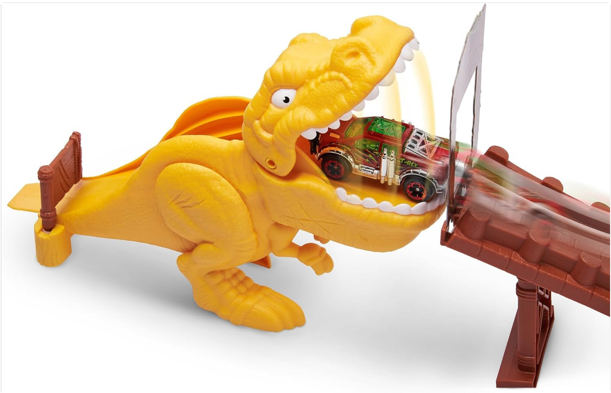
Image 5.2: The Metal Machine vehicle successfully hitting the T-Rex figure, demonstrating the playset's action feature.