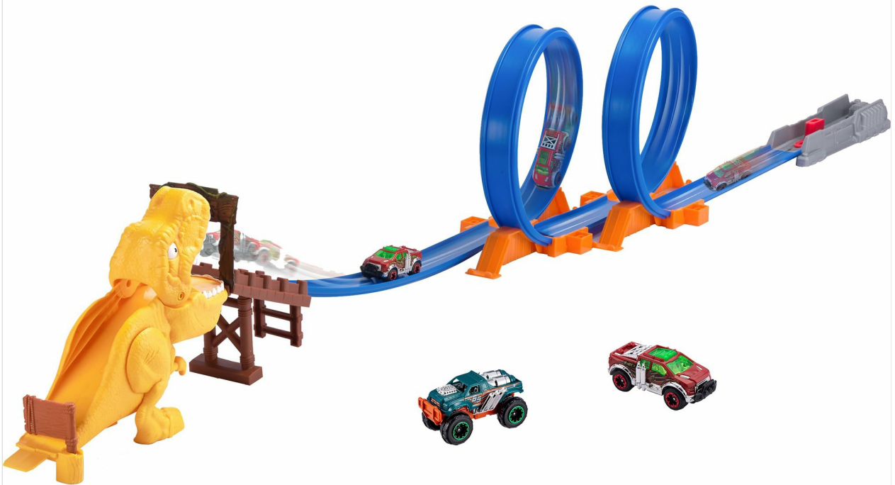
Image 4.2: The complete ZURU Metal Machines T-Rex Attack playset fully assembled, showcasing the double loops and the T-Rex target.