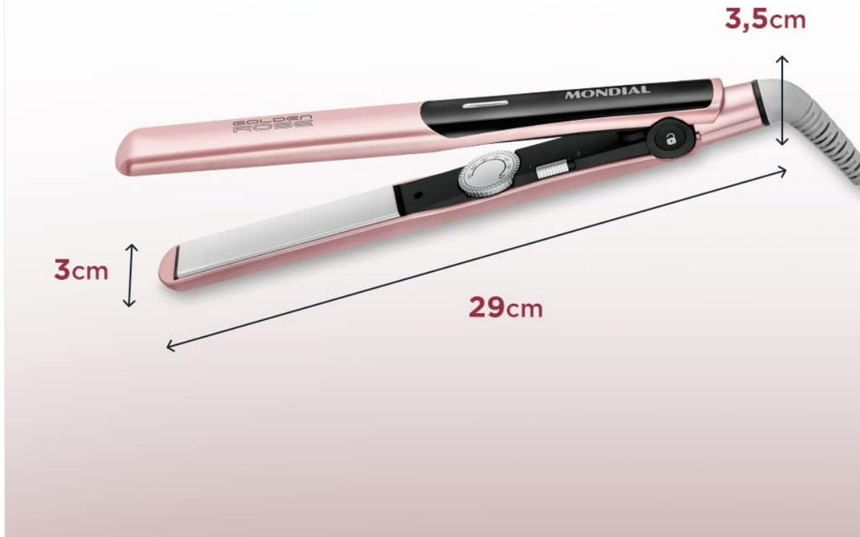
Image: Dimensions of the MONDIAL P-20 Hair Straightener, showing length, width, and plate size.