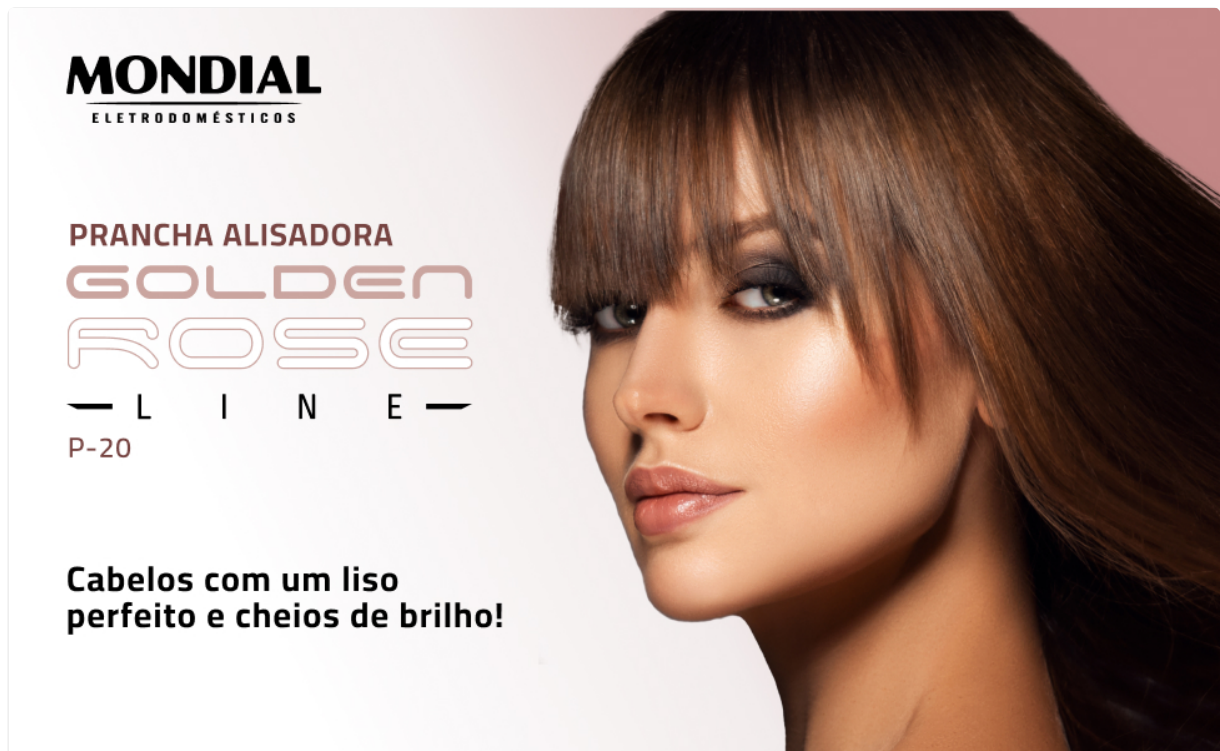
Image: The MONDIAL P-20 Golden Rose Hair Straightener, designed for perfectly straight and shiny hair.

Thank you for choosing the MONDIAL P-20 Golden Rose Hair Straightener. This manual provides essential information for the safe and effective use, maintenance, and troubleshooting of your new appliance. Please read it thoroughly before first use and keep it for future reference.