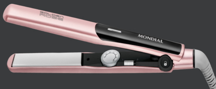
Image: Close-up of the temperature control dial (100°C to 220°C) and the safety lock mechanism.

Com as chapas fechadas, você evita acidentes e consegue guardar o item com muito mais facilidade.