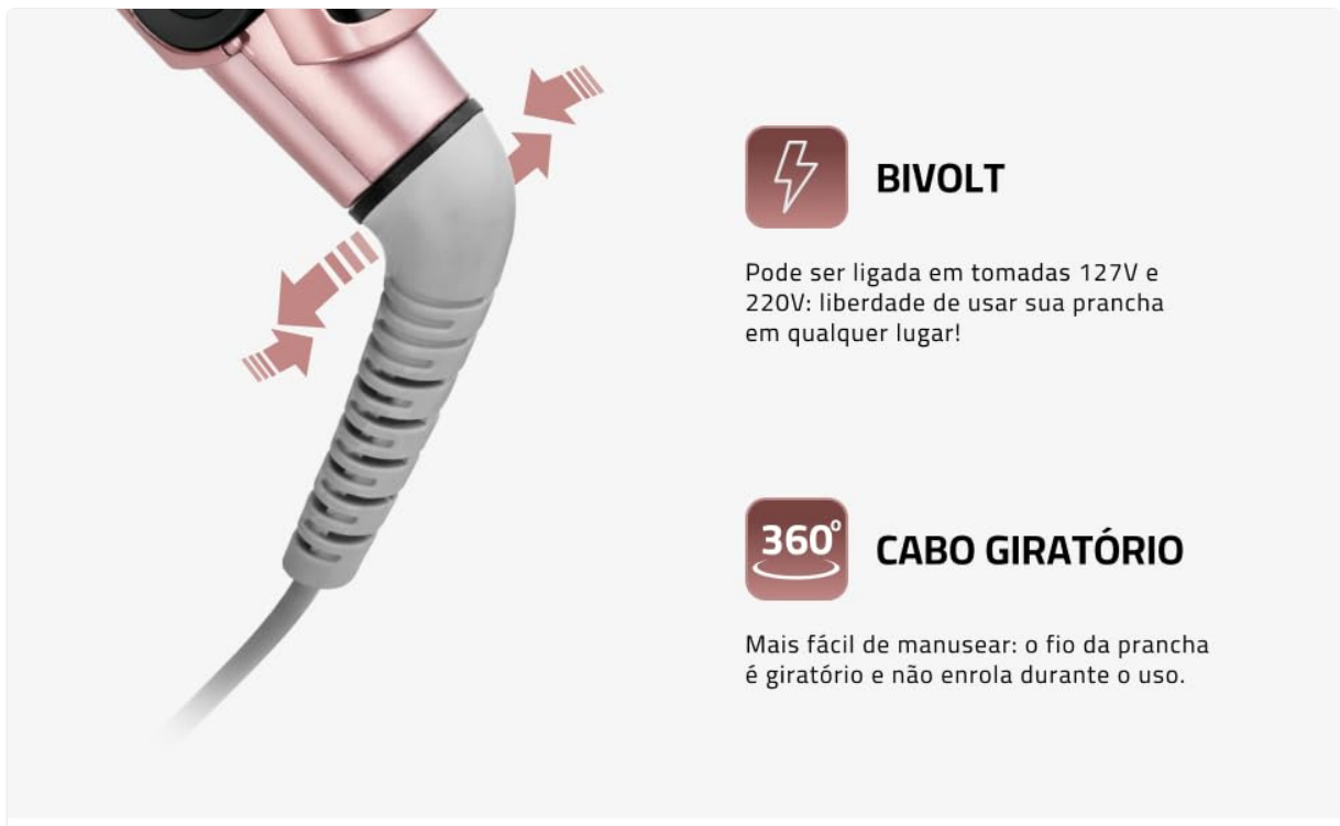
Image: Illustration of the Bivolt capability and the flexible 360° swivel cord.