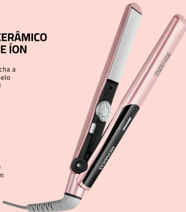
Image: Detail of the ceramic coating with Tourmaline Ion technology and floating plates for smooth, frizz-free results.

As chapas flutuantes se deslocam e se ajustam a cada mecha, promovendo um alisamento sem marcas.