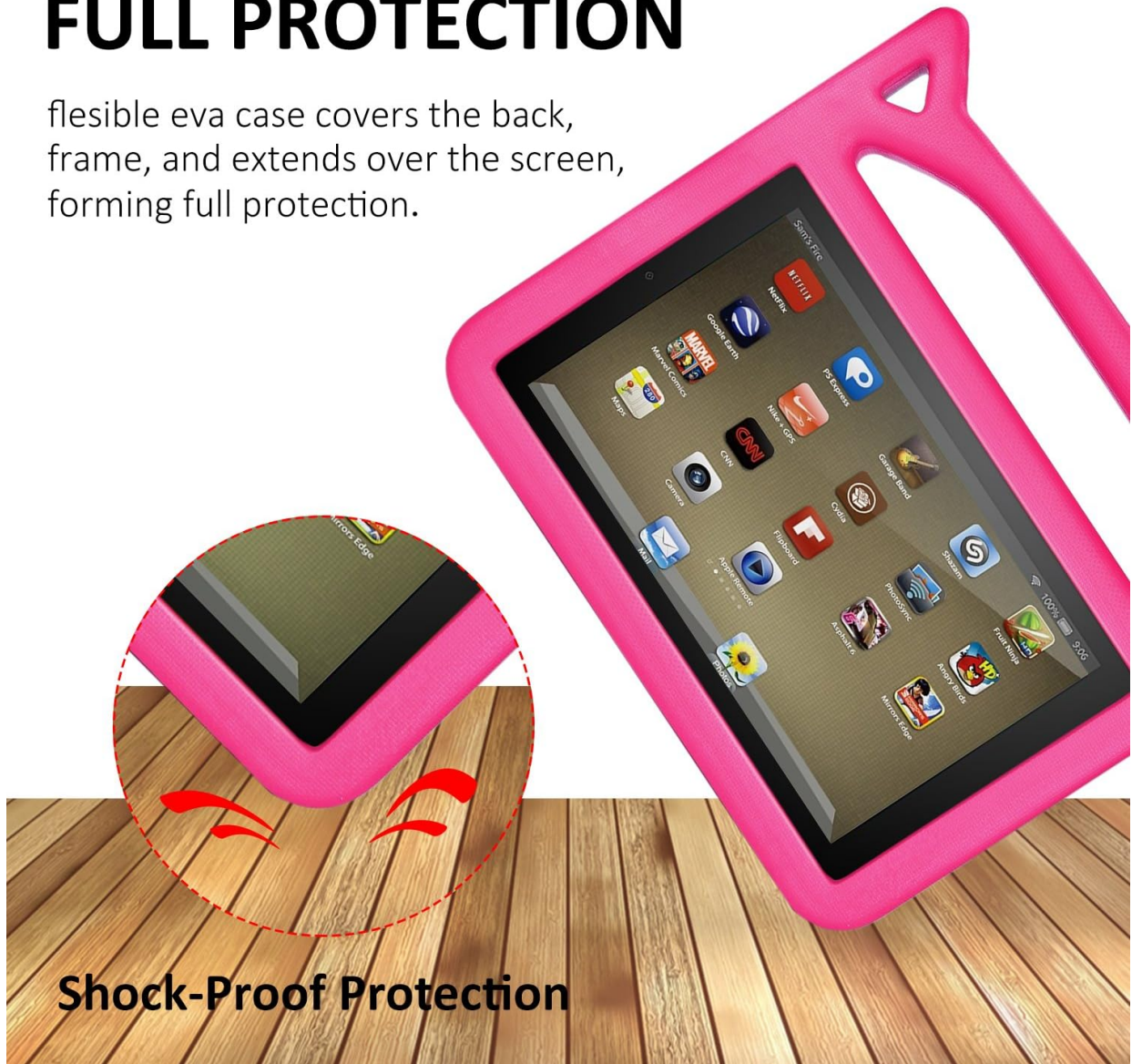
Image Description: This image demonstrates the full protective coverage of the flexible EVA case, highlighting its shock-proof design.

flexible eva case covers the back, frame, and extends over the screen, forming full protection.