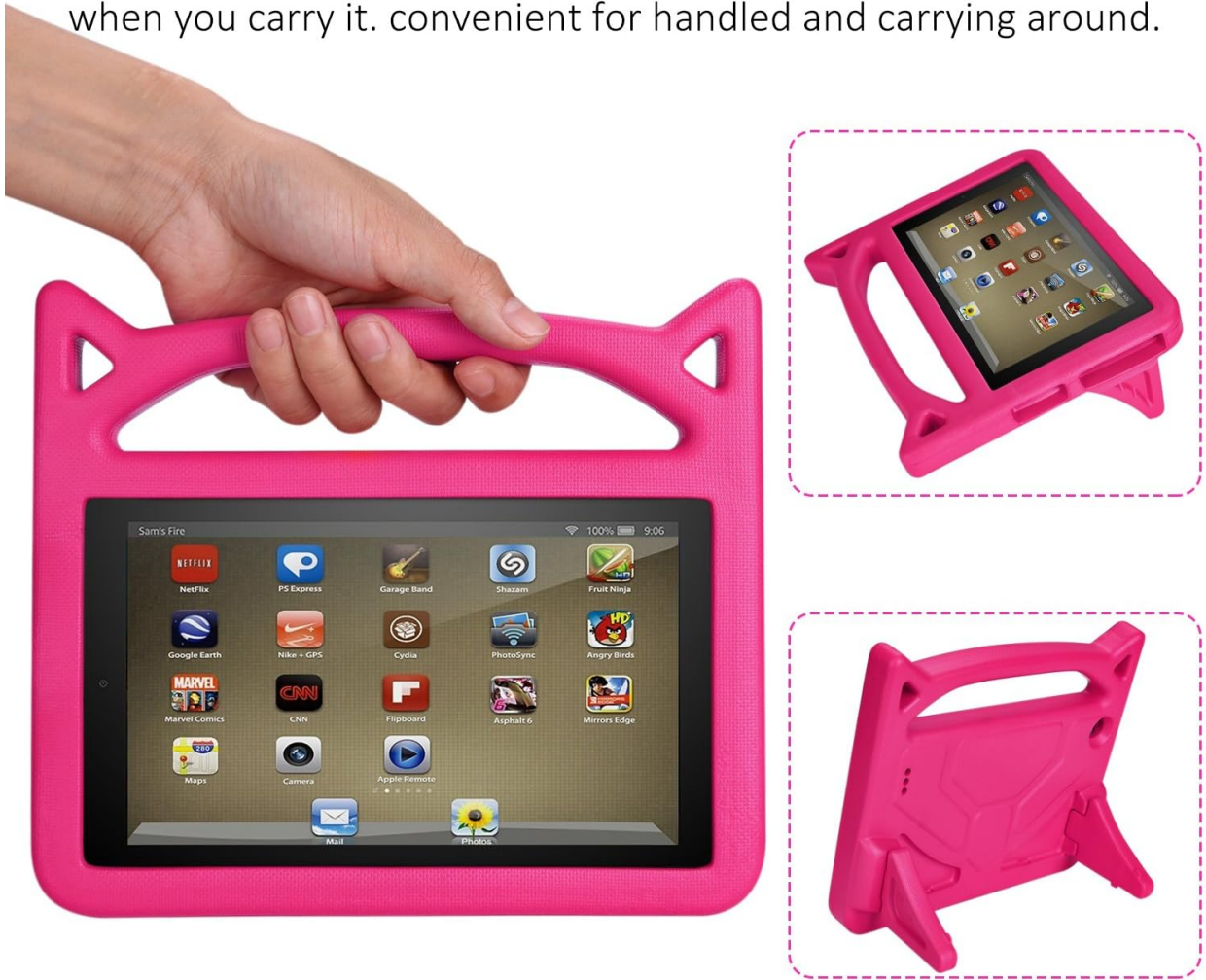
Image Description: This image showcases the customer-friendly design, featuring the integrated handle for easy carrying and the foldable stand for hands-free use.

EVA case is lightweight, foldabled stand,can aslo be folded back when you carry it. convenient for handled and carrying around.