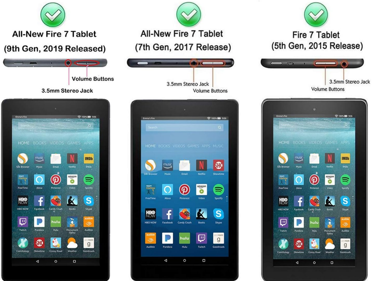
Image Description: This image illustrates the compatibility of the case with different generations of the Amazon Fire 7 Tablet, highlighting the placement of volume buttons and the 3.5mm stereo jack for each model.