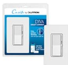
Image: Lutron Caseta Dimmer Switch with a Pico remote, illustrating multiple control options.

The wireless Pico remote provides additional convenience for controlling your lights from anywhere in the home. It can be used handheld or mounted to almost any wall surface to create a multi-location switch without additional wiring.