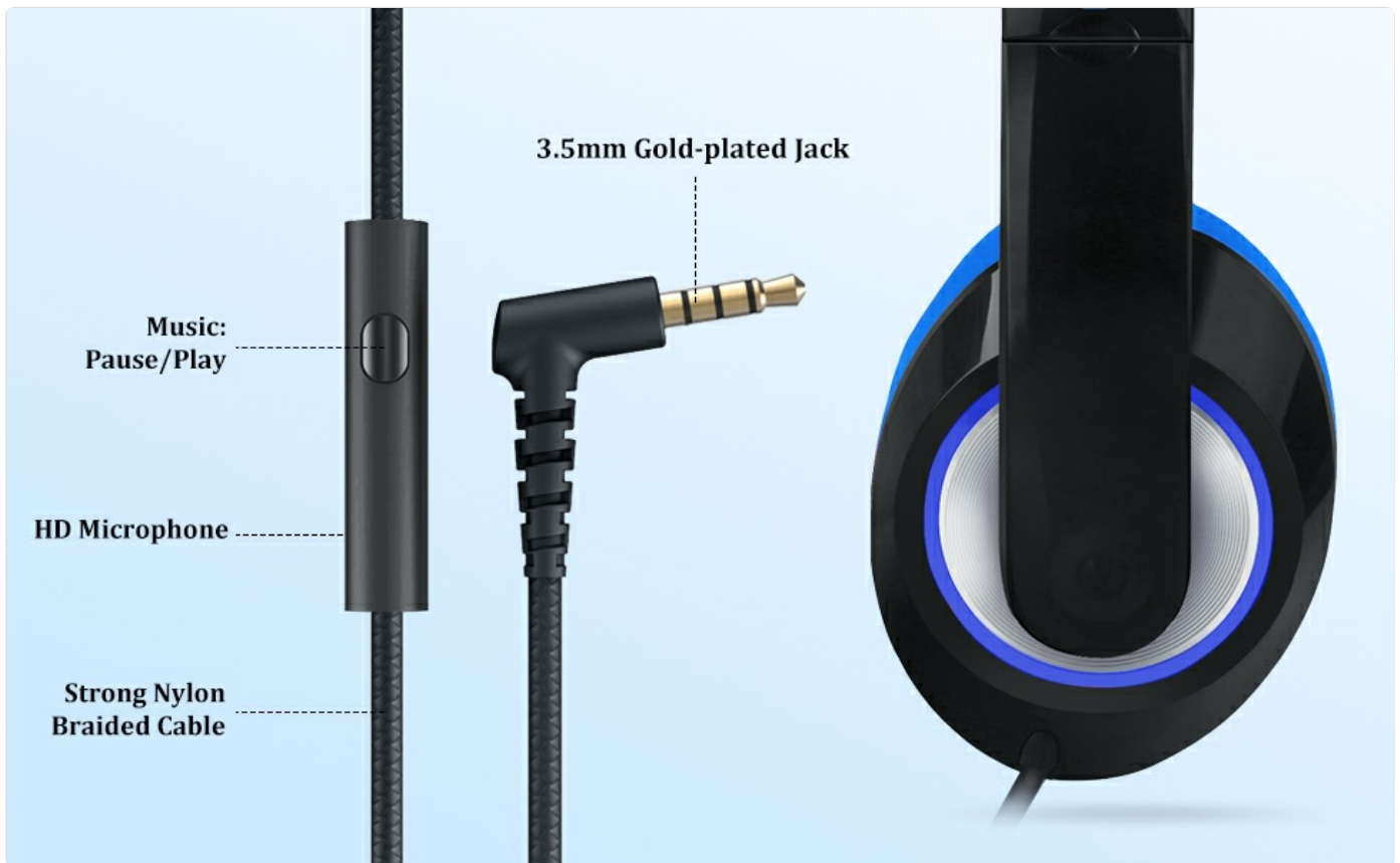
Image: A close-up of the headphone cable showing the in-line control button and HD microphone, with labels for play/pause and microphone function.