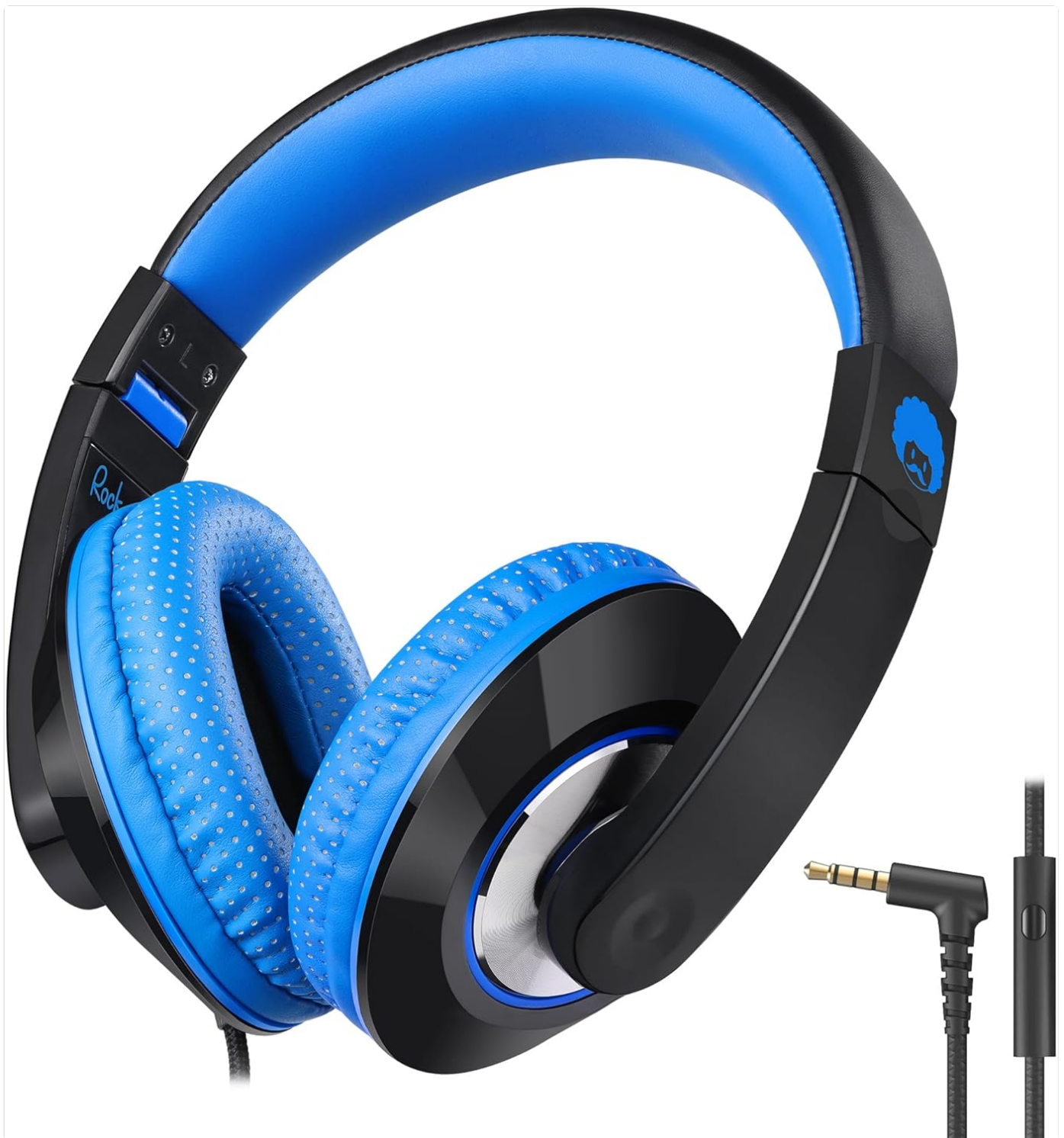
Image: The rockpapa Comfort+ Kids Headphones in blue and black, showcasing the 3.5mm jack and in-line microphone.