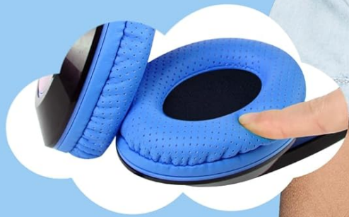
Soft Padded Cushions