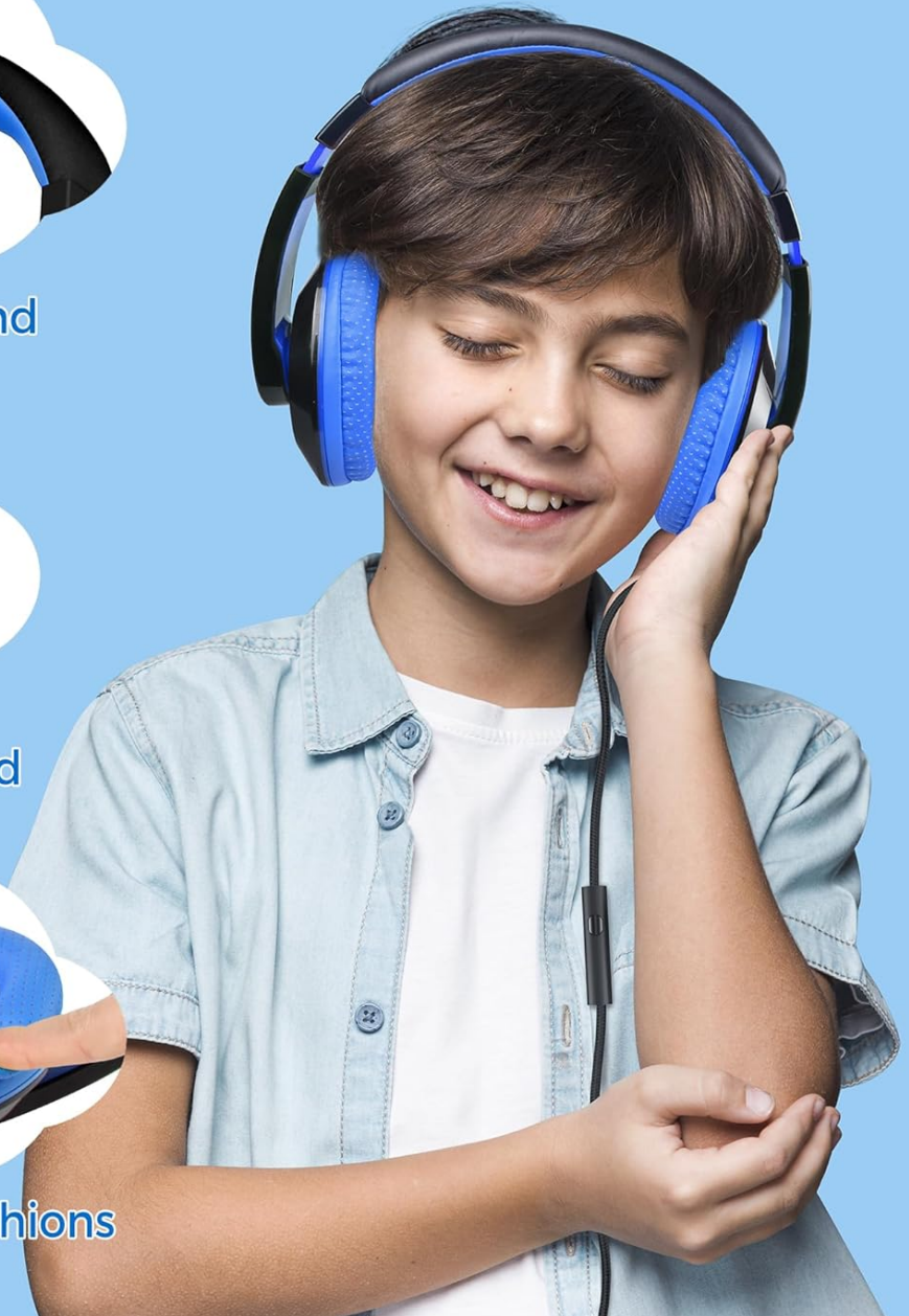
Image: Diagram highlighting the soft headband, twistable headband, and soft padded cushions, indicating comfort and durability features.