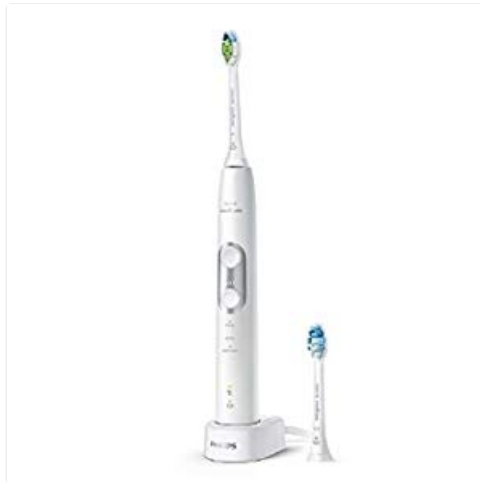
Image 2: Illustration of attaching a brush head to the Philips Sonicare handle.