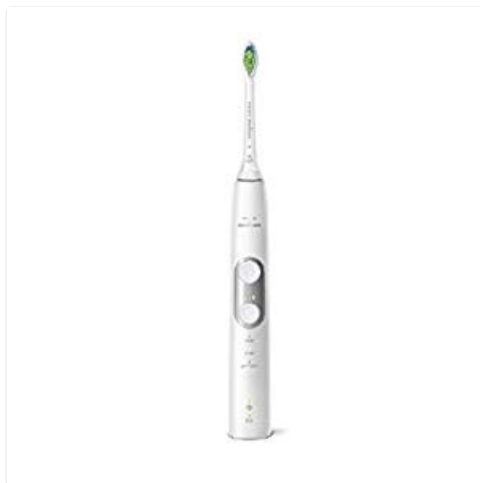
Image 3: Visual representation of the pressure sensor indicator on the toothbrush handle.

Your ProtectiveClean toothbrush is equipped with a pressure sensor. If you apply too much pressure while brushing, the handle will vibrate differently and the light ring at the bottom of the handle will flash purple. Reduce pressure to stop the alert.