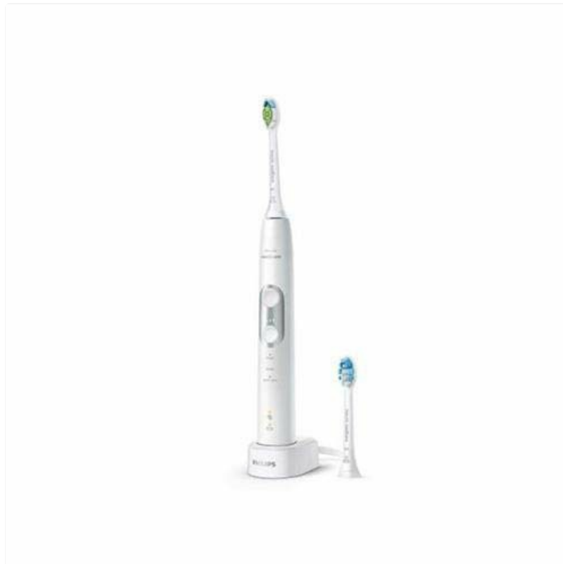
Image 1: Philips Sonicare ProtectiveClean Premium Electric Toothbrush HX6897/25. This image displays the main unit of the electric toothbrush.

This manual provides essential information for the safe and effective use of your Philips Sonicare ProtectiveClean Premium Electric Toothbrush, model HX6897/25. Please read these instructions carefully before first use and retain them for future reference. This toothbrush is designed to provide superior plaque removal and improve gum health through its advanced sonic technology.