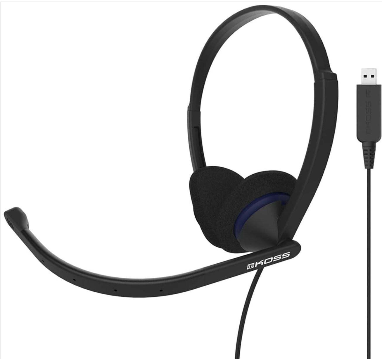
Image: The Koss CS200 USB Communication Headset, showcasing its on-ear design and integrated microphone.