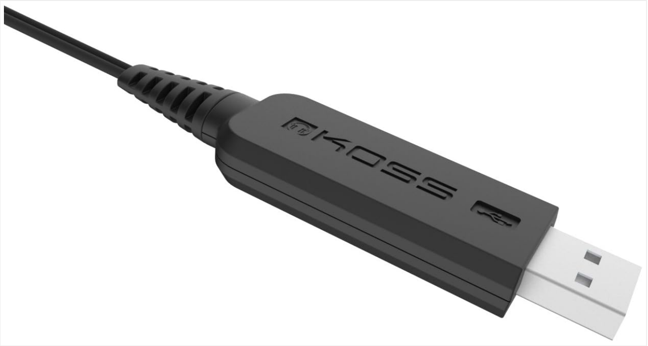
Image: Close-up of the USB connector, ready for connection to a computer.