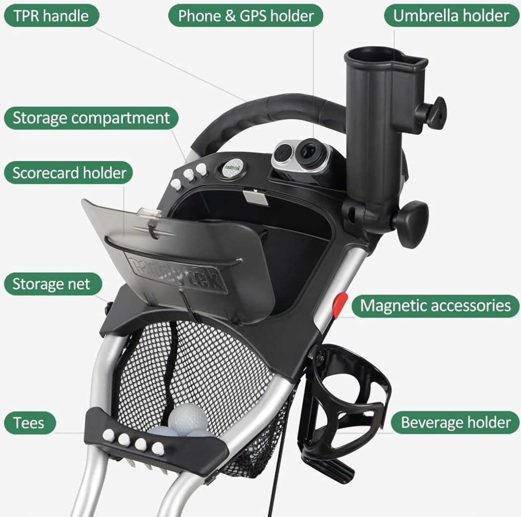
Figure 5: Overview of the accessory console.