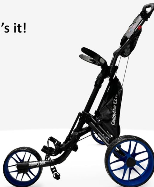
Figure 1: The Caddytek CaddyLite EZ Fold Version 8 Golf Push Cart fully unfolded.