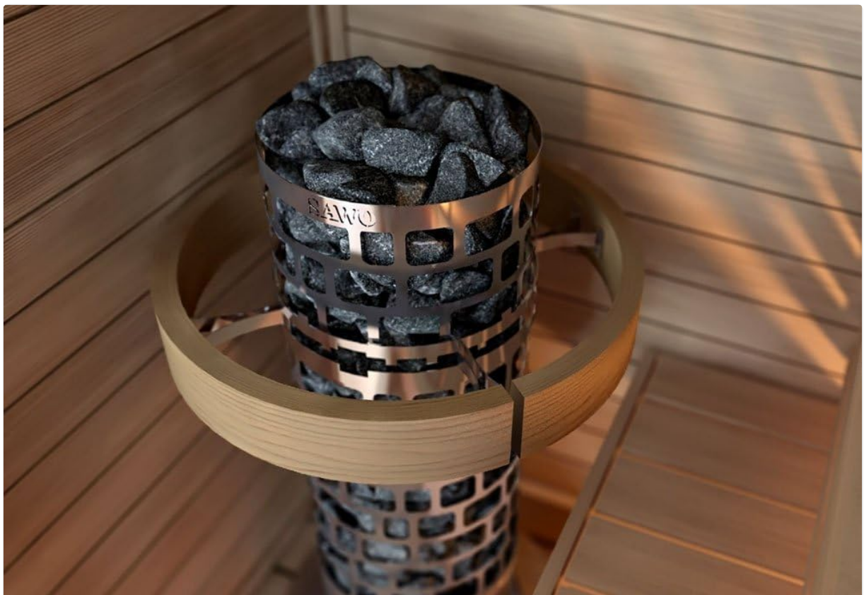
Figure 3: Detailed view of the SAWO ARI-GUARD-W3-A safety rail, showing the wooden segments and stainless steel frame in place around the heater.