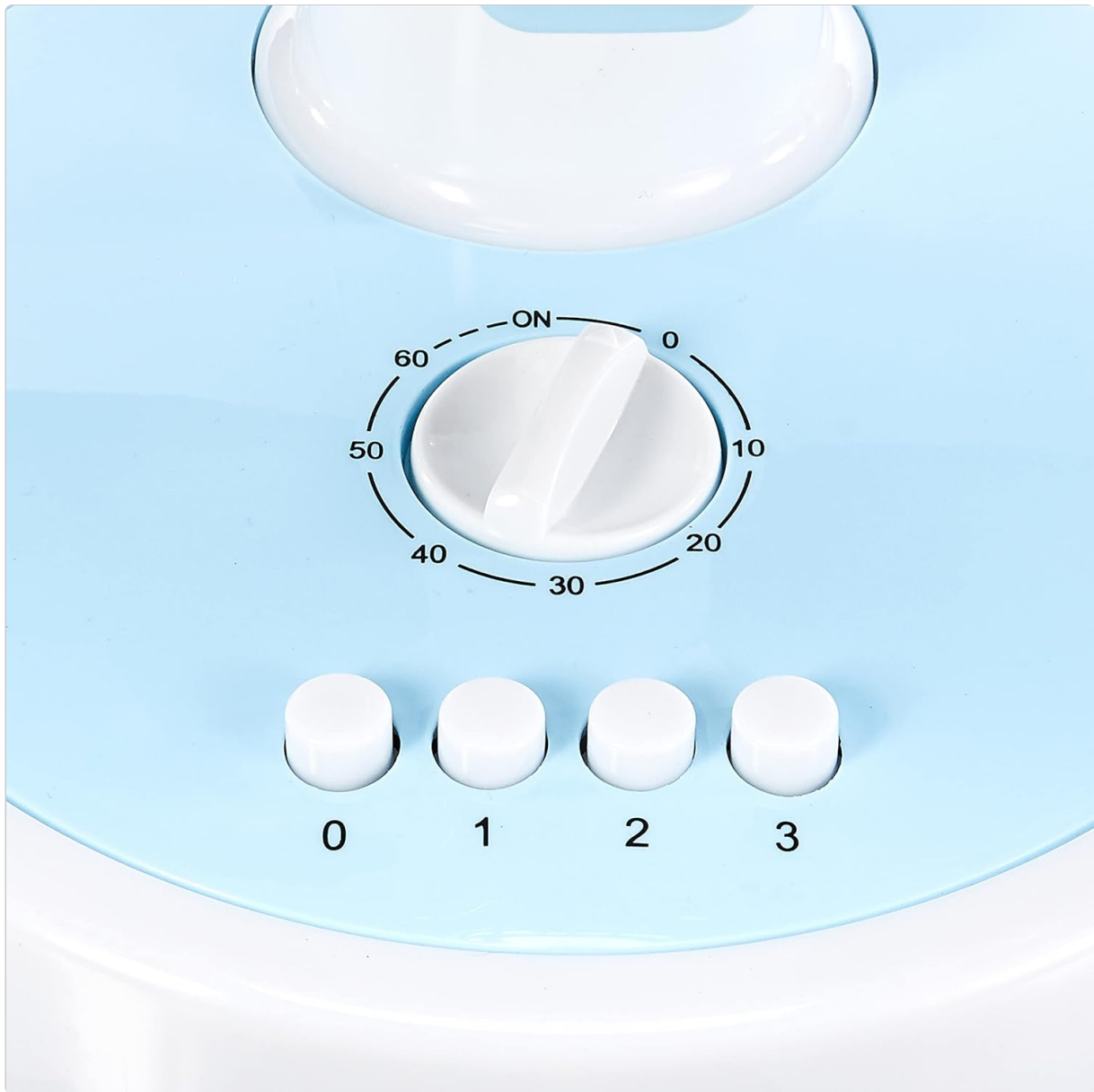
Figure 2: Close-up of the control panel with speed and timer settings.