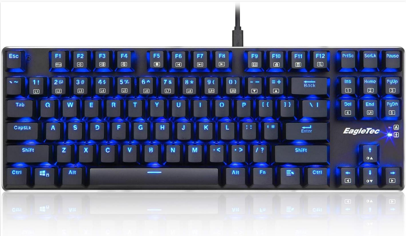
Image 1.1: Front view of the EagleTec KG060-BR keyboard with blue backlighting activated.

This manual provides instructions for the EagleTec KG060-BR Low Profile Mechanical Gaming Keyboard. This 87-key compact keyboard features blue LED backlighting, mechanical switches, and a durable aluminum-ABS construction. It is designed for use with personal computers for both typing and gaming.