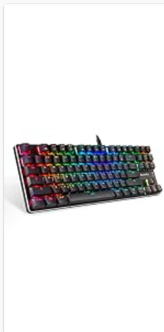
Image 7.2: Image highlighting the durable aluminum construction of the keyboard.