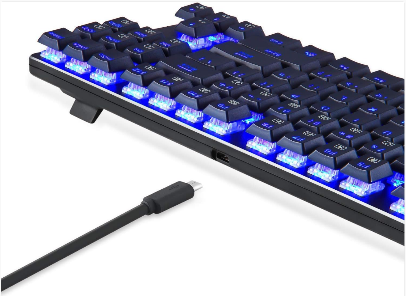
Image 3.1: Close-up view of the detachable USB-C cable connecting to the keyboard's port.