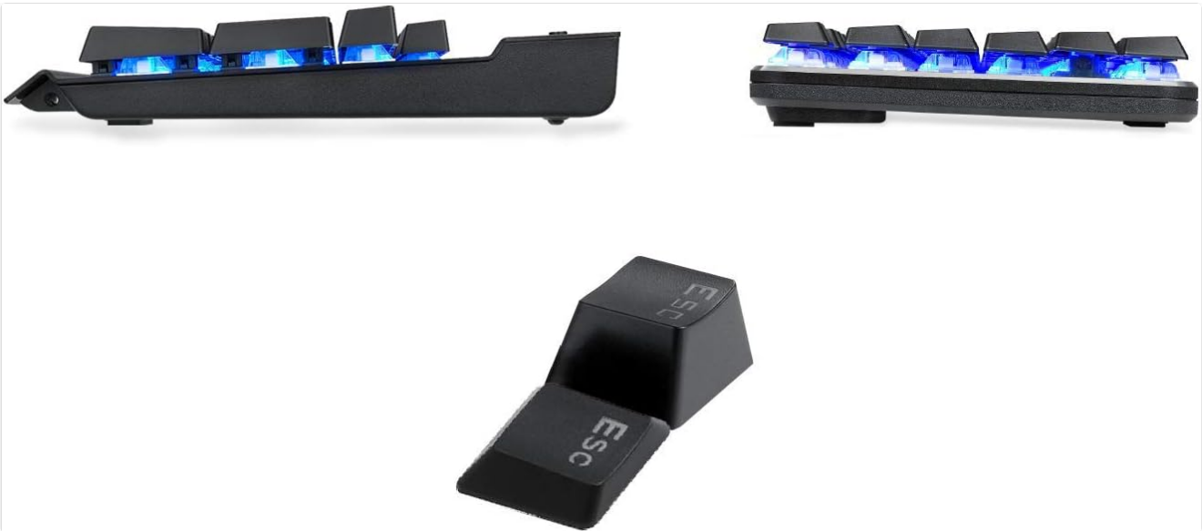
Image 5.2: Side profile views of the keyboard showing its height and an example of a detached keycap.