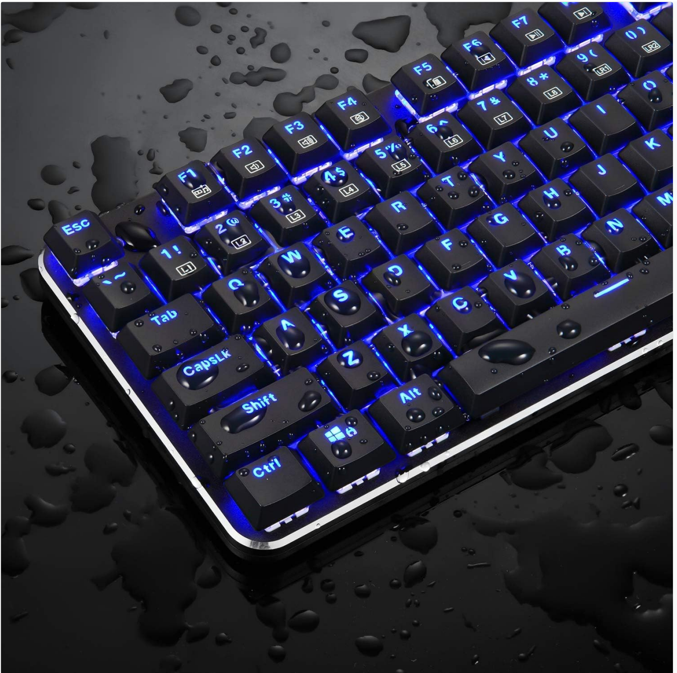
Image 5.1: The keyboard surface with water droplets, illustrating its splash-proof design.