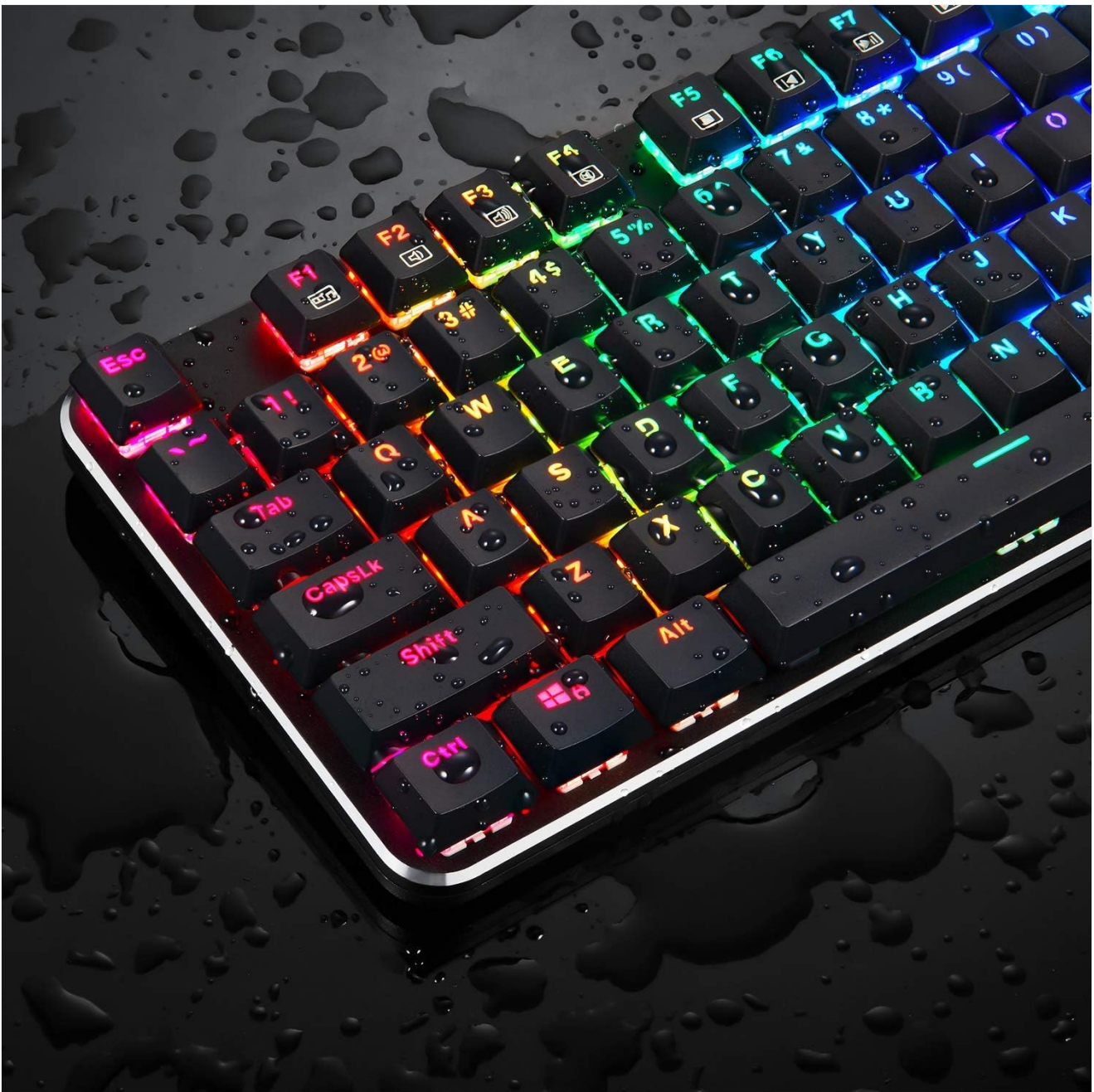
Image: Keyboard with water droplets, illustrating its splash-proof feature.