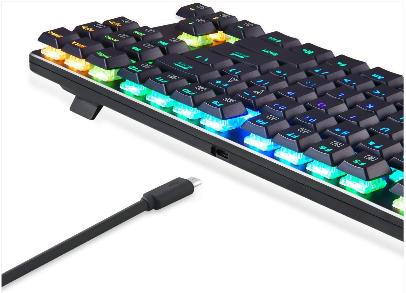
Image: The detachable micro USB cable connecting to the keyboard's port.

The keyboard is plug-and-play and should be automatically recognized by your operating system. It is compatible with Windows 10, Windows 8, Windows 7, Windows Vista, Windows XP, and offers limited Mac OS keyboard support.