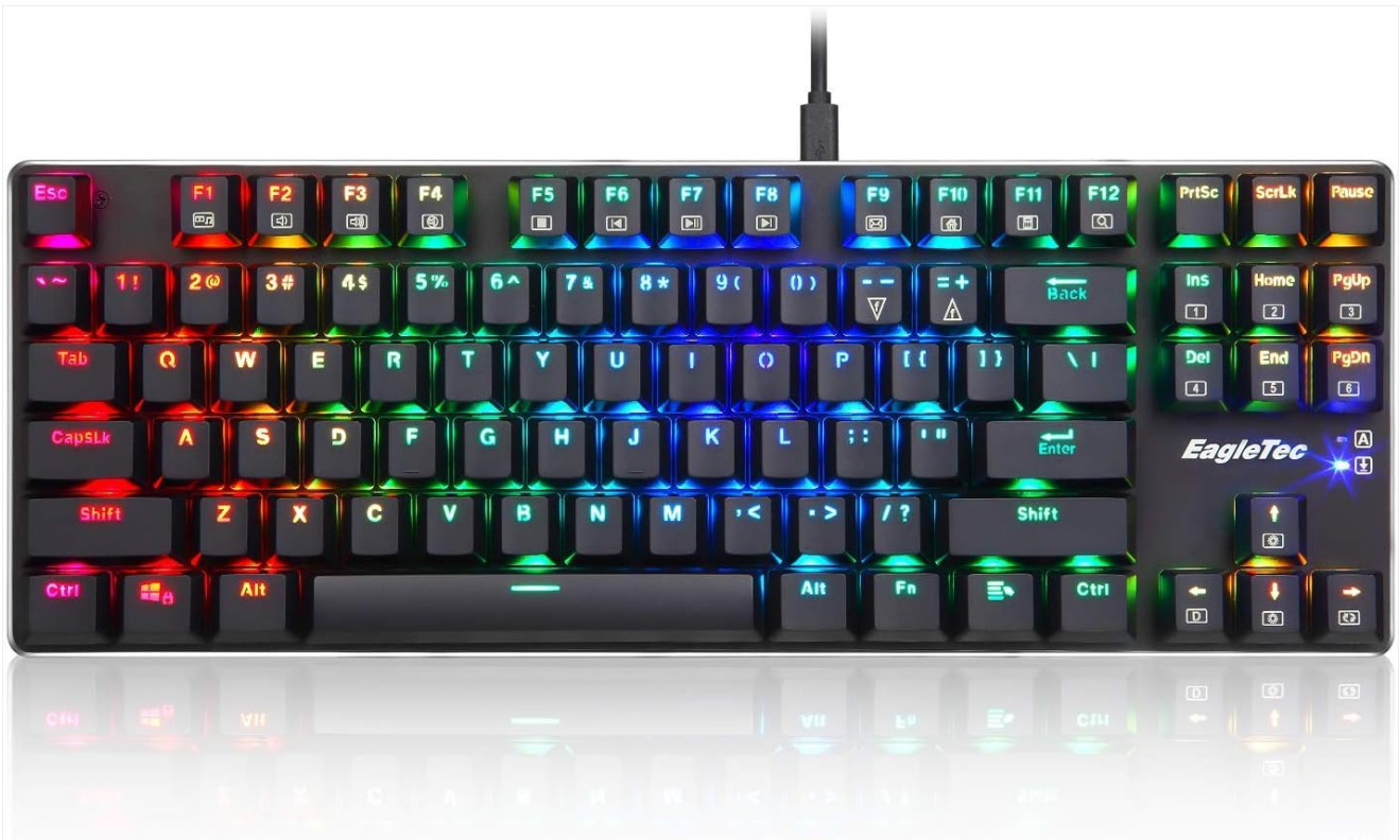
Image: Top-down view of the keyboard showcasing its vibrant RGB backlighting.