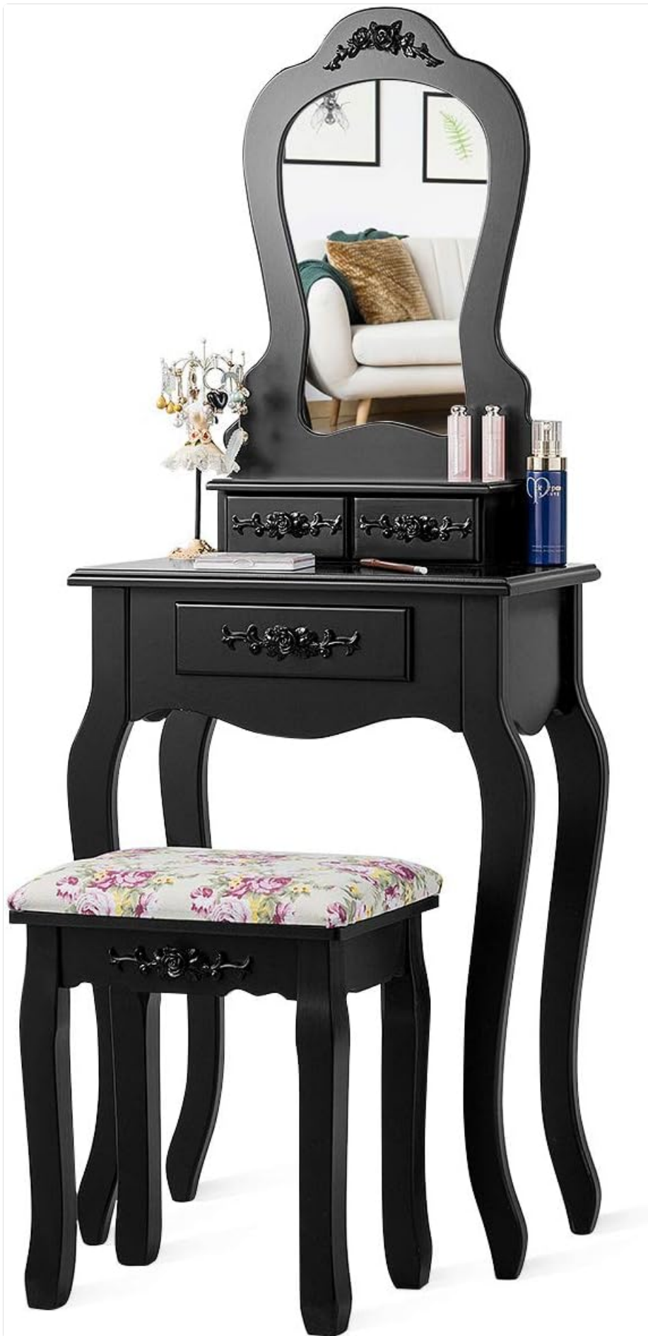
Figure 8.1: Details of the vanity's construction and features.