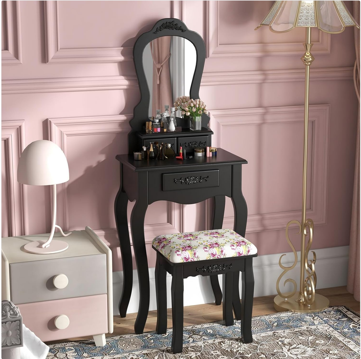
Figure 3.1: Complete Giantex Small Vanity Desk Set.