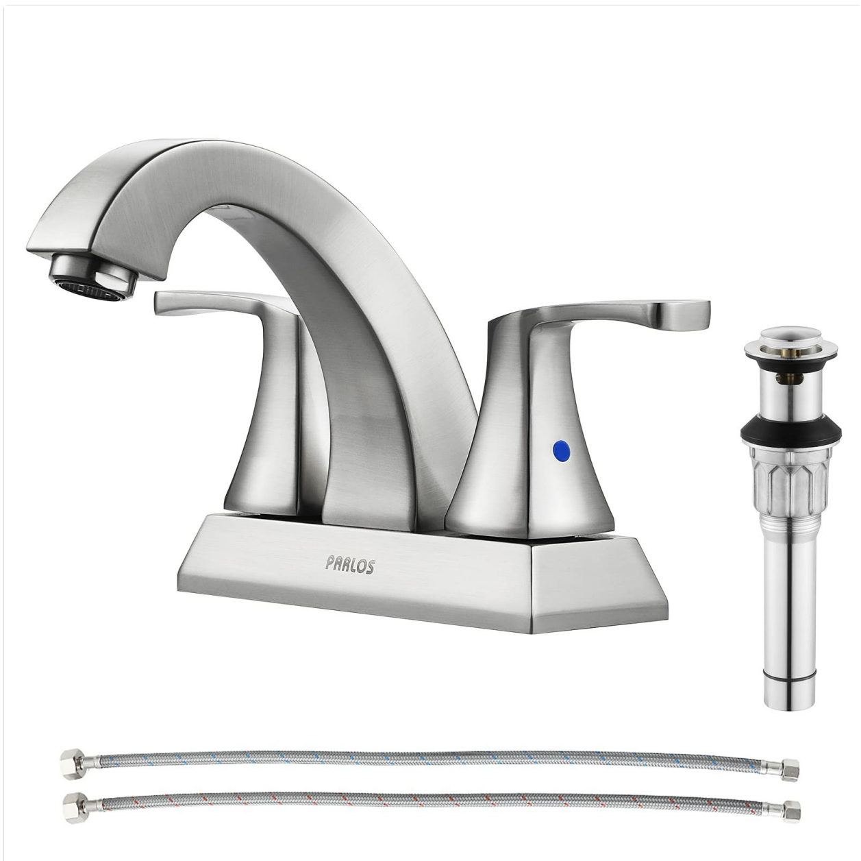
Image 1.1: The PARLOS Doris 14072 faucet highlighting its mid-arc spout, NEOPERL aerator, and HENT cartridge.