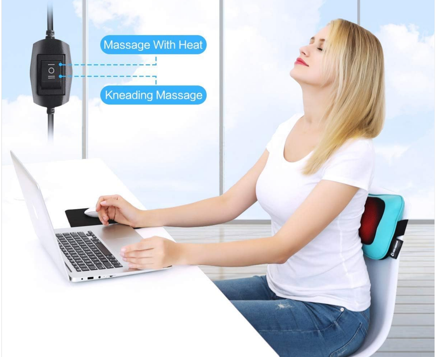
Image: The Mo Cushle massager with its red heat nodes illuminated, indicating the heat function is active during a massage session.