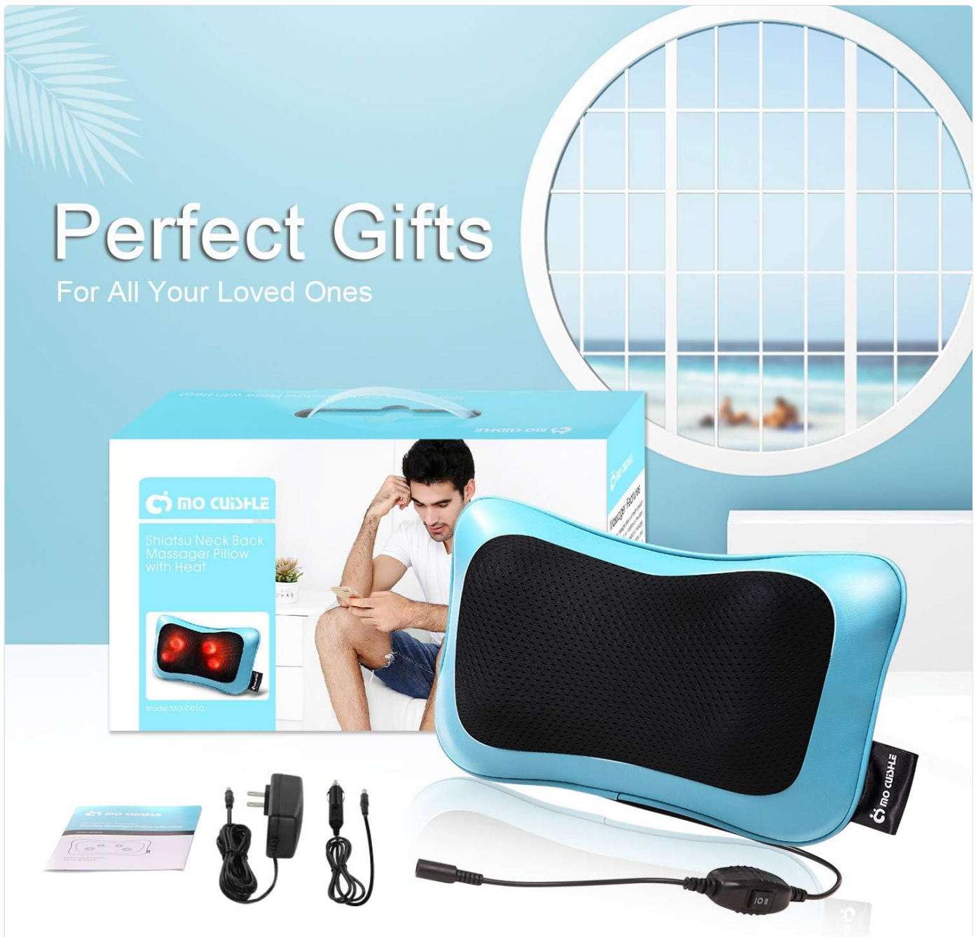
Image: Mo Cuishle massager shown with its included AC power adapter and car adapter, ready for use in various settings.