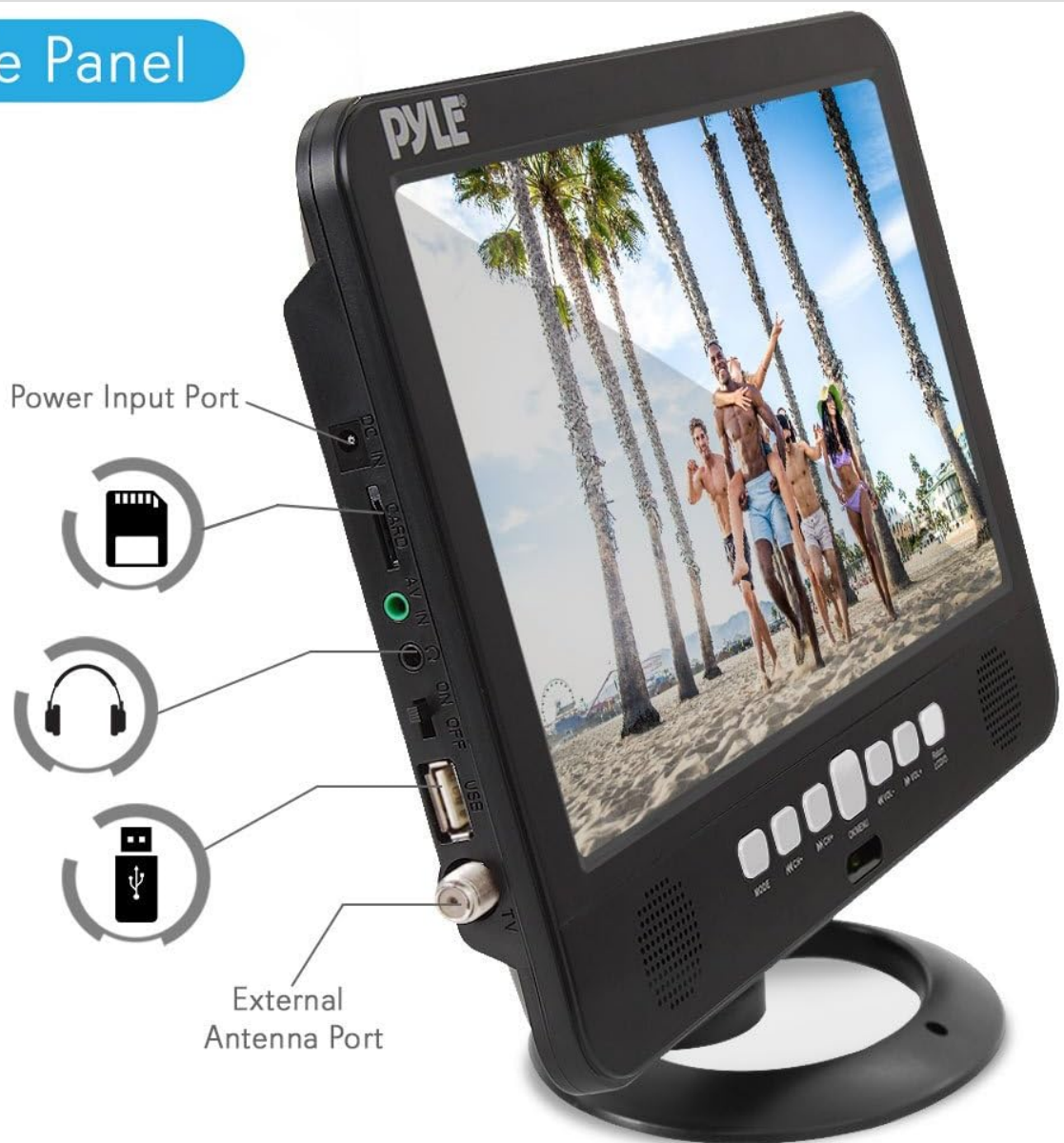
Figure 4: Side Panel Connections. This image highlights the various input and output ports located on the side of the Pyle PLTV1053.