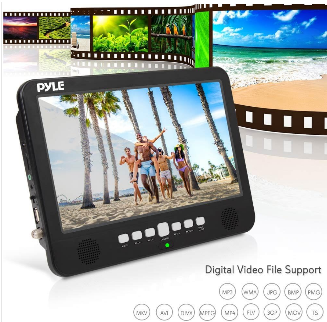
Figure 5: Digital Video File Support. This image illustrates the wide range of digital video file formats supported by the Pyle PLTV1053, including MKV, AVI, DIVX, MPEG, MP4, FLV, 3GP, MOV, TS, MP3, WMA, JPG, BMP, and PMG.