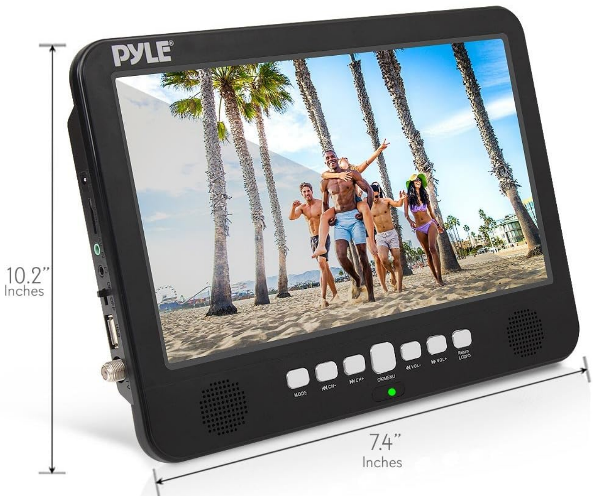
Figure 6: Product Dimensions. This image shows the Pyle PLTV1053 with its length and width dimensions indicated.