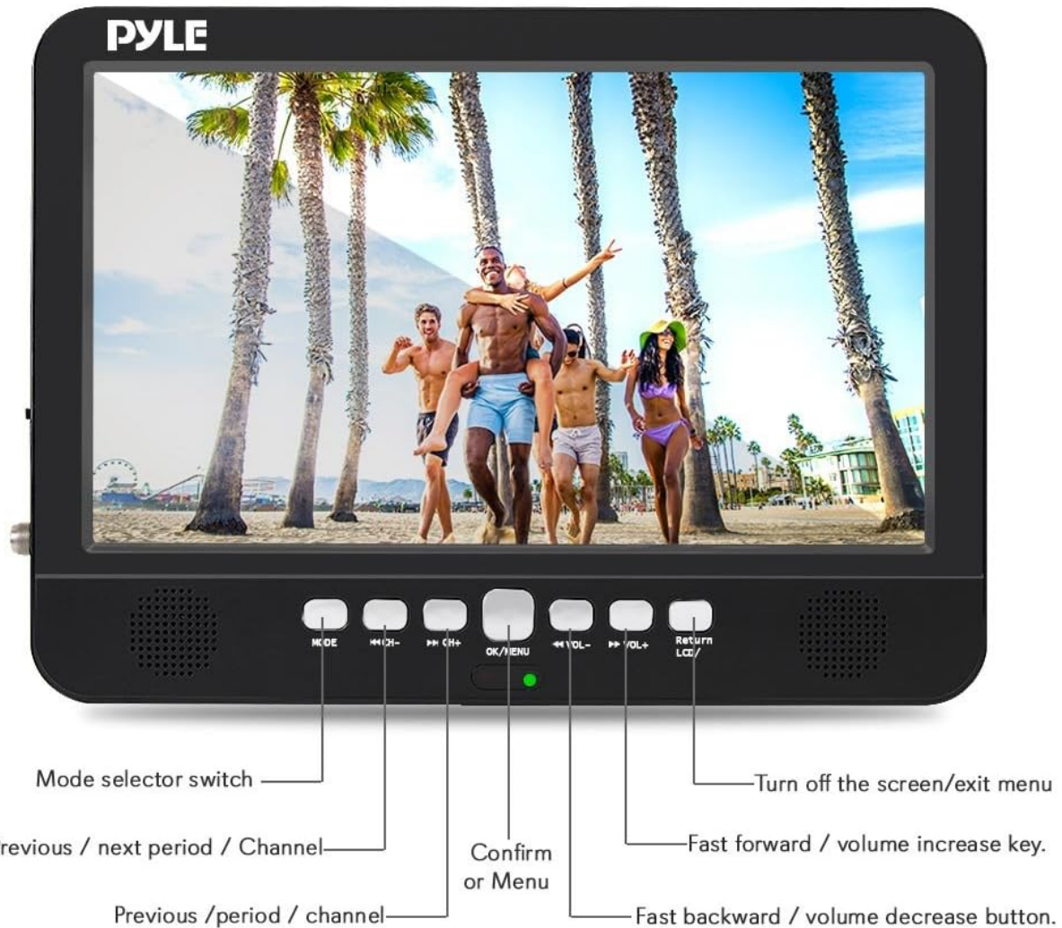
Figure 3: Front Panel Layout. This image shows the front of the Pyle PLTV1053 with its control buttons labeled.