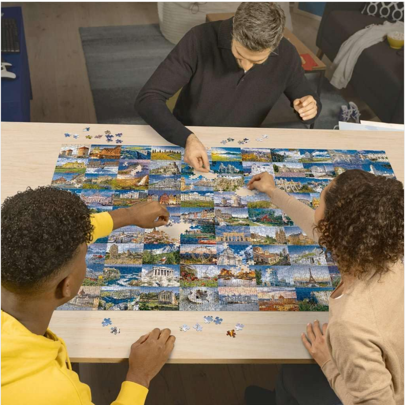
Image: Two individuals collaboratively assembling the large 3000-piece Ravensburger puzzle on a table, demonstrating the engaging nature of the activity.

Your browser does not support the video tag.