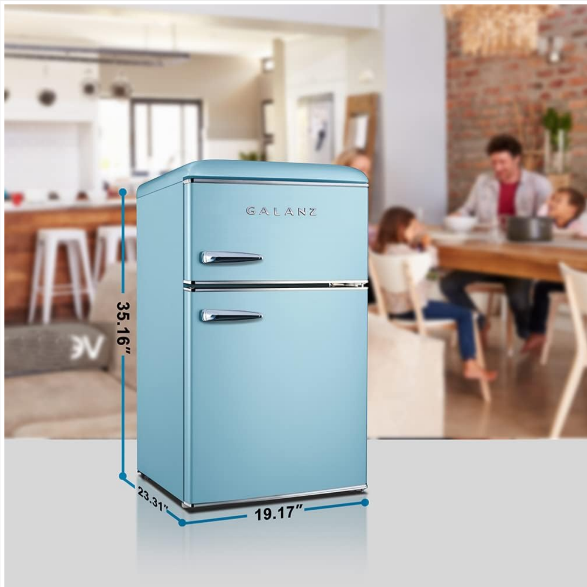
Figure 4: Product dimensions for proper placement.