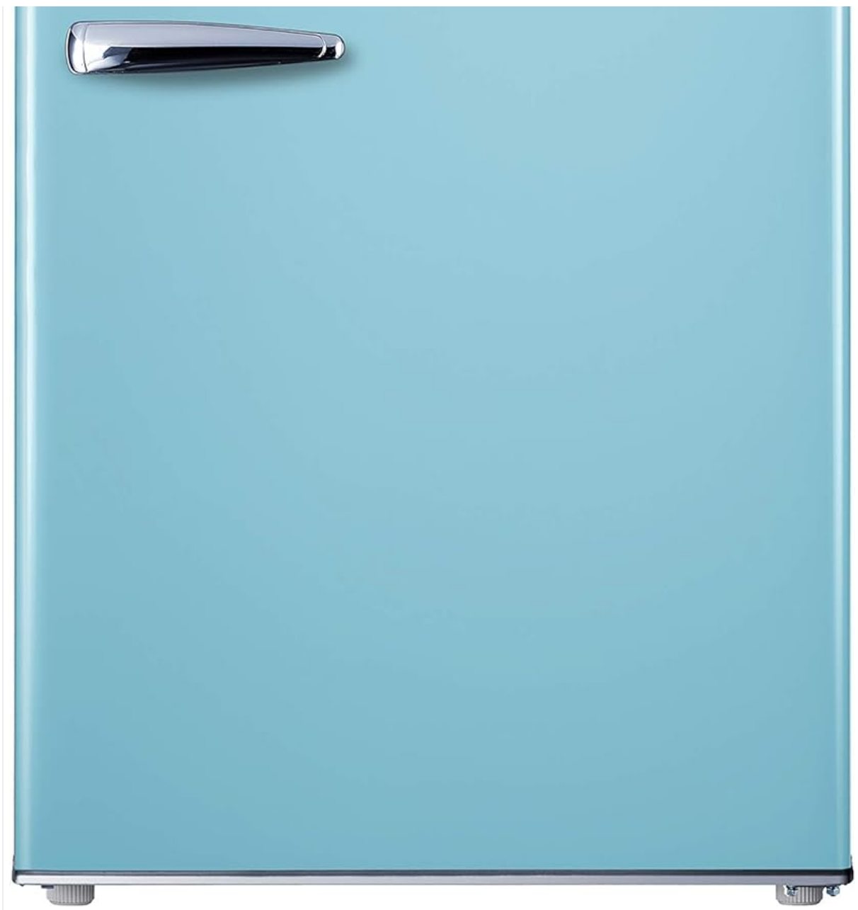
Figure 1: Front view of the Galanz Retro Compact Refrigerator in blue.