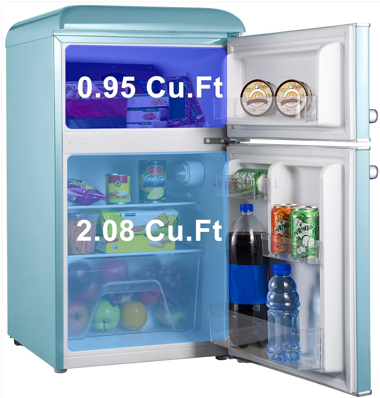
Figure 3: Interior view showing fresh food and freezer capacities.