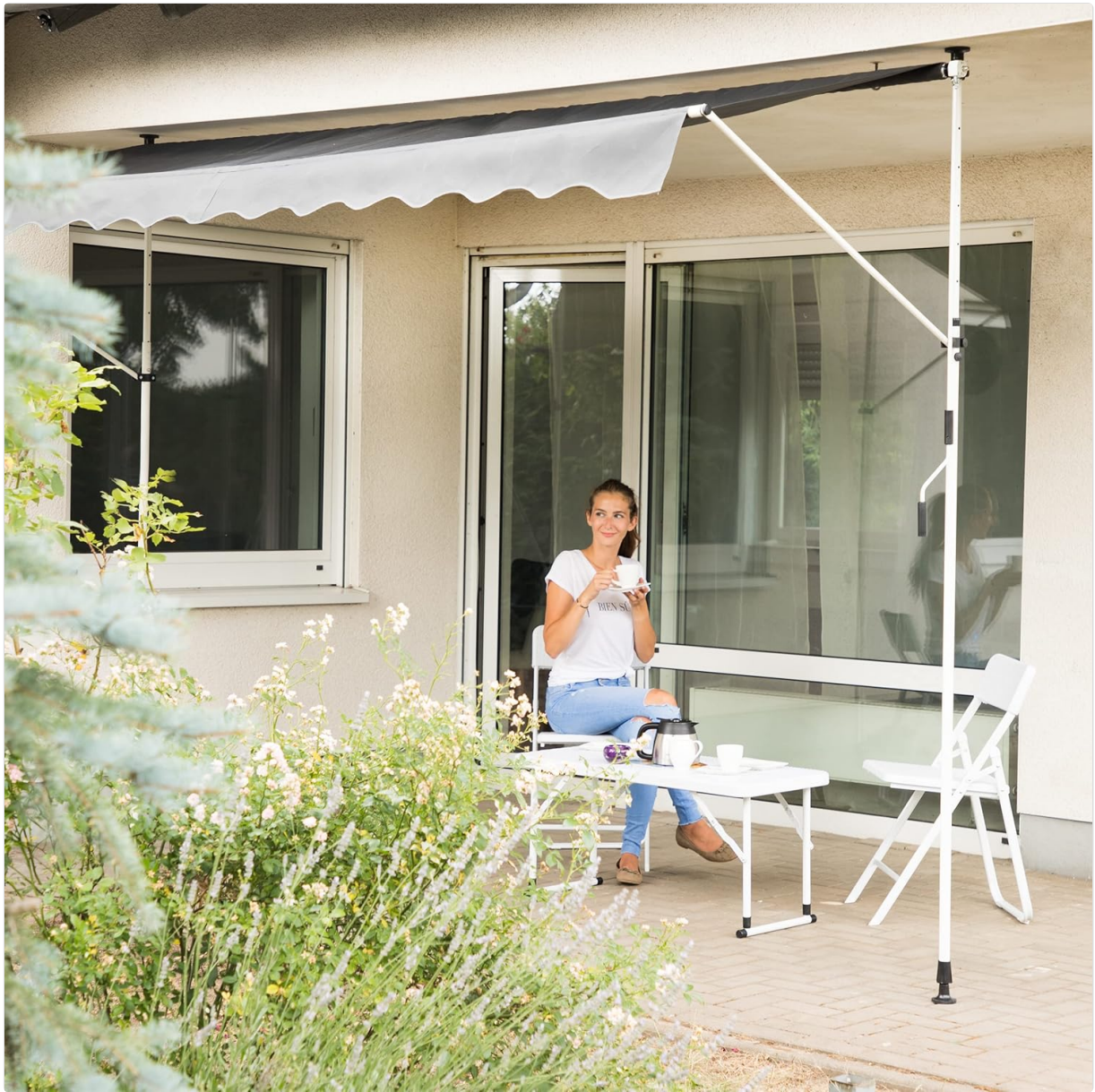
The Relaxdays Balcony Awning provides effective shade and protection, enhancing your outdoor living space.