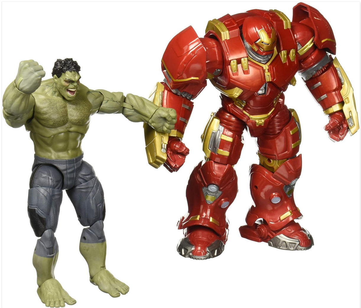
Image 1: Front view of the Dark Hulk and Hulkbuster figures. The Hulk figure is green with purple shorts, posed as if punching. The Hulkbuster figure is red and gold, standing tall and armored.