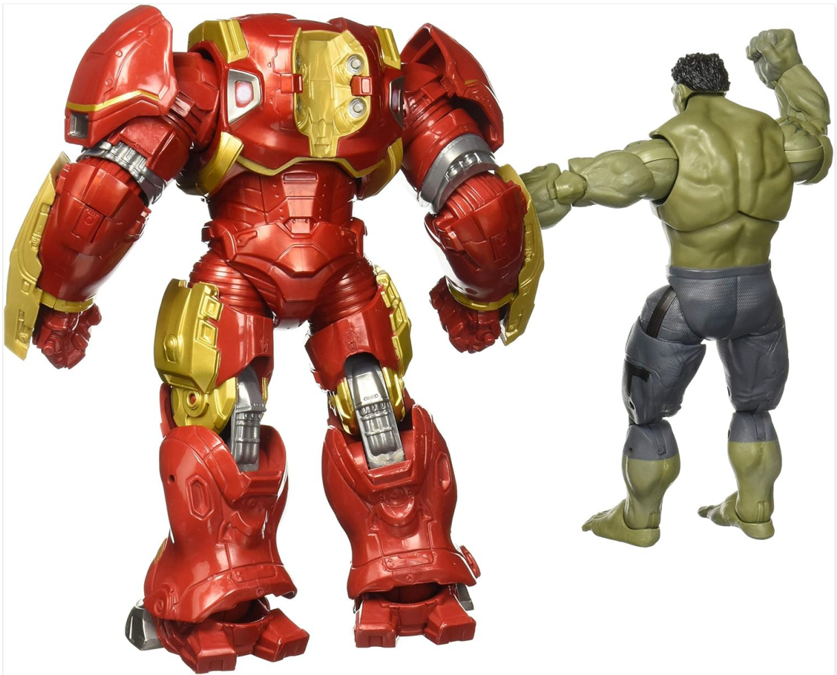
Image 2: Rear view of the Dark Hulk and Hulkbuster figures, showcasing their back detailing and articulation points.