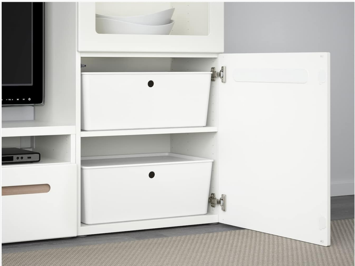
Figure 3: Two Kuggis boxes neatly placed within a shelving unit, demonstrating their suitability for integrated storage solutions. This image highlights how the boxes can be used to organize items within furniture, maintaining a clean aesthetic.