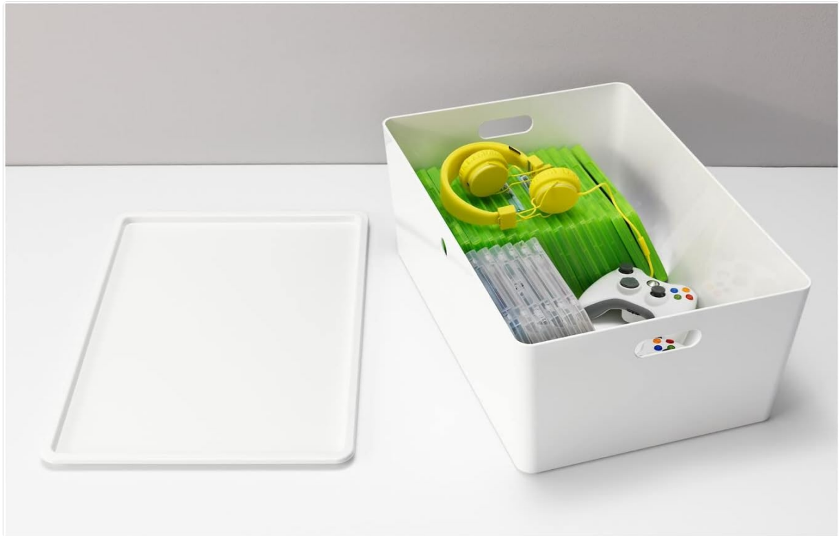
Figure 2: The Kuggis box with its lid removed, showcasing the interior capacity. The lid is placed next to the box, demonstrating the two separate components. The box is shown holding various personal items, illustrating its storage potential.