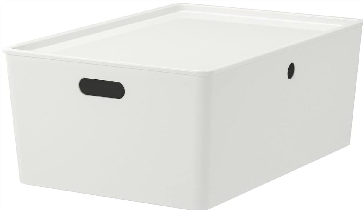
Figure 1: The IKEA Kuggis Box with Lid, presented in its complete form. This image displays the box and its fitted lid, highlighting its smooth white finish and integrated handle cutouts on the sides.

The IKEA Kuggis Box with Lid is a versatile storage solution designed to help organize various items in your home or office. Made from durable PET plastic, this white storage box features a clean, modern design and a secure lid to protect contents from dust and maintain a tidy appearance. Its lightweight construction and integrated handles make it easy to handle and relocate.