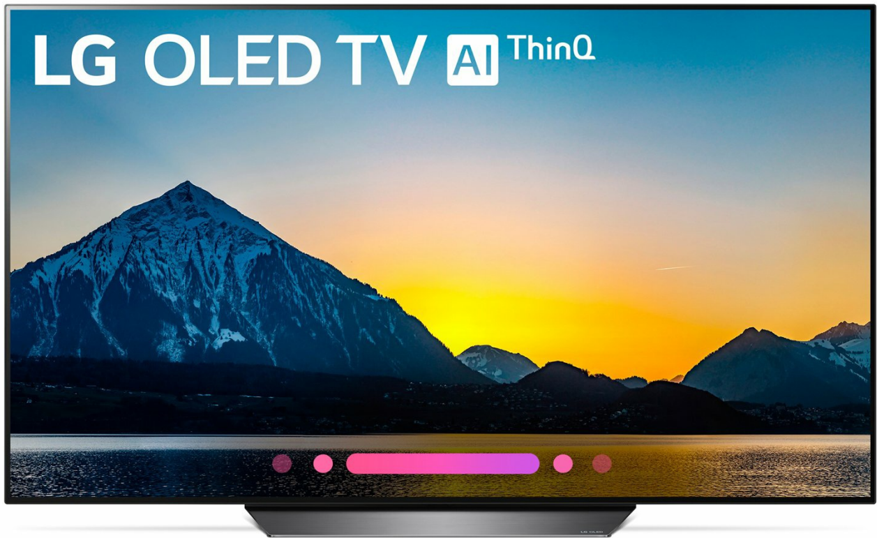
Image 1.1: LG OLED65B8PUA 65-inch 4K Ultra HD Smart OLED TV in a modern living room setting. This image shows the television positioned on a low media console, displaying a vibrant landscape.