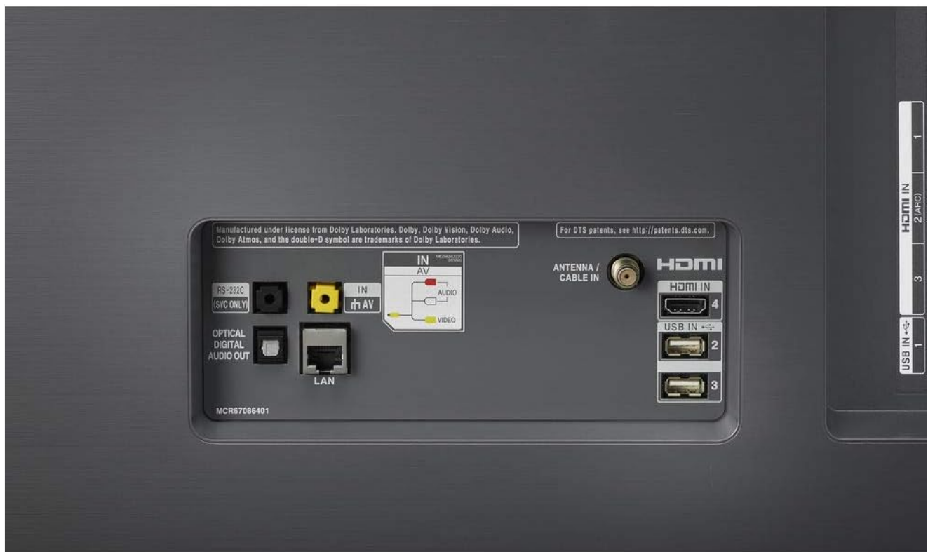
Image 2.2: Close-up view of the rear input ports on the LG OLED65B8PUA TV. This image clearly labels the HDMI, USB, RF, Composite In, Ethernet, Optical Digital Audio Out, and RS232C ports.