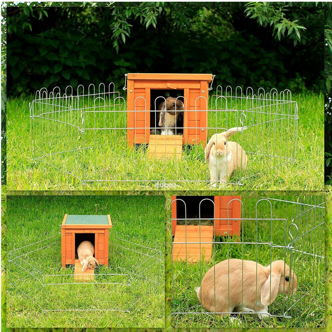
Figure 5.2: Hutch integrated with an outdoor run.