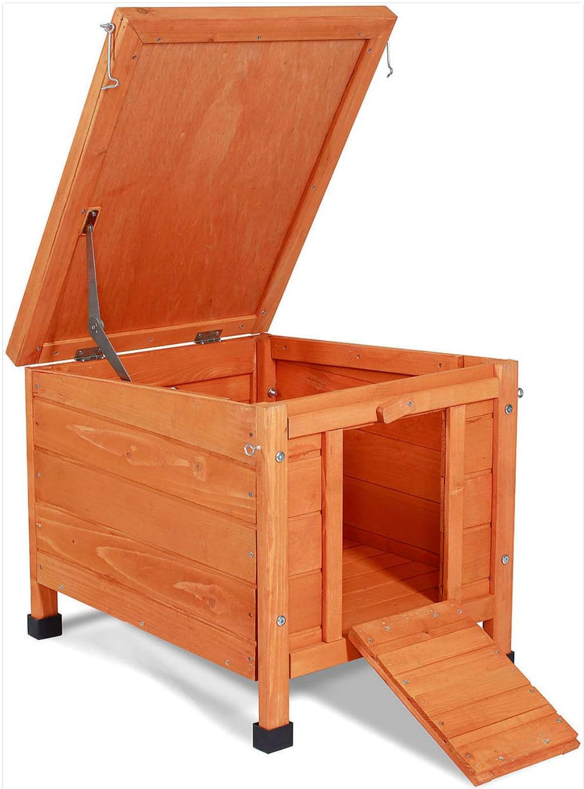
Figure 4.3: Hutch with open roof and extended ramp.

8. Final Check: Verify that all screws are tightened and all parts are securely in place.