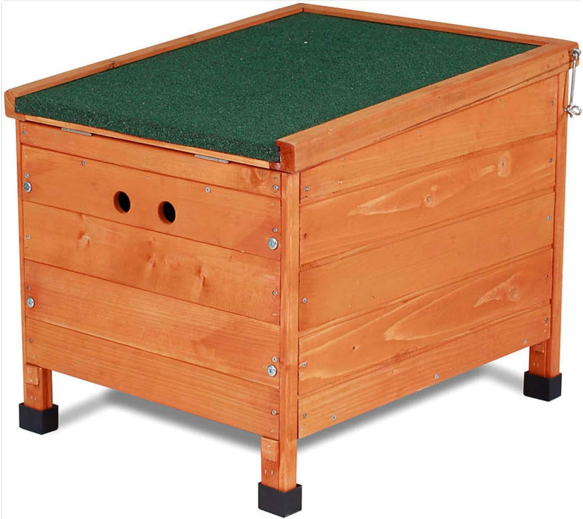
Figure 5.1: Ventilation holes on the hutch.