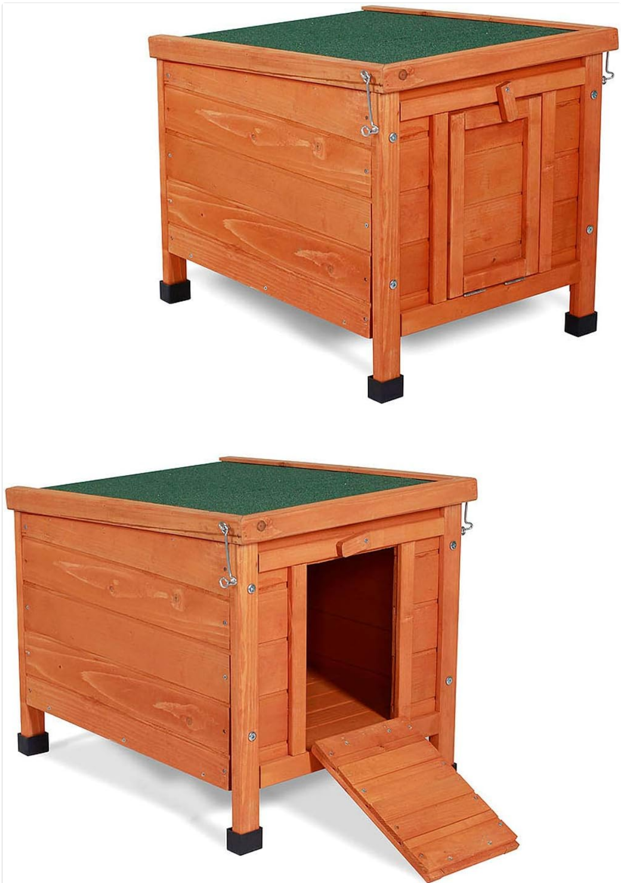
Figure 4.4: Assembled hutch, closed view.