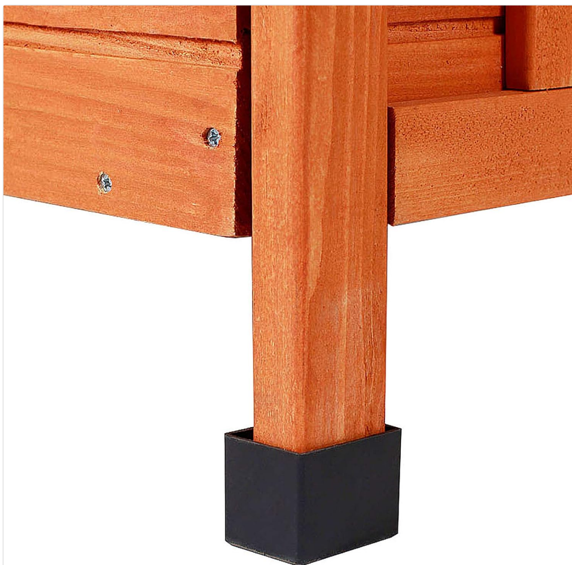
Figure 4.1: Plastic foot cover installation.