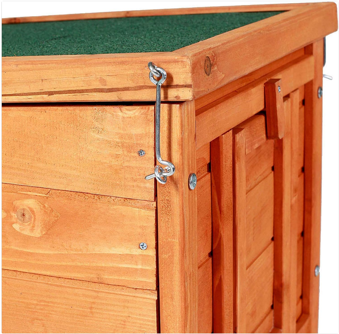
Figure 4.2: Roof latch mechanism.