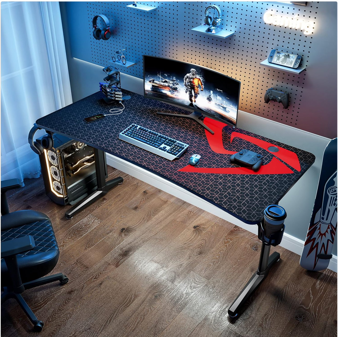
Image: Fully assembled EUREKA ERGONOMIC Gaming Desk, showcasing the side storage unit with drawers and tower space.