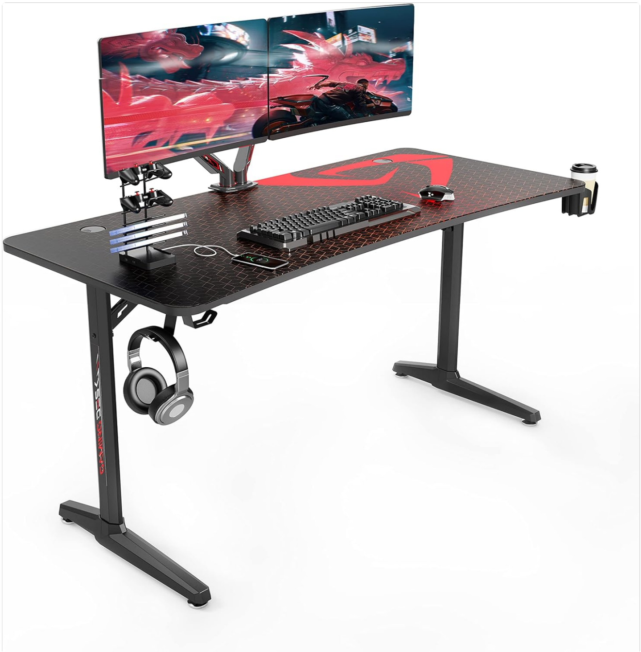
Image: The EUREKA ERGONOMIC Gaming Desk set up with a monitor, keyboard, mouse, and showing the convenient placement of the headphone hook and cup holder.