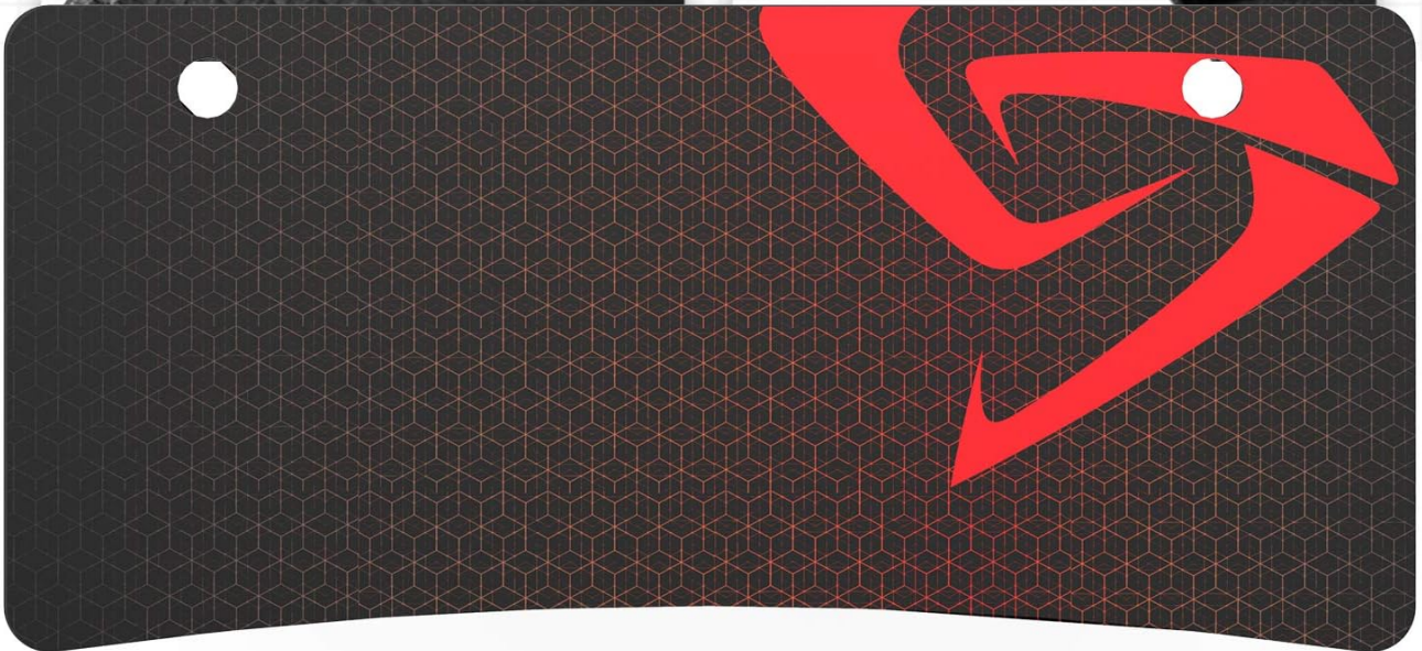
Image: Detailed view of the full-covered mouse pad, emphasizing its anti-slip rubber base and durable knitted edge for enhanced performance.