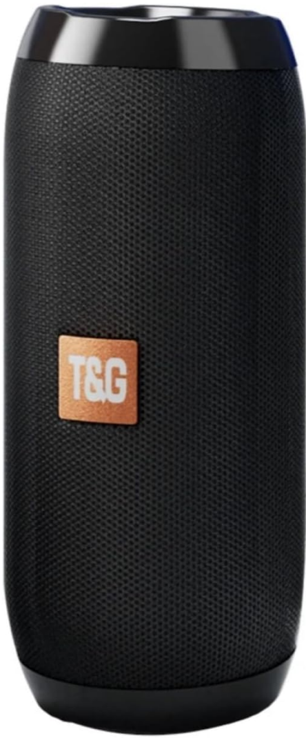
Figure 3.1: Front view of the T&G117 Portable Bluetooth Speaker, showcasing its black mesh exterior and T&G logo.