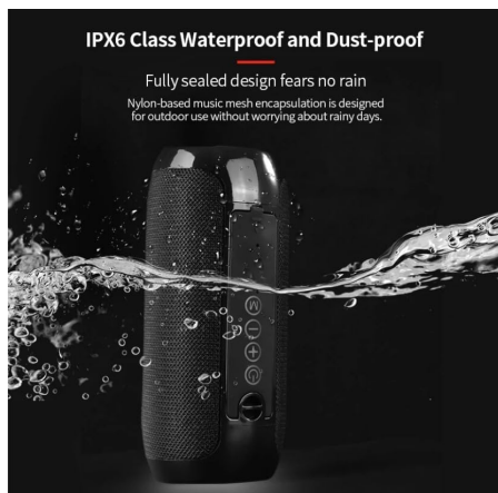
Figure 3.3: The speaker submerged in water, illustrating its IPX6 waterproof capability, suitable for outdoor environments.