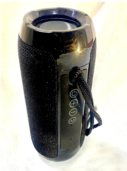
Figure 3.2: Side view of the speaker, highlighting the control panel with power, volume, and mode buttons.