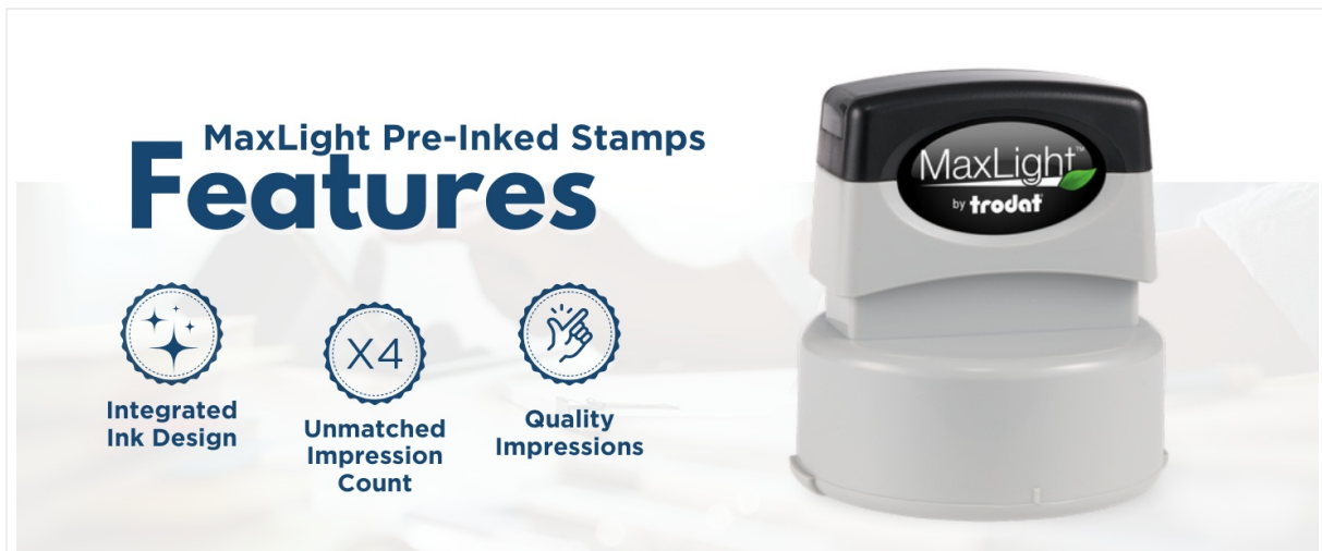
Image 2.1: Overview of MaxLight Pre-Inked Stamp features, highlighting integrated ink design, impression count, and quality.