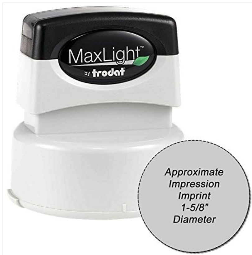
Image 1.1: The MaxLight XL2-535 Pre-Inked Stamp, a self-contained unit designed for clear impressions.

This manual provides instructions for the proper use and maintenance of your MaxLight XL2-535 Pre-Inked Stamp. Designed for efficiency and durability, this stamp delivers clear, consistent impressions for various applications. Please read this manual thoroughly to ensure optimal performance and longevity of your product.