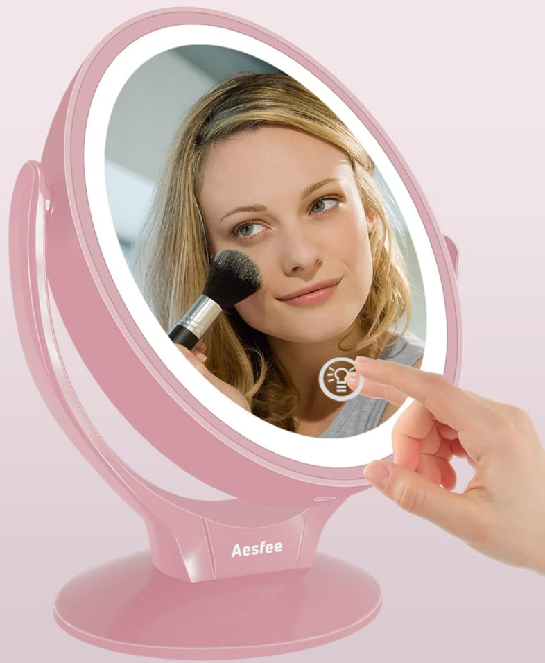
Image: The touch button on the mirror surface controls the power and brightness settings of the LED lights.

Charge Status Indication: Blue - fully charged Red - charging