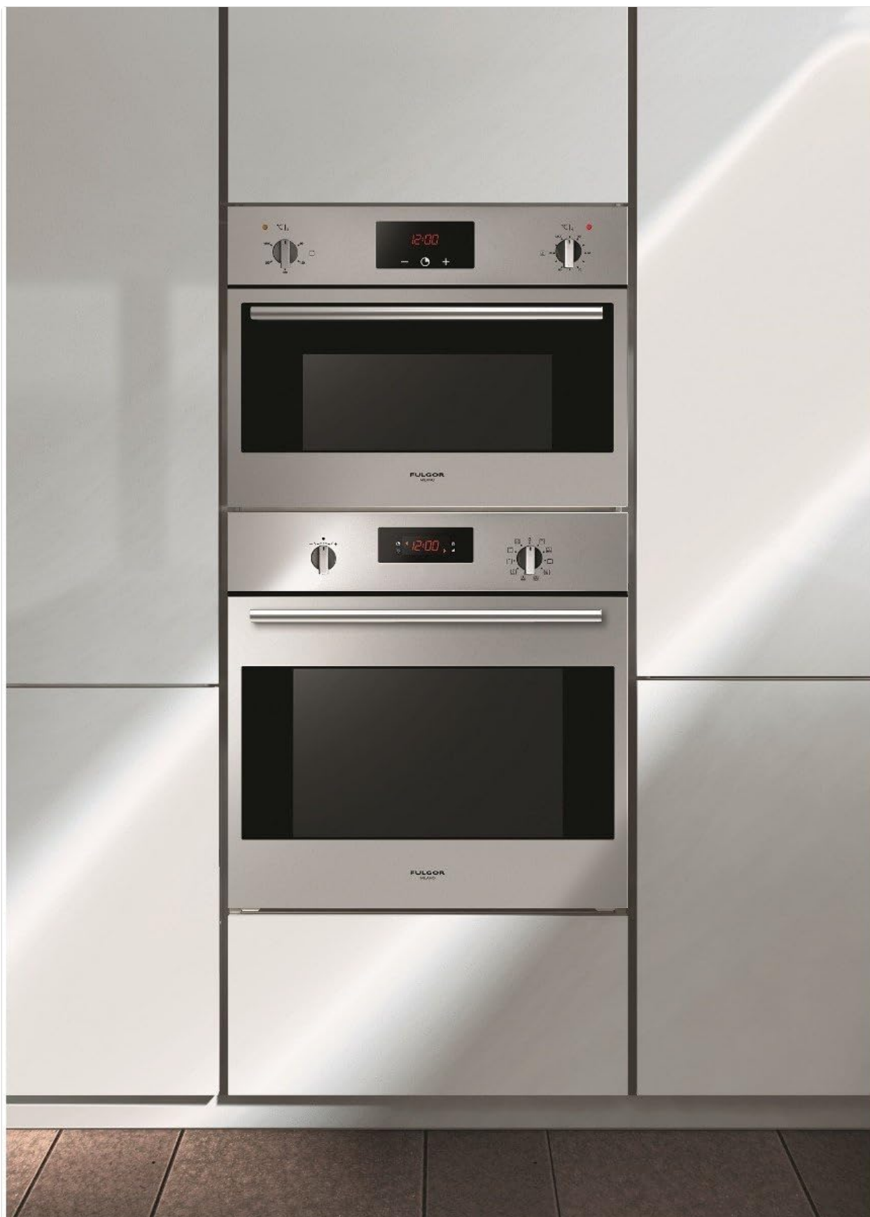
Image 2.1: The Fulgor Milano FQSO 4505 MT X Compact Steam Oven integrated into kitchen cabinetry.